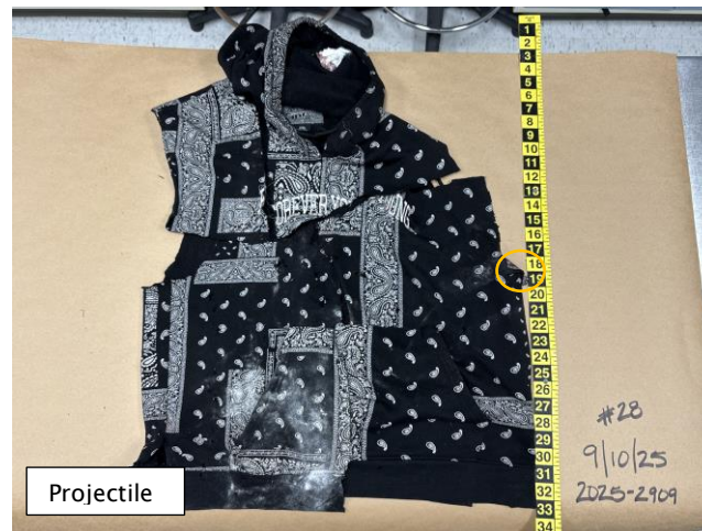
Figure 4, Front of black and white hooded vest

Officer Involved Critical Incident - Stanhope-Kelloggsville Rd. and Anderson Rd., Denmark Township, OH 44032, Ashtabula County