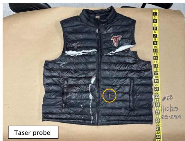
Figure 1, Front of Atlanta Falcons vest

On Wednesday, September 10, 2025, Ohio Bureau of Criminal Investigation (BCI) Special Agent (SA) Dan Boerner (SA Boerner) examined Jerry Pegram's clothing (Matrix Item 50). The clothing was collected on Monday, September 8, 2025, and was stored in the drying room at the BCI Richfield Office. The clothing consisted of a black Atlanta Falcons vest (Ozark Trail, size 2XL) and a black and white hooded vest (Forever Young, size 2XL). The clothing was photographed as it was found and examined for items of suspected evidence. A taser probe was located on the right front of the Atlanta Falcons vest. The probe penetrated the exterior of the vest but did not go through the inner lining. A projectile was located on the right front of the black and white hooded vest. The projectile was photographed as it was found and collected as evidence (Matrix Item 51).