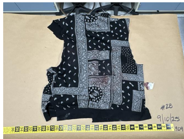
Figure 5, Back of black and white hooded vest

This document is the property of the Ohio Bureau of Criminal Investigation and is confidential in nature. Neither the document nor its contents are to be disseminated outside your agency except as provided by law - a statute, an administrative rule, or any rule of procedure.