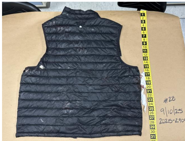
Figure 3, Back of Atlanta Falcons vest

This document is the property of the Ohio Bureau of Criminal Investigation and is confidential in nature. Neither the document nor its contents are to be disseminated outside your agency except as provided by law - a statute, an administrative rule, or any rule of procedure.