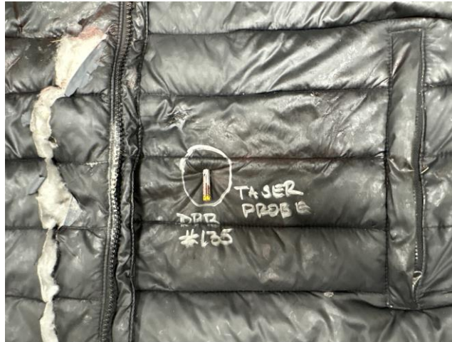
Figure 2, Taser probe

Officer Involved Critical Incident - Stanhope-Kelloggsville Rd. and Anderson Rd., Denmark Township, OH 44032, Ashtabula County