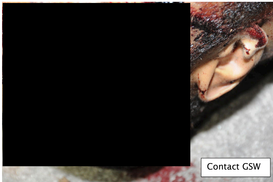
Figure 20, Overall photograph

This document is the property of the Ohio Bureau of Criminal Investigation and is confidential in nature. Neither the document nor its contents are to be disseminated outside your agency except as provided by law - a statute, an administrative rule, or any rule of procedure.