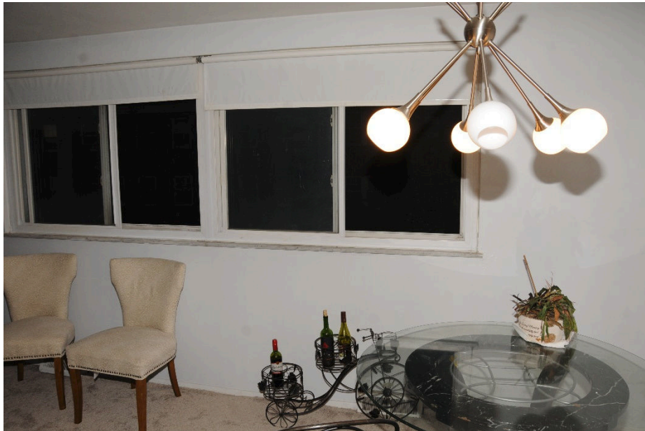
Figure 4, Overall photograph

Officer Involved Critical Incident - 16100 Van Aken Blvd., Shaker Heights, OH