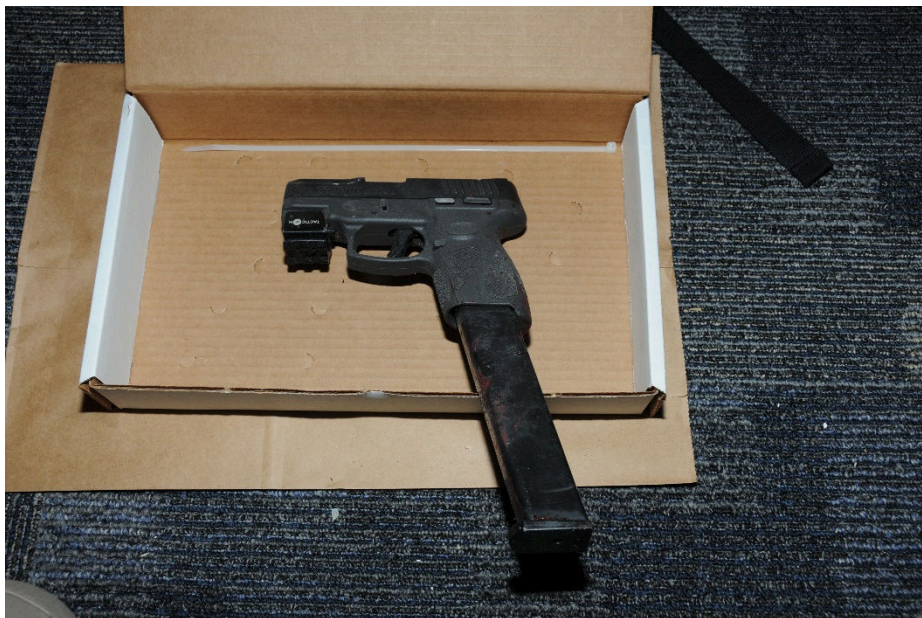
Figure 15, Item 8

This document is the property of the Ohio Bureau of Criminal Investigation and is confidential in nature. Neither the document nor its contents are to be disseminated outside your agency except as provided by law - a statute, an administrative rule, or any rule of procedure.