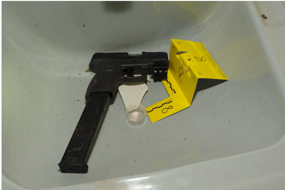
Figure 14, Item 8

Officer Involved Critical Incident - 16100 Van Aken Blvd., Shaker Heights, OH