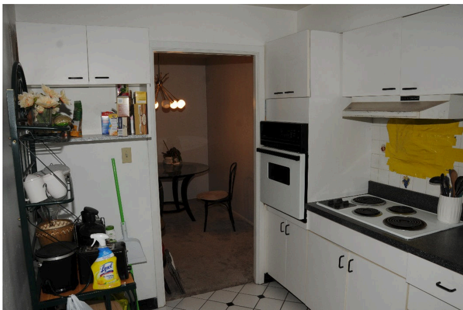
Figure 3, Overall photograph

This document is the property of the Ohio Bureau of Criminal Investigation and is confidential in nature. Neither the document nor its contents are to be disseminated outside your agency except as provided by law - a statute, an administrative rule, or any rule of procedure.