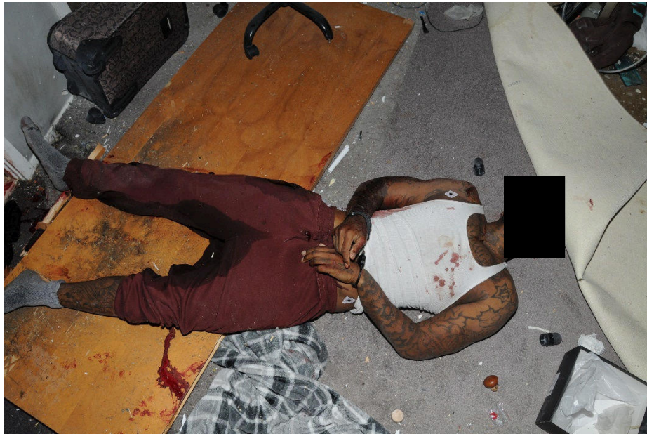
Figure 17, Overall photograph

Officer Involved Critical Incident - 16100 Van Aken Blvd., Shaker Heights, OH