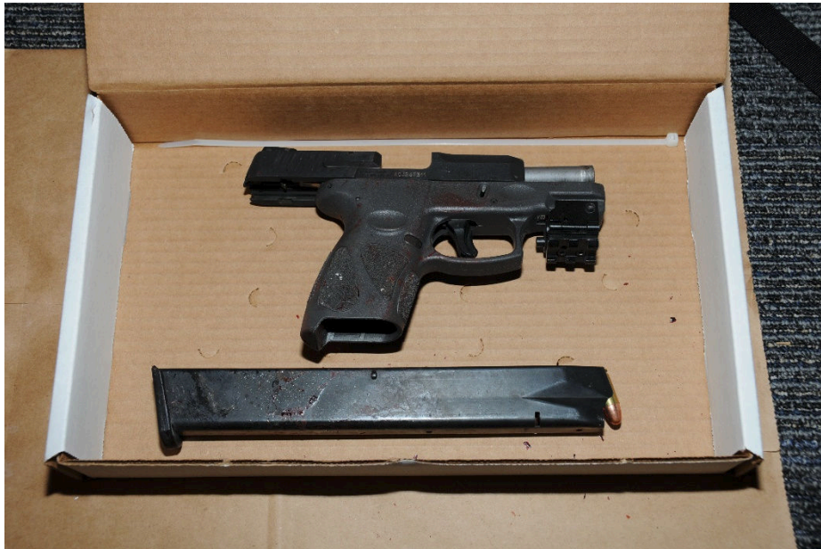
Figure 16, Item 8

Officer Involved Critical Incident - 16100 Van Aken Blvd., Shaker Heights, OH