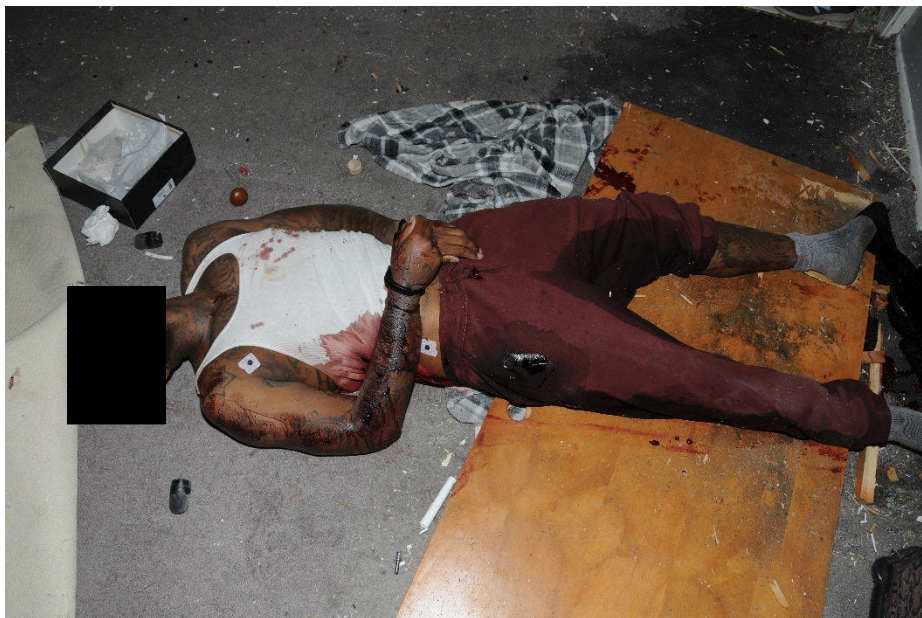
Figure 18, Overall photograph

This document is the property of the Ohio Bureau of Criminal Investigation and is confidential in nature. Neither the document nor its contents are to be disseminated outside your agency except as provided by law - a statute, an administrative rule, or any rule of procedure.