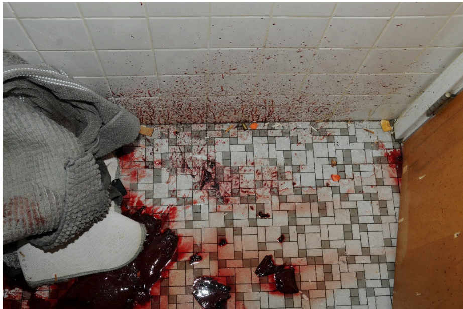
Figure 12, Overall photograph

Officer Involved Critical Incident - 16100 Van Aken Blvd., Shaker Heights, OH