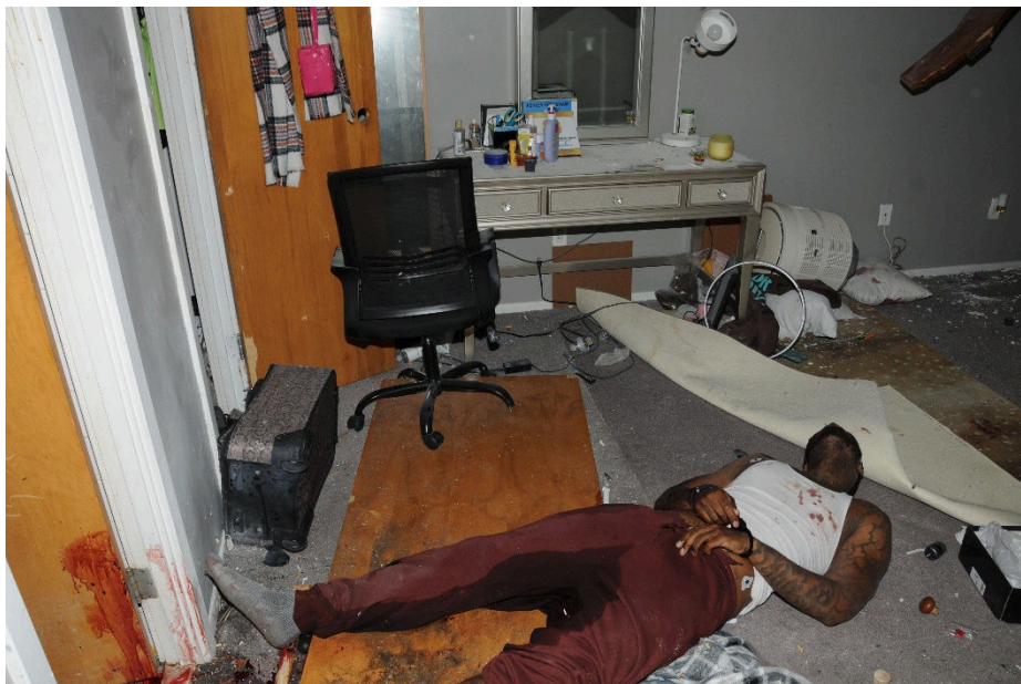
Figure 7, Overall photograph

This document is the property of the Ohio Bureau of Criminal Investigation and is confidential in nature. Neither the document nor its contents are to be disseminated outside your agency except as provided by law - a statute, an administrative rule, or any rule of procedure.