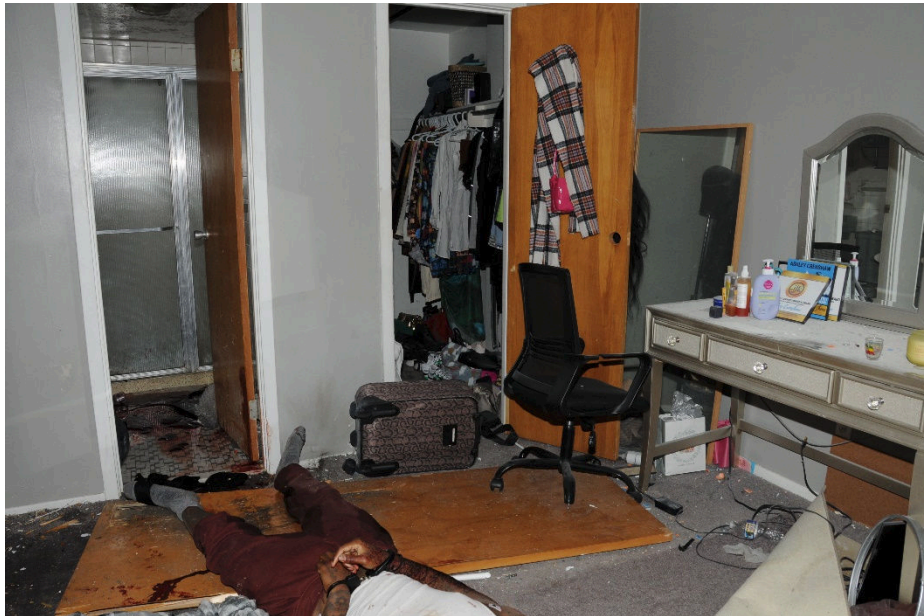
Figure 8, Overall photograph

Officer Involved Critical Incident - 16100 Van Aken Blvd., Shaker Heights, OH