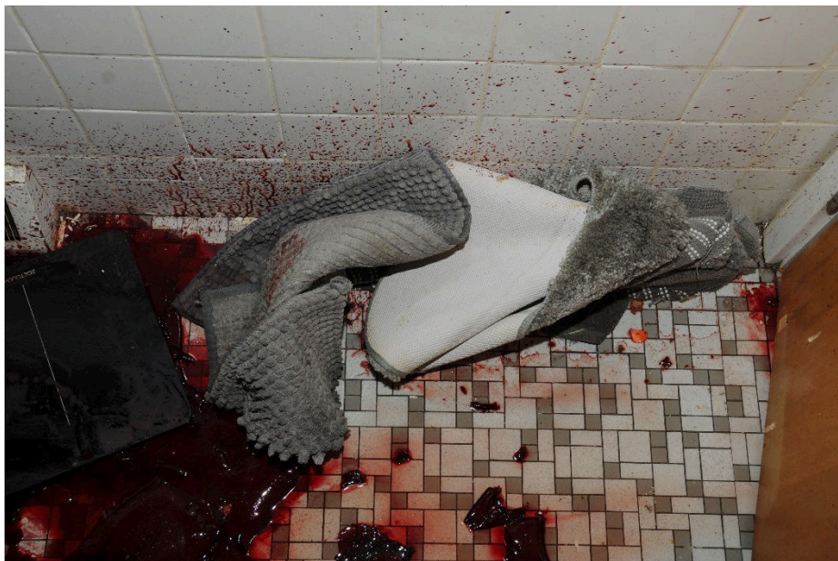
Figure 11, Overall photograph

This document is the property of the Ohio Bureau of Criminal Investigation and is confidential in nature. Neither the document nor its contents are to be disseminated outside your agency except as provided by law - a statute, an administrative rule, or any rule of procedure.