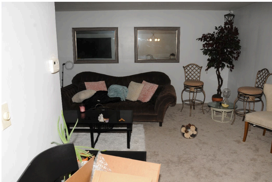
Figure 5, Overall photograph

This document is the property of the Ohio Bureau of Criminal Investigation and is confidential in nature. Neither the document nor its contents are to be disseminated outside your agency except as provided by law - a statute, an administrative rule, or any rule of procedure.