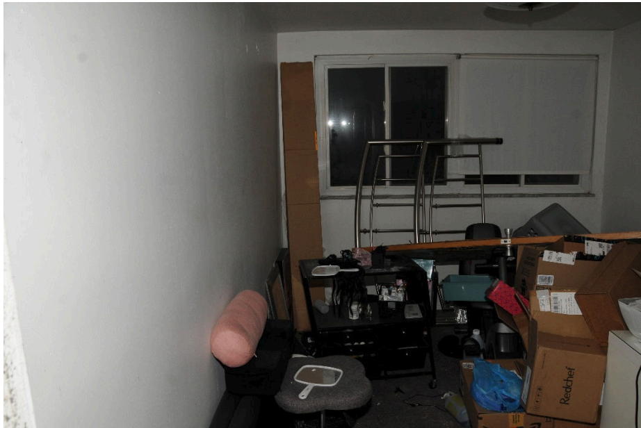
Figure 6, Overall photograph

Officer Involved Critical Incident - 16100 Van Aken Blvd., Shaker Heights, OH