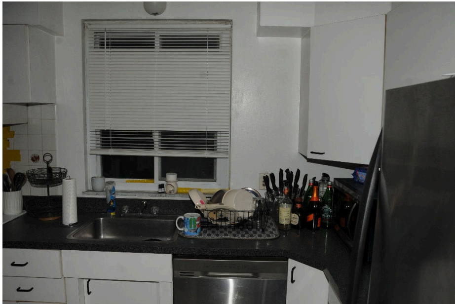
Figure 2, Overall photograph

Officer Involved Critical Incident - 16100 Van Aken Blvd., Shaker Heights, OH