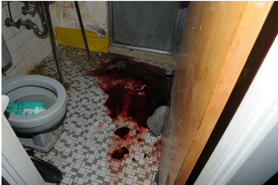
Figure 10, Overall photograph

Officer Involved Critical Incident - 16100 Van Aken Blvd., Shaker Heights, OH