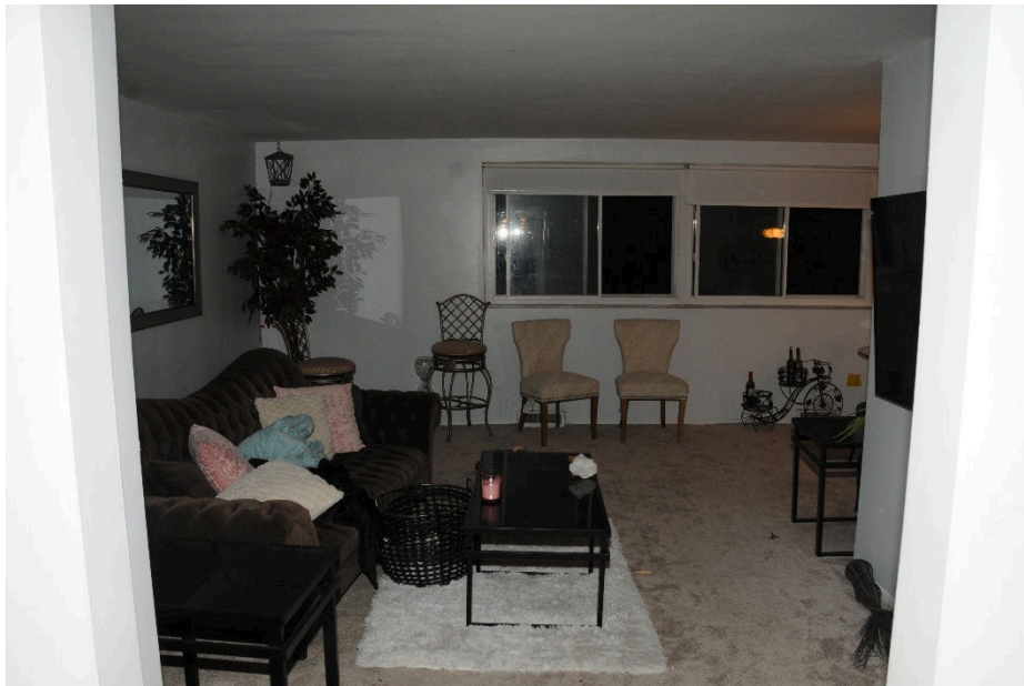
Figure 1, Overall photograph

SA Boerner proceeded to photograph the interior of the apartment as it was found (Figures 1-12, Overall photographs). The apartment consists of a kitchen, dining area, living room, a guest bathroom, a spare bedroom, a master bedroom, and a master bathroom. The apartment exhibited signs of less lethal device deployment and door breaching explosives.