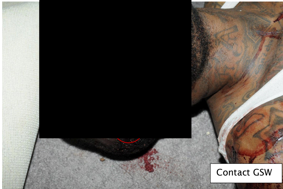
Figure 19, Overall photograph

Officer Involved Critical Incident - 16100 Van Aken Blvd., Shaker Heights, OH