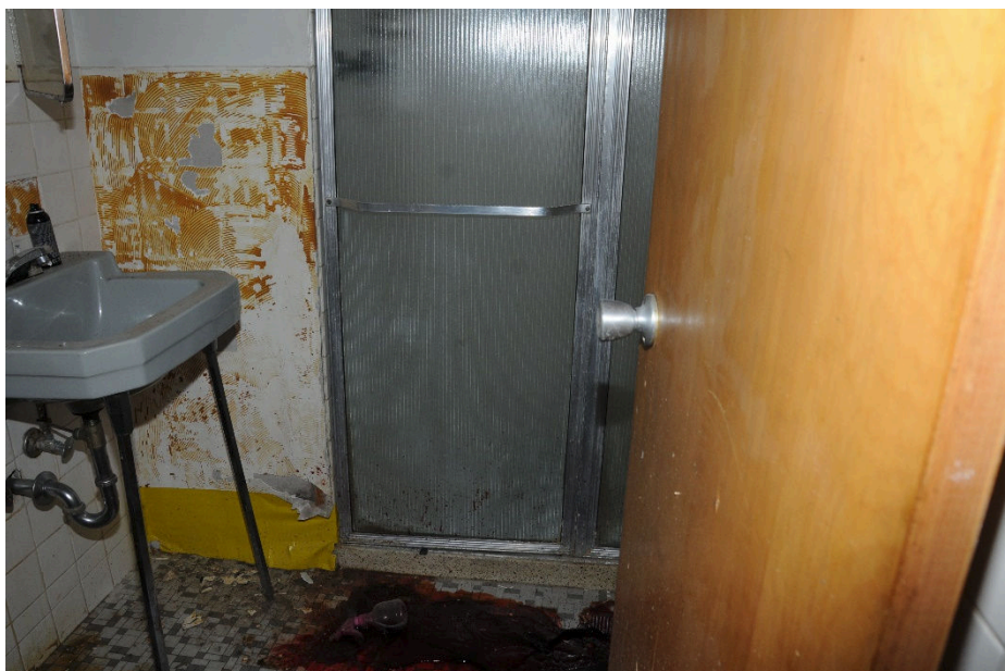
Figure 9, Overall photograph

This document is the property of the Ohio Bureau of Criminal Investigation and is confidential in nature. Neither the document nor its contents are to be disseminated outside your agency except as provided by law - a statute, an administrative rule, or any rule of procedure.