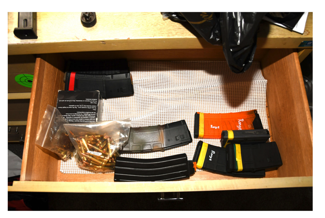
DMH_6347 Photograph of Drawer - Home Office/Guitar Room 1917 Delence St. Toledo, Ohio

2024-1584 Officer Involved Critical Incident, 27695 Tracy Road, Walbridge, OH 43465, (L)