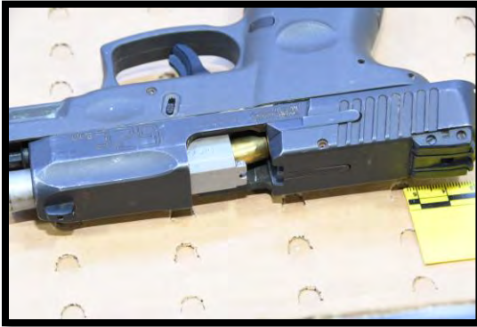
(Firearm with malfunction)

Officer Involved Critical Incident - 6463 Tara Brooke Court, Hamilton, OH 45011 (L)