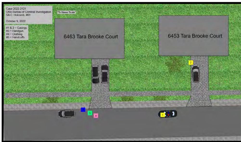
(Diagram of scene)

SA Holcomb collected multiple items of clothing that appeared to belong to Jones. The clothing was cut up, which appeared to have been caused by medical personnel. A black t-shirt, camouflage jacket and black sweatshirt, all with suspected bullet holes and blood, were collected along with black leggings and black sweatpants. All the clothing was collected as item #4. In the pocket of the jacket, SA Holcomb located a wallet. The wallet contained $32 cash and cards and a social security card belonging to Jones. The wallet and its contents were all collected as item #4.1. Black handcuffs were located on the pavement in front of the mailbox and collected as item #5.