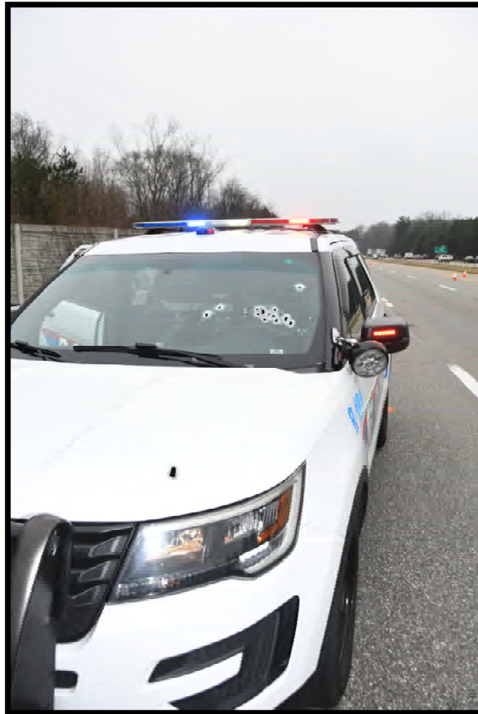
(BE 1.0 located on the hood of the vehicle)

Officer Involved Critical Incident - Interstate 71 North near Mile Marker 123, Lewis Center, Ohio