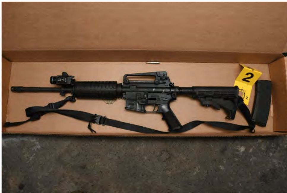
Figure 3: DCSO Deputy Gaunt's patrol rifle.

CST Gill was advised Dep Gaunt's patrol rifle had previously been secured by DCSO Dep Cline and was placed in the rear of a patrol car. CST Gill retrieved Dep Gaunt's patrol rifle from DCSO patrol vehicle #61. The rifle was further described as a Sig Sauer, SigM400 .223 caliber rifle with serial number [REDACTED]. See Figure 3 .