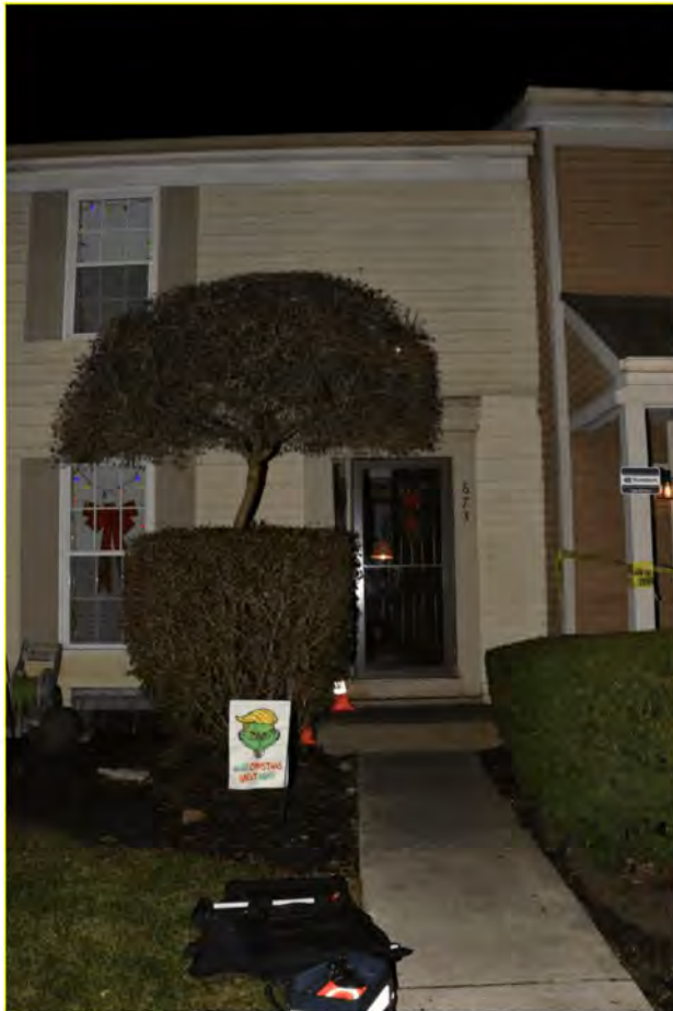
Facing South, just outside door