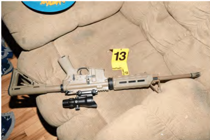
Figure 1: Tan AR-556 rifle lying on tan recliner

5.56x45 NATO rifle (See Figure 1 ). The rifle was found with the safety switch positioned in the "Fire" position (See Figure 2 ).