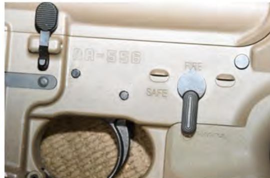
Figure 2: Rifle in "Fire" position

CST Gill was advised Dep Gaunt's patrol rifle had previously been secured by DCSO Dep Cline and was placed in the rear of a patrol car. CST Gill retrieved Dep Gaunt's patrol rifle from DCSO patrol vehicle #61. The rifle was further described as a Sig Sauer, SigM400 .223 caliber rifle with serial number [REDACTED]. See Figure 3 .