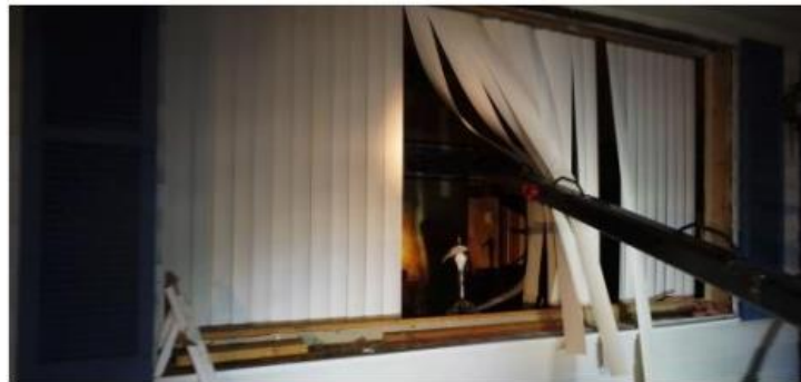
Still Image from drone video footage

After receiving no response from Perry, it was decided that David, using a fixed ram that was attached to its front, would break out the front window of the residence.