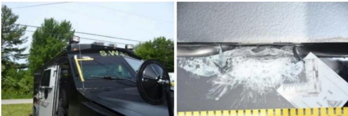
Photographs of armored vehicle "David"

The fired projectile struck the windshield area of David.