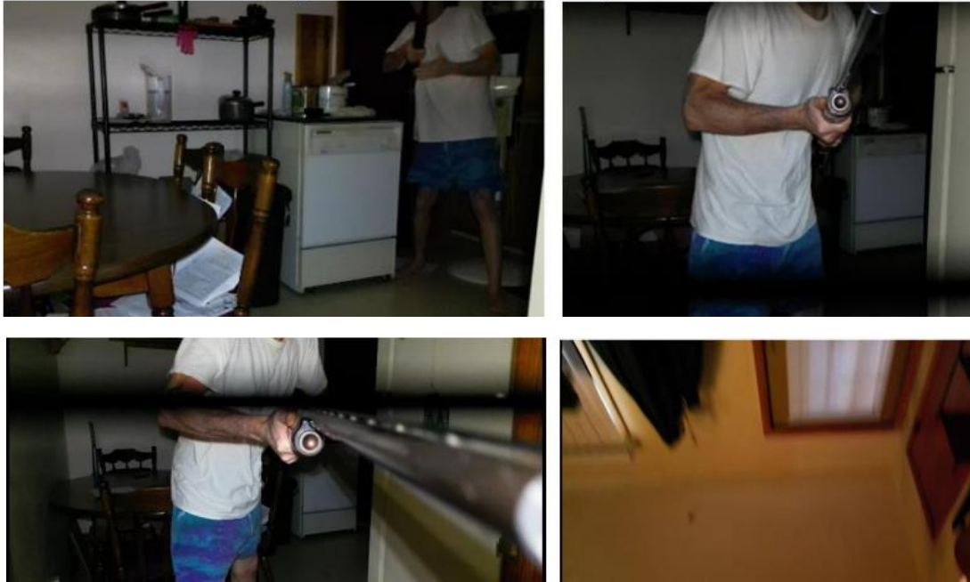
Still Images from drone video footage

Officer-Involved Critical Incident - 2212 Tryon Rd., Ashtabula, Ohio 44004