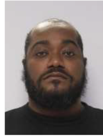
Click to Enlarge Title:2021 Photo Date:5/3/2021