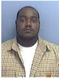
Click to Enlarge Title:2004 Photo Date:7/10/2004