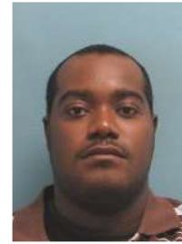
Click to Enlarge Title:2009 Photo Date:9/8/2009