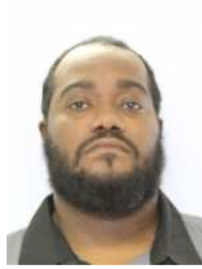
Click to Enlarge Title:2018 Photo Date:10/2/2018