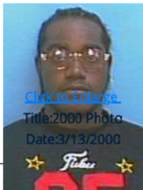
Click to Enlarge Title:2000 Photo Date:3/13/2000