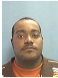
Click to Enlarge Title:2009 Photo Date:4/2/2009