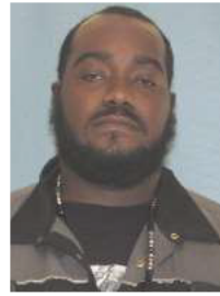
Click to Enlarge Title:2016 Photo Date:7/7/2016