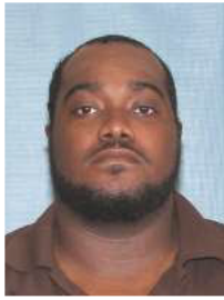
Click to Enlarge Title:2010 Photo Date:7/19/2010