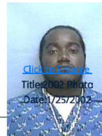
Click to Enlarge Title:2002 Photo Date:1/25/2002