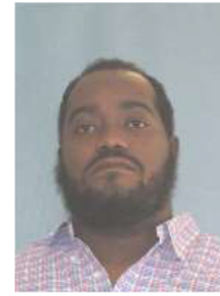
Click to Enlarge Title:2017 Photo Date:8/25/2017