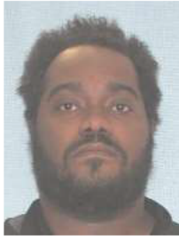
Click to Enlarge Title:2018 Photo Date:1/3/2018