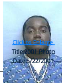
Click to Enlarge Title:2001 Photo Date:5/22/2001