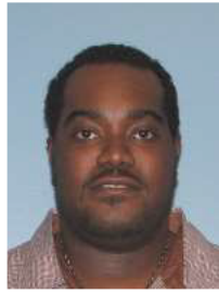
Click to Enlarge Title:2012 Photo Date:10/19/2012