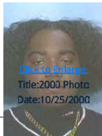
Click to Enlarge Title:2000 Photo Date:10/25/2000