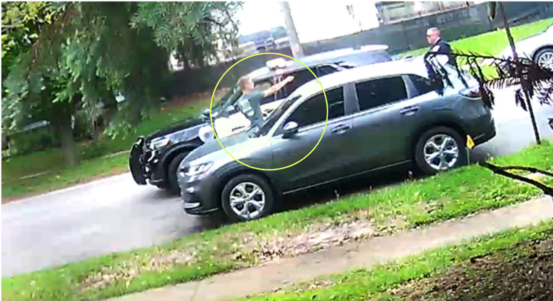
121 W Perry Doorbell video ends on this frame

Officer Involved Critical Incident - 121 W. Perry St., Tiffin, OH, 44883 (L)