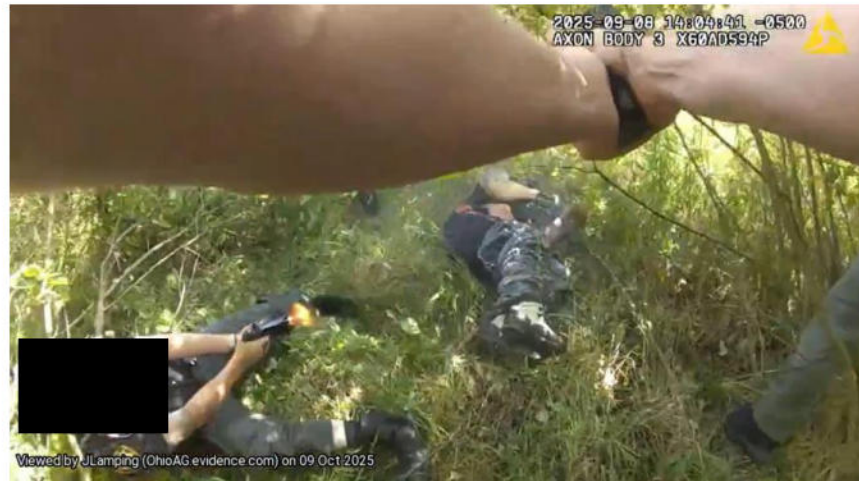
Snippet # 9

Officer Involved Critical Incident - Stanhope-Kelloggsville Rd. and Anderson Rd., Denmark Township, OH 44032, Ashtabula County