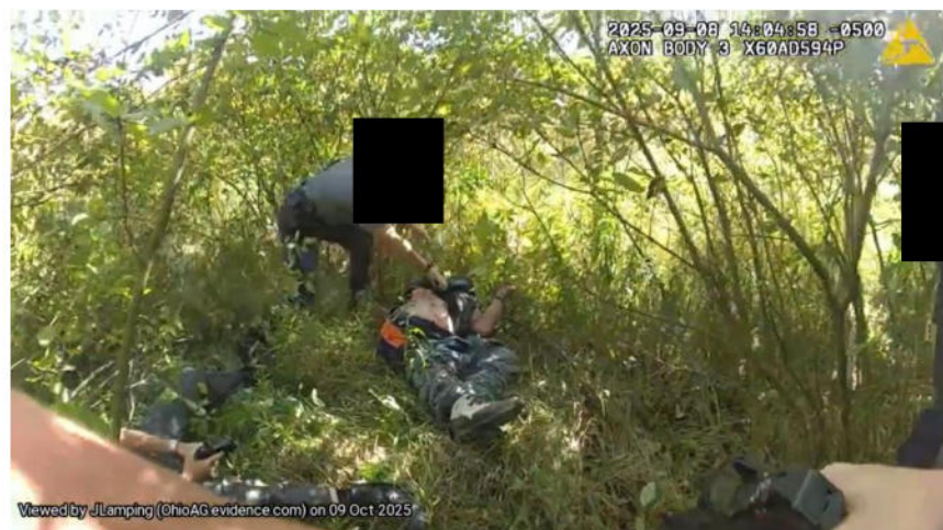
Snippet # 10

At approximately 14:04:46 hours, someone on scene transmitted, "shots fired" over the radio. The deputies then checked on one another verbally to see if anyone had been injured. Several seconds elapsed and Pegram's arms were still moving as he was supine on the ground. At approximately 14:04:58 hours [REDACTED] approached Pegram and grabbed an object from his chest, pictured below: