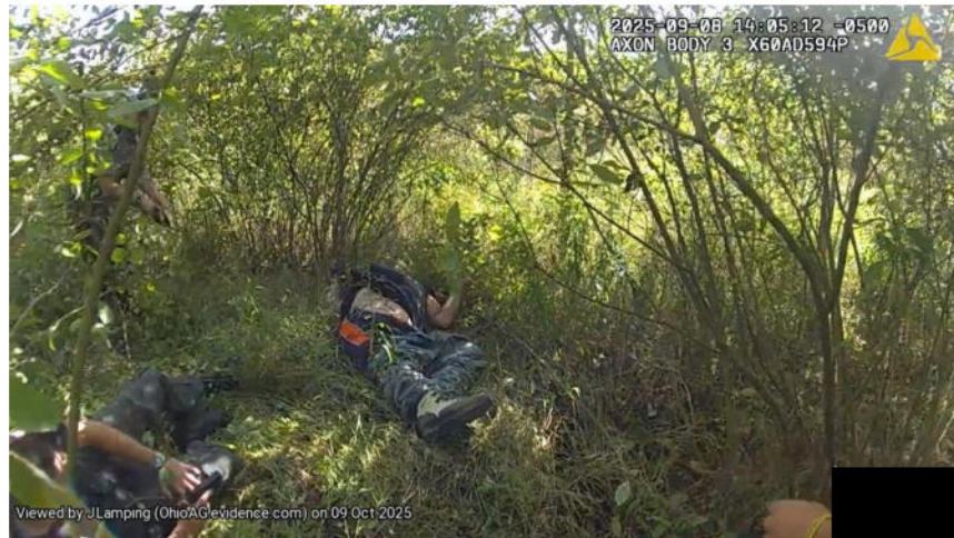
Snippet # 12

During the above conversation, [REDACTED] was on the ground and checked himself for injuries by moving his hand along his legs and torso, as pictured below: