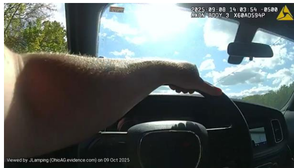
Snippet # 1

[REDACTED] recorded one BWC video related to the Officer Involved Critical Incident (OICI) at Stanhope-Kelloggsville Road and Anderson Road on September 8, 2025. The first video began at 14:03:54 hours and lasted 19 minutes and 49 seconds. The first image captured by the BWC is pictured below: