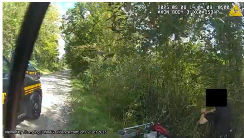
Snippet # 2

At approximately 14:04:09, [REDACTED] followed Dep. Michael Chicarell (Dep. Chicarell) and [REDACTED] into the woods beyond Pegram's wrecked motorcycle, pictured below: