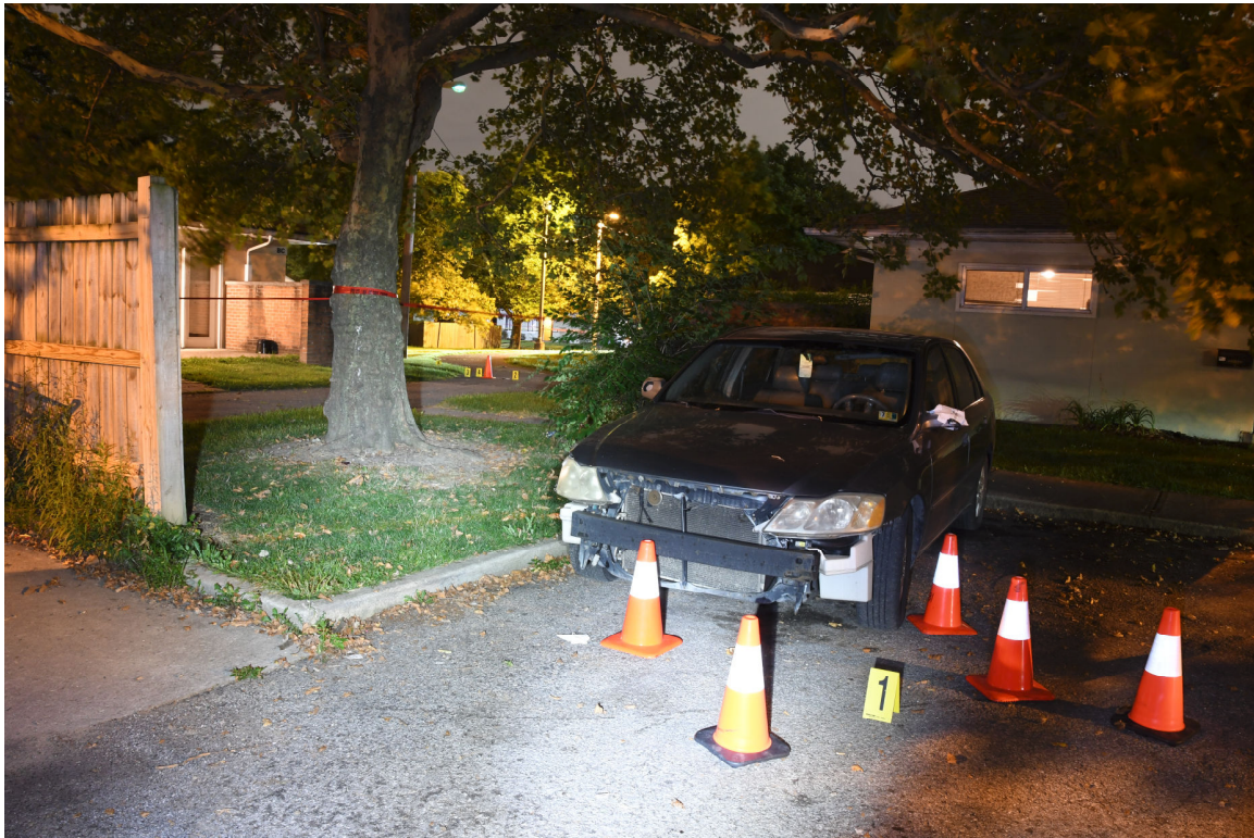
Image 1. Parking lot northeast of courtyard

Officer Involved Critical Incident - 1382 Marion Road, Columbus, Ohio 43207