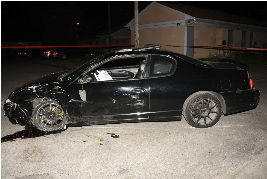
Image 2. Black Chevrolet Monte Carlo (VIN: 2G1WX12K159200708)

BCI personnel arrived on scene at approximately 0105 hours. The area where the shooting took place was observed to be in a central courtyard, just north of 1382 Marion Road. A large section of the neighborhood, as well as part of Marion Drive North, were secured with crime scene tape. The scene was photographed as it was upon arrival and a Leica 3D scanner was utilized to further document the scene.