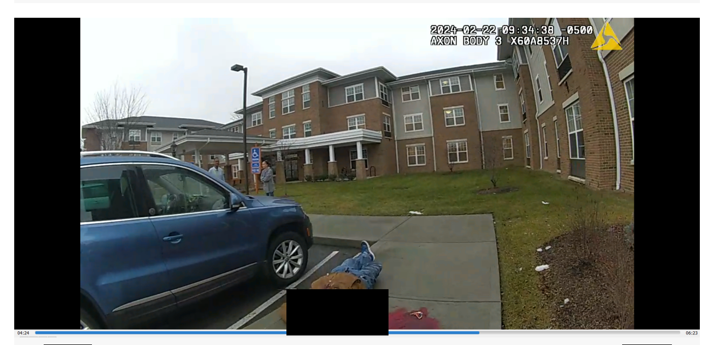
BWC 17: Unknown male and female standing near Jennings when Officer returned