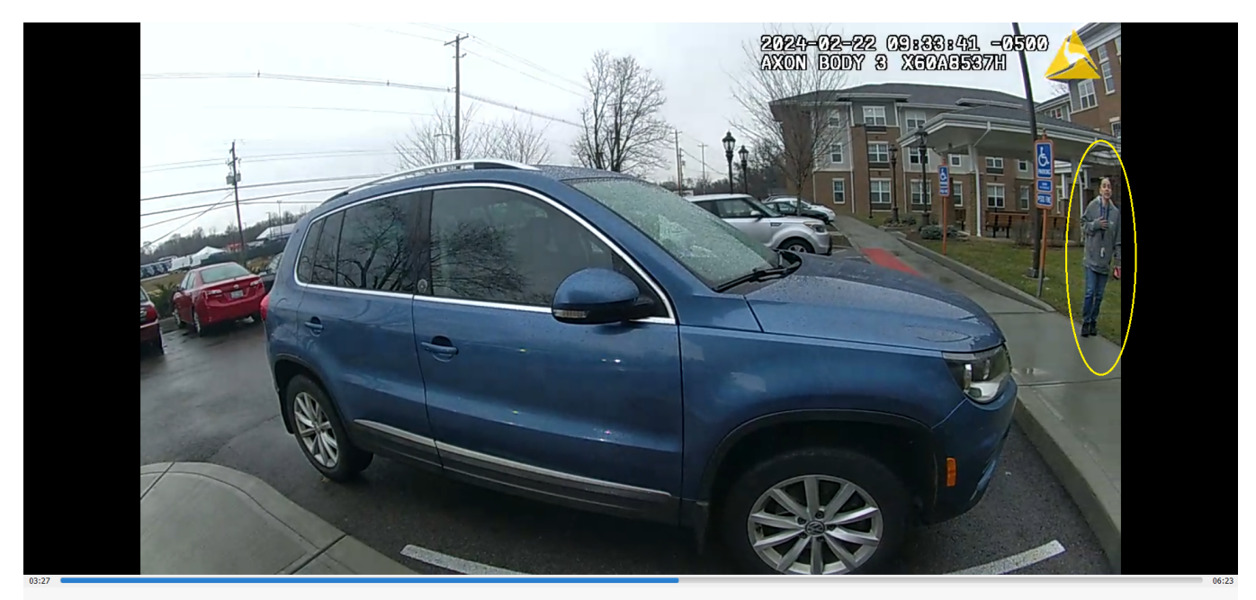
BWC 15: Caucasian female approaching Officer and inquiring about what happened