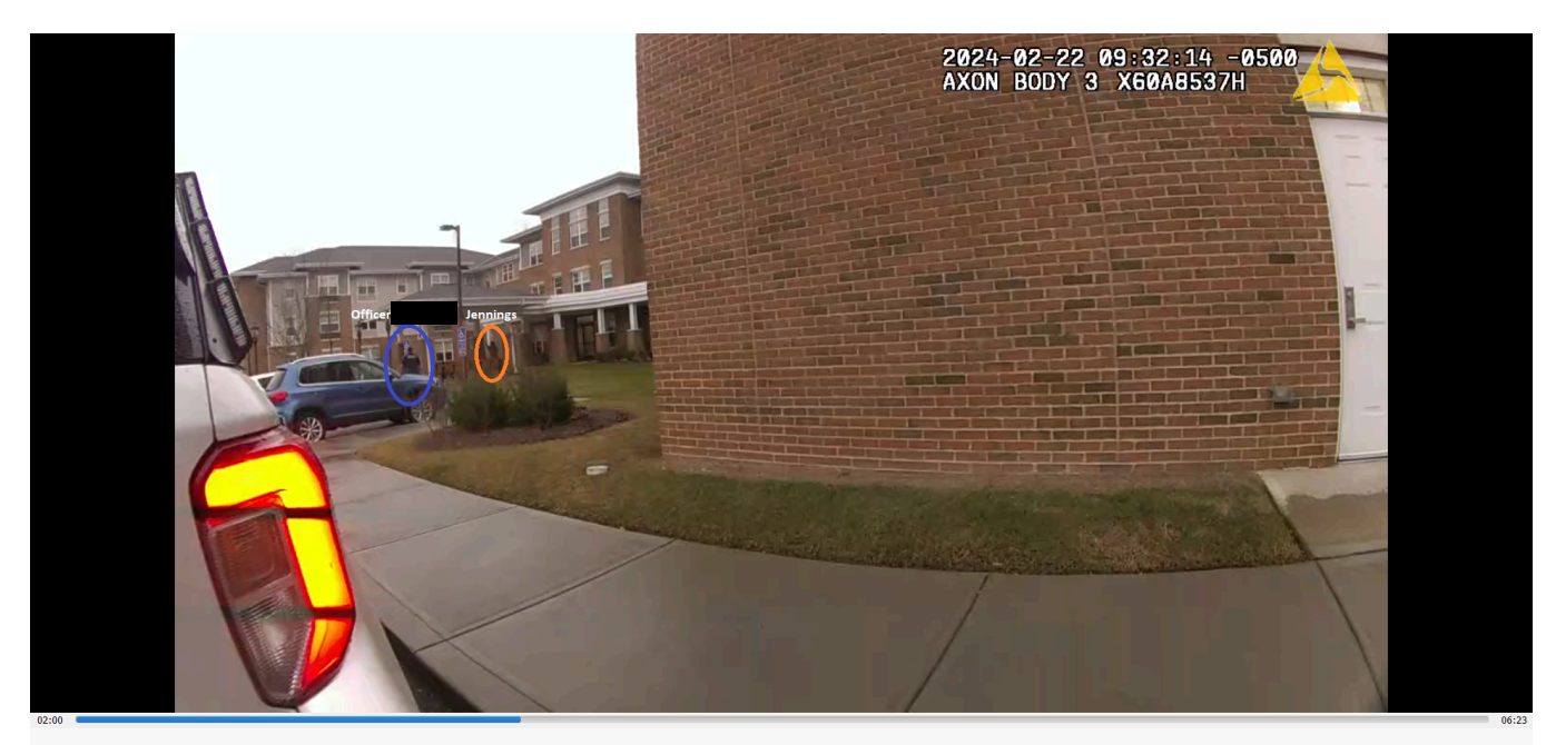
BWC 2: Jennings (orange) located under covered breezeway as Officer (blue) approached front entrance of building