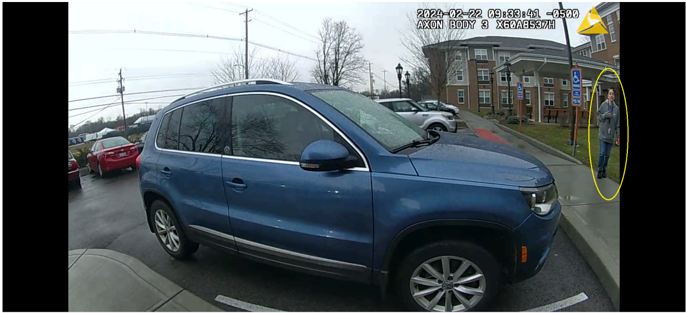
██████████ BWC 15: Caucasian female approaching Officer ██████████ and inquiring about what happened