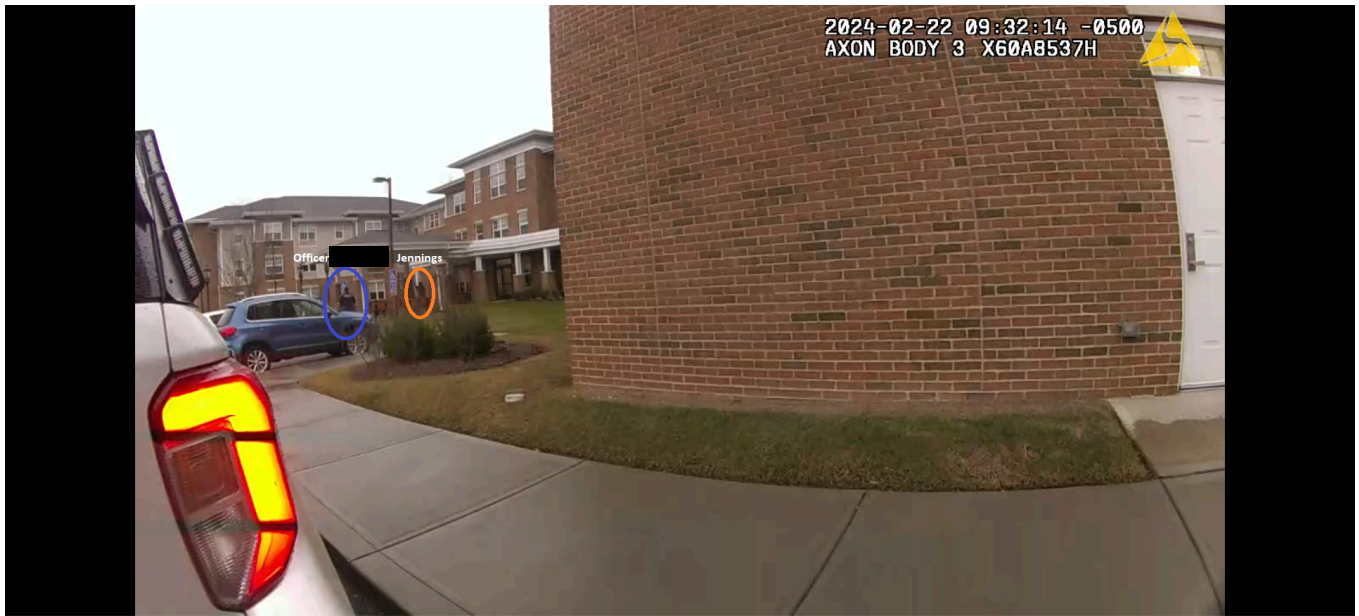
02:00 06:23 BWC 2: Jennings (orange) located under covered breezeway as Officer (blue) approached front entrance of building