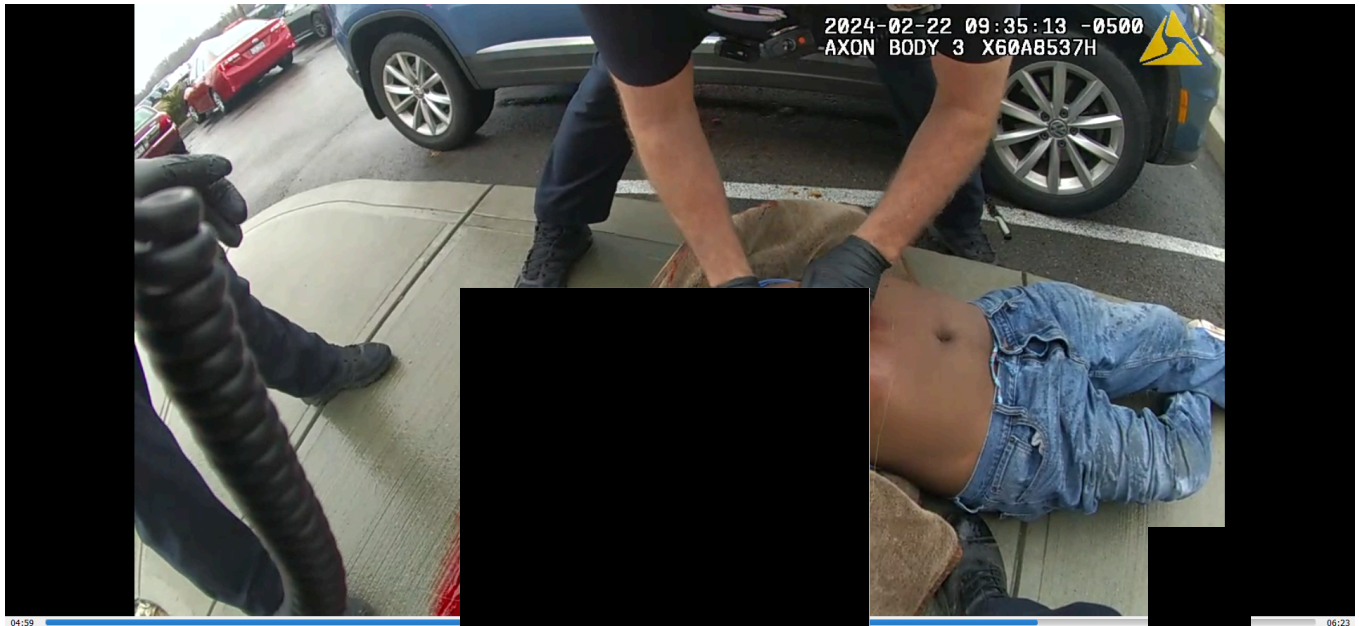
██████████ BWC 18: Officer ██████████ applying bandage to suspected gunshot wound prior to initiating CPR