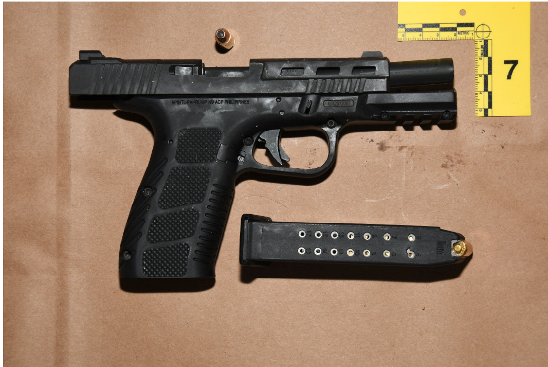
Image 3. Rock Island Armory handgun found next to front door

Officer Involved Critical Incident - 114 North Ninth St., Byesville, OH (L)