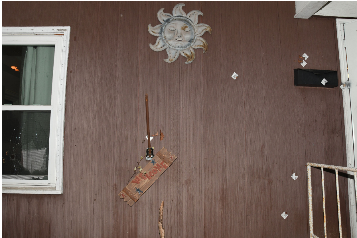
Image 4. Several BE's located between the master bedroom window and front door

fractures to the glass and exited at 13.1. BE 14 was located near address numbers that were affixed to the house. The defect was a round penetrating hole into the wood façade that caused the wood to splinter. BE 15 was perforating misshaped hole with a lead-in mark that appeared to travel in a southwest direction. No projectiles were recovered from BE's 1-7 and BE's 9-15.