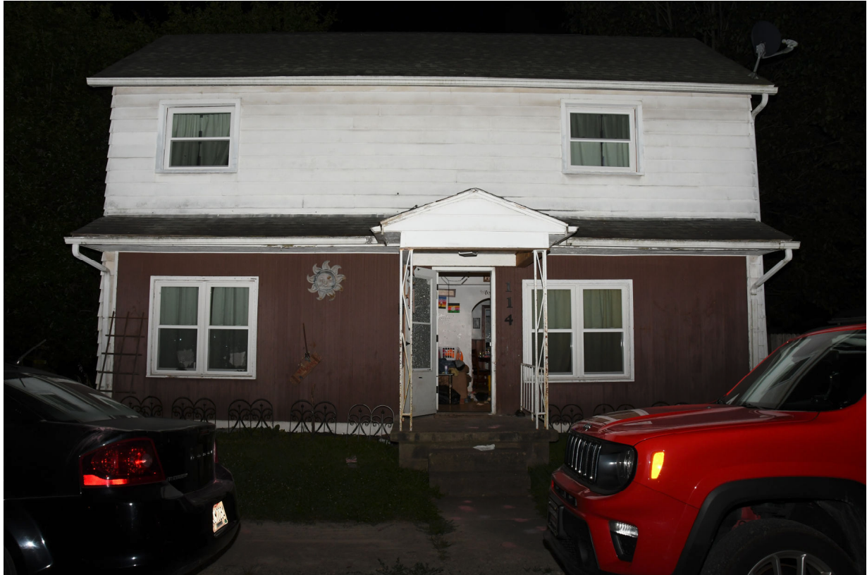
Image 1. 114 N 9th St. Byesville, OH

Officer Involved Critical Incident - 114 North Ninth St., Byesville, OH (L)