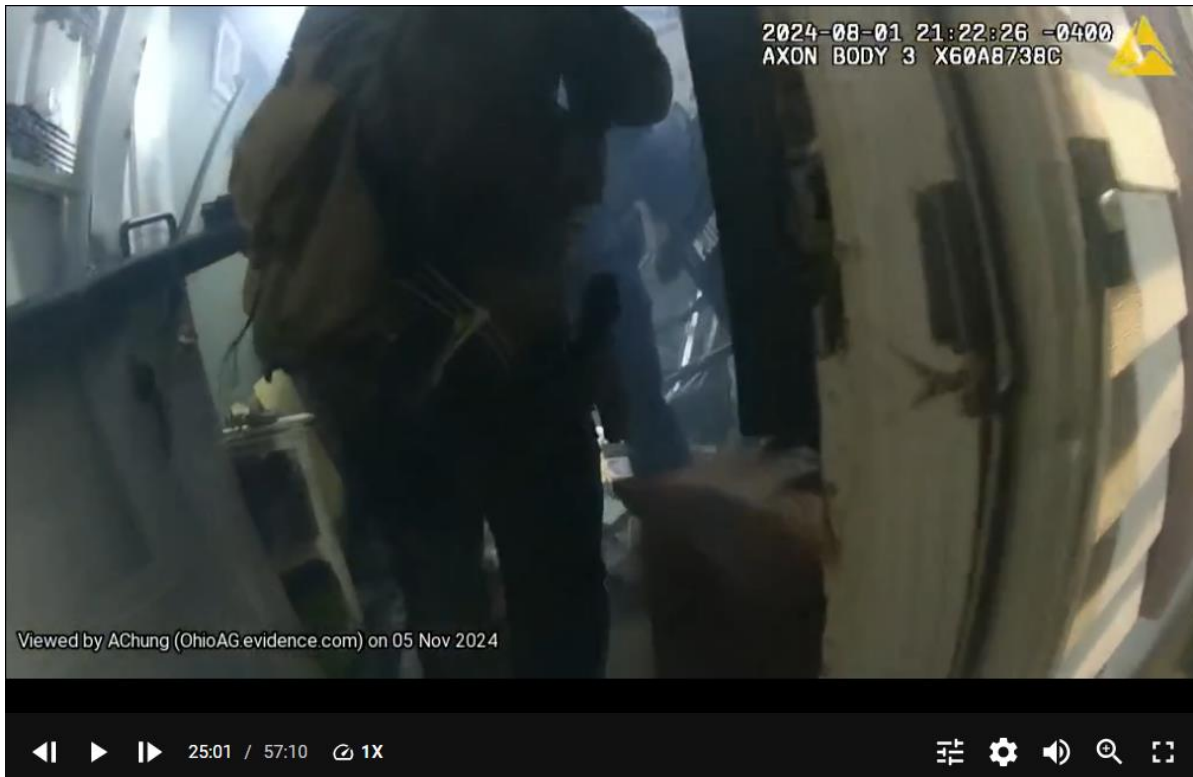
Photograph of living room and debris on floor.