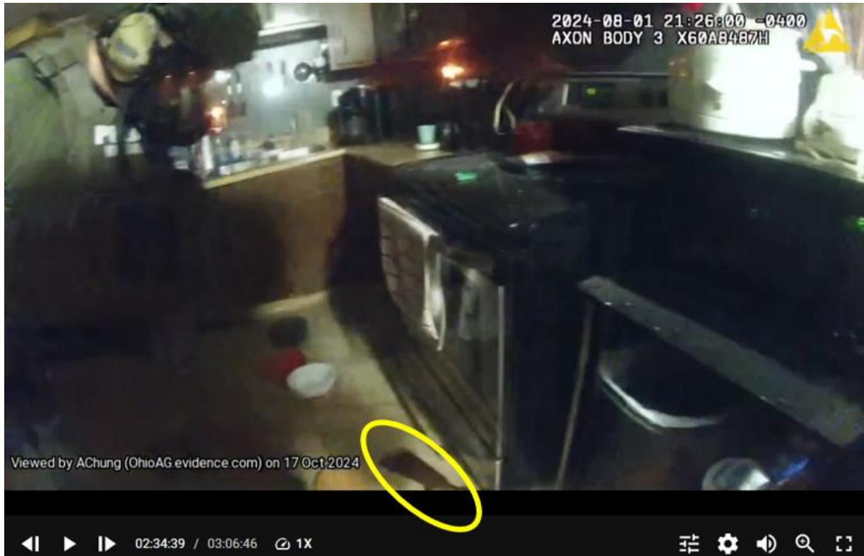
Photograph of a buttstock of a long gun observed on the kitchen floor.

Officer Involved Critical Incident - 818 Cherryberry Dr., Columbus, OH 43228 (L)