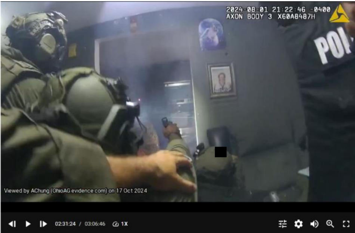
Photograph of SWAT officer firing pistol towards kitchen area.

Officer Involved Critical Incident - 818 Cherryberry Dr., Columbus, OH 43228 (L)