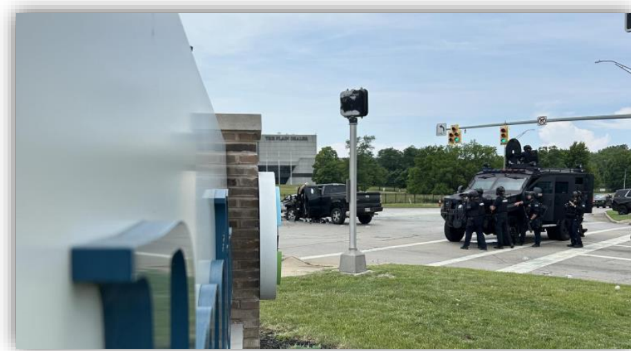
Snippet from IMG_0121.jpeg

2025-2000 Officer Involved Critical Incident - Tiedeman Road at I-480 West, Brooklyn, OH 44144, Cuyahoga County