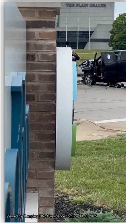
Snippet #2 IMG_0126.mov