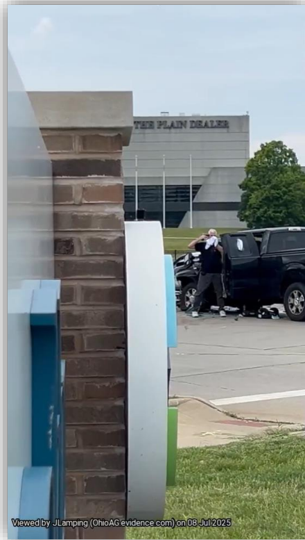
Snippet #1 IMG_0126.mov

2025-2000 Officer Involved Critical Incident - Tiedeman Road at I-480 West, Brooklyn, OH 44144, Cuyahoga County