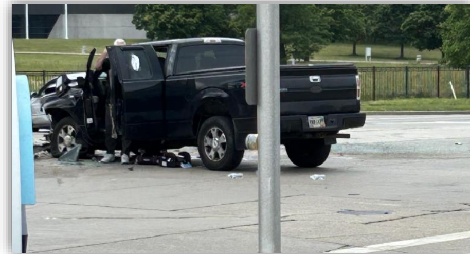
Snippet from IMG_0122.jpeg

The other three photos were more focused on Kerr who was standing in a similar position as the first photo. In the final photo, only the top of Kerr's head and his feet are visible. The images were included below in the order they were captured: