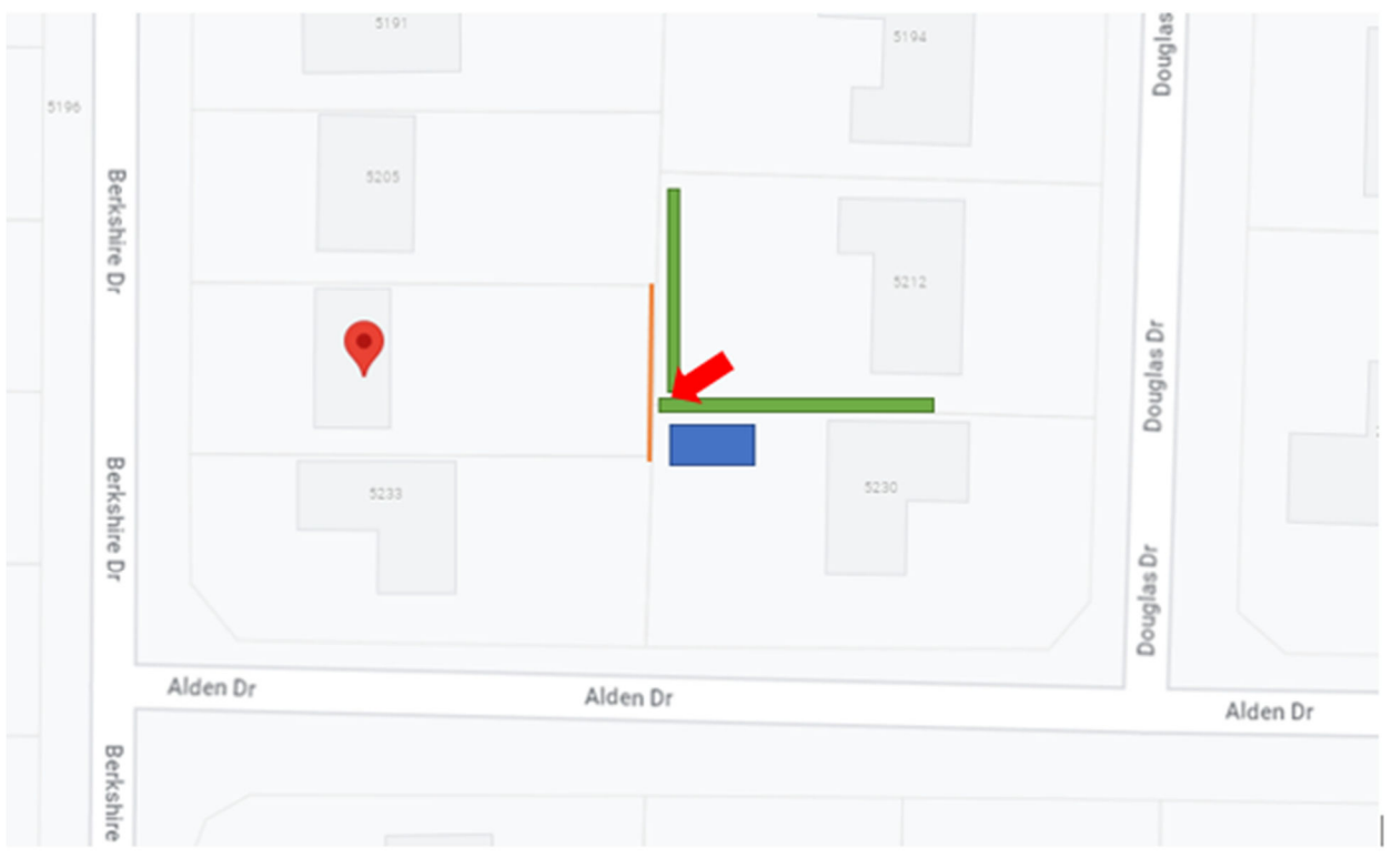
Area where the Officer Involved Critical Incident to place, adjoining properties between Burkshire Drive, Douglas Drive, and Alden Drive.

Officer Involved Critical Incident - 5320 Douglas Drive, North Olmsted, Ohio 44070