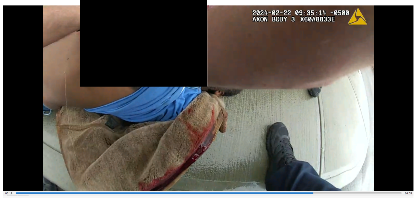
BWC 22: Officer applies bandage to Jennings gunshot wounds