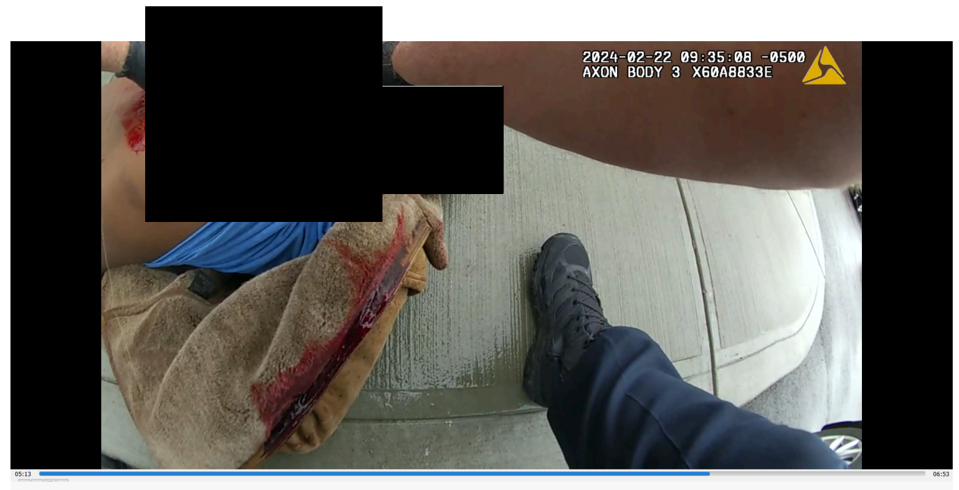
BWC 21: Officer identifies two possible gunshot wounds