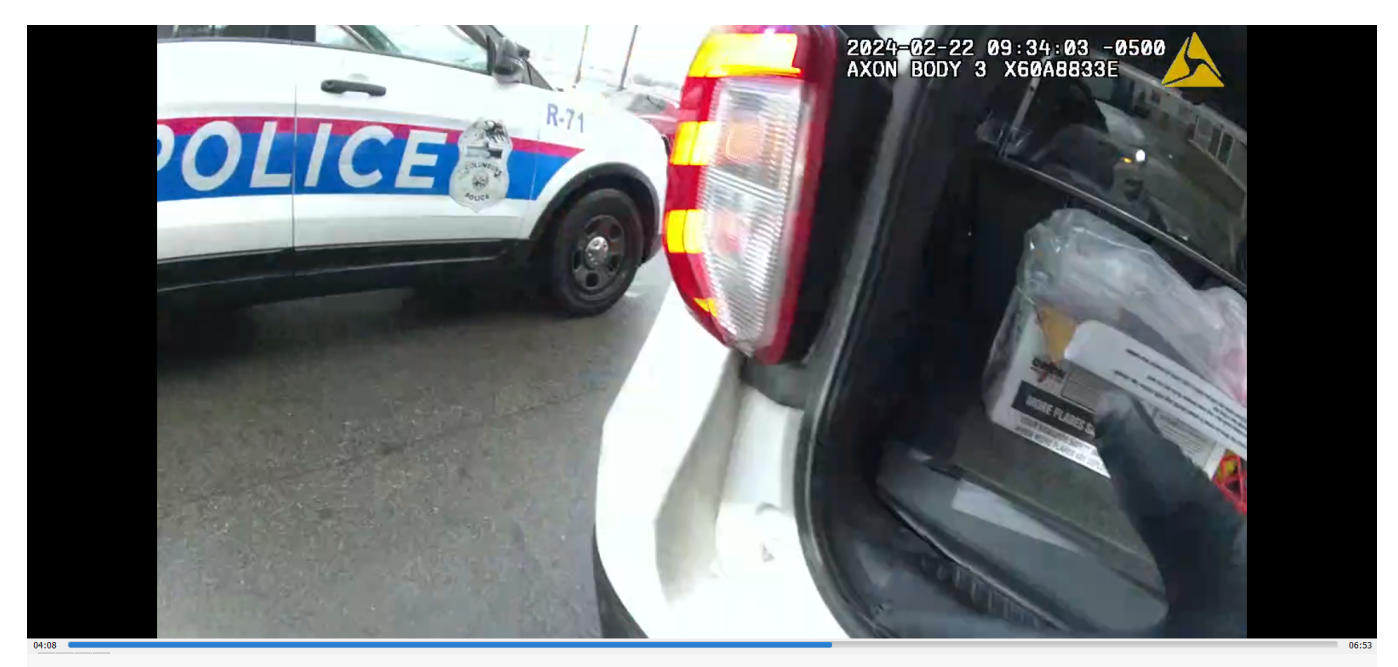
BWC 18: Officer asking arriving officer for first aid supplies