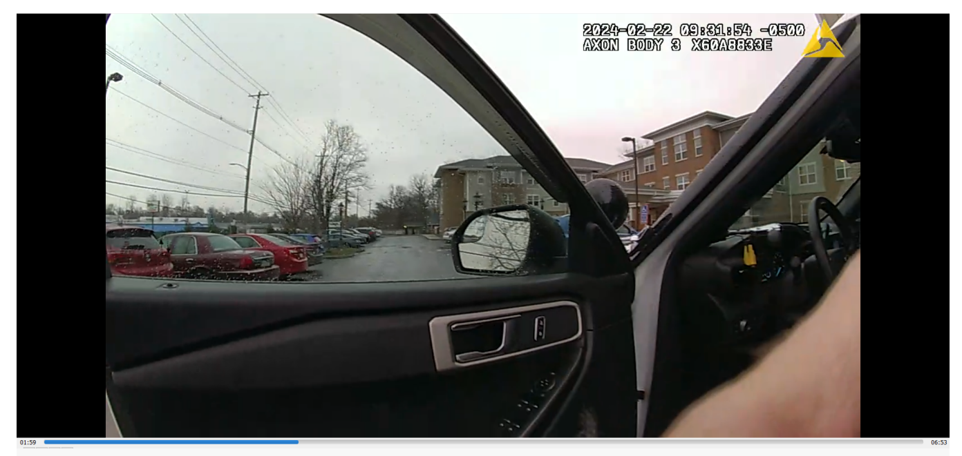
BWC 1: Officer arriving on scene and exiting his cruiser