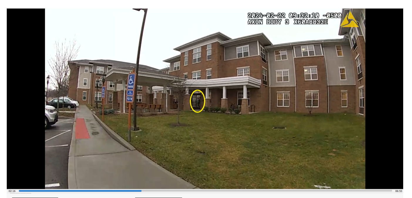
BWC 2: As Officer walked towards the entrance, Jennings can be seen at the front door inside the building