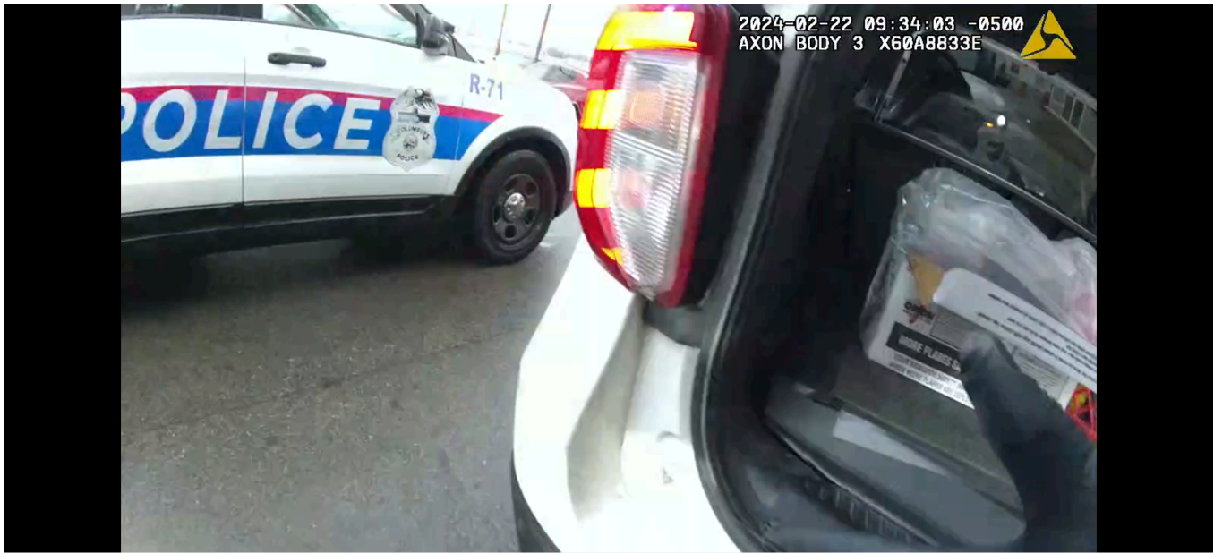
██████████ BWC 18: Officer ██████████ asking arriving officer for first aid supplies