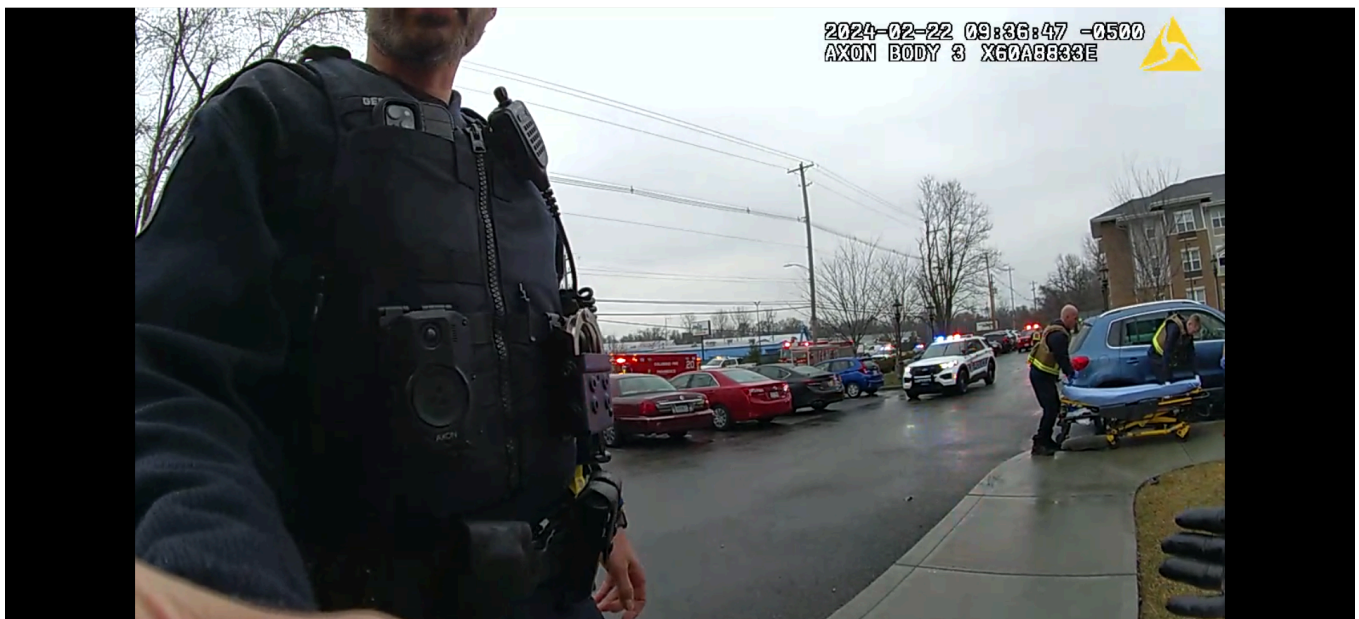
BWC 24: Officer approaches Officer [REDACTED] and turns off his BWC

From the time Officer [REDACTED] arrived on scene and exited his cruiser at approximately 01:59 into the recording and when he deployed his Taser and Officer [REDACTED] discharged his pistol at approximately 02:36 into the recording, approximately thirty-seven (37) seconds had elapsed.