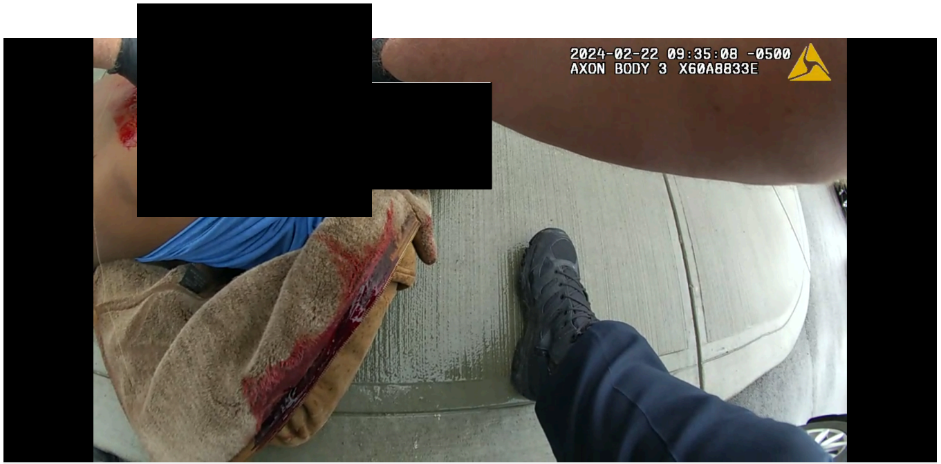
██████████ BWC 21: Officer ██████████ identifies two possible gunshot wounds