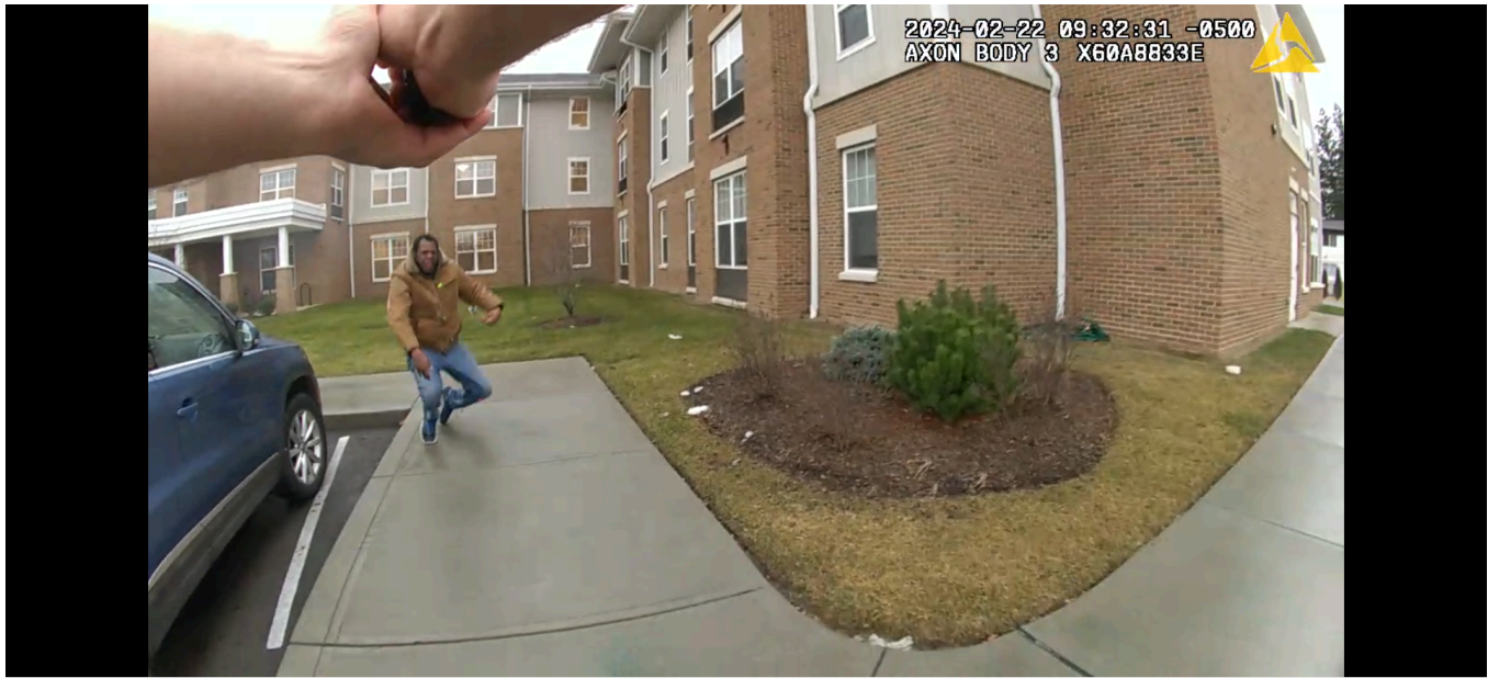
██████████ BWC 11: Officer ██████████'s third shot being fired