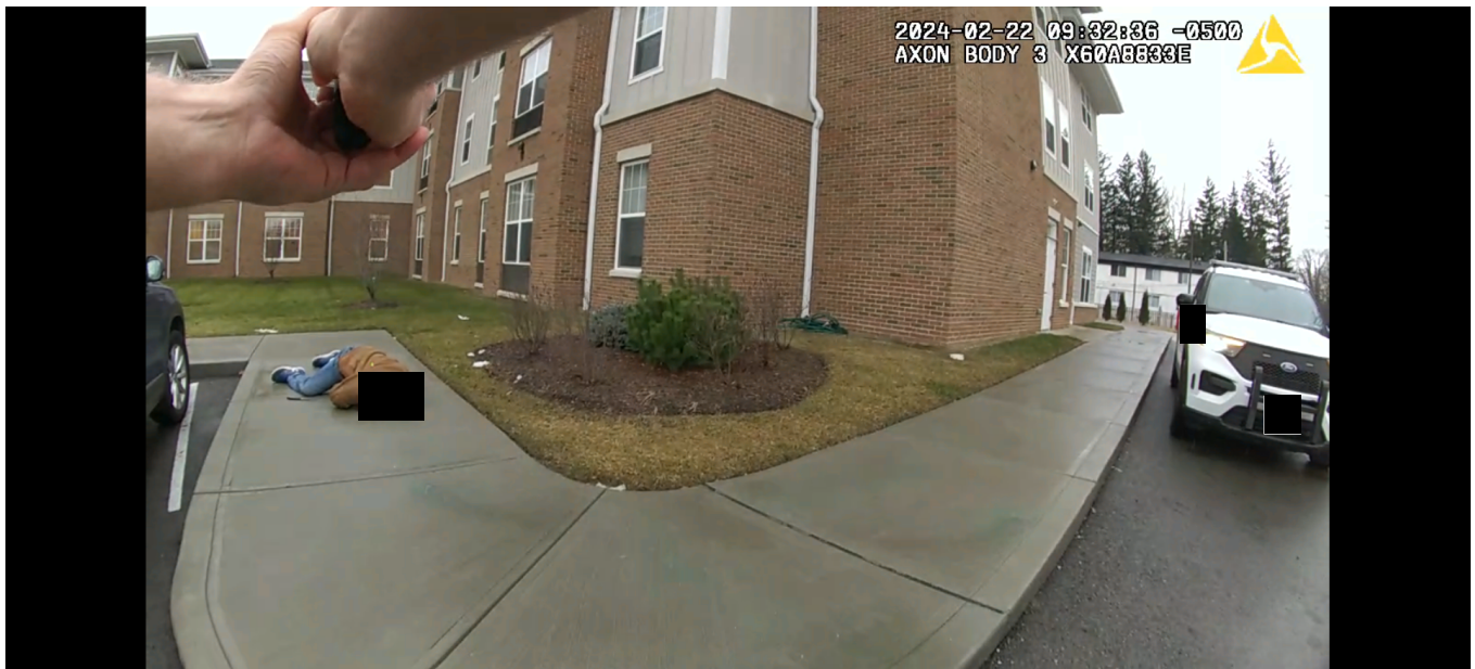
02:41 06:53 ██████████ BWC 14: Officer ██████████ Taser finished its cycle (5 second deployment)