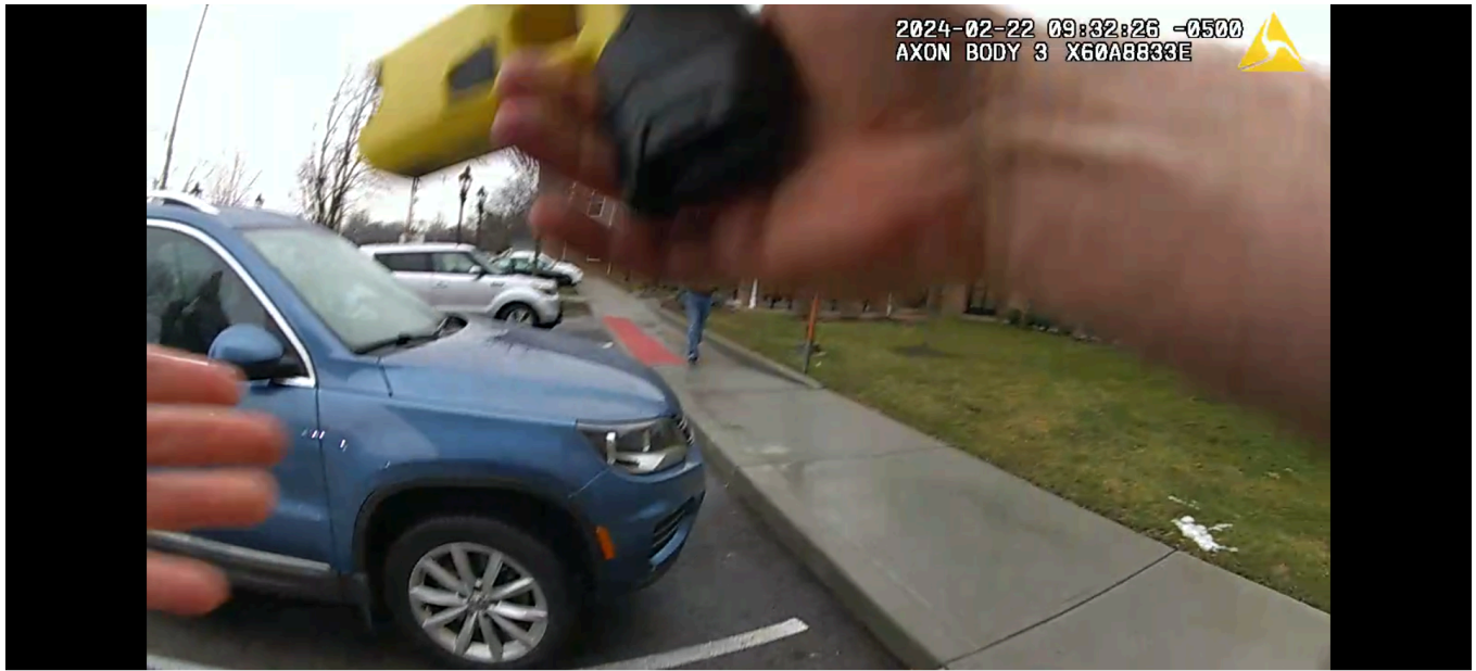
02:32 06:53 BWC 8: Officer ██████████ is heard saying "Taser him... Taser him" while Officer ██████████ retrieves his Taser