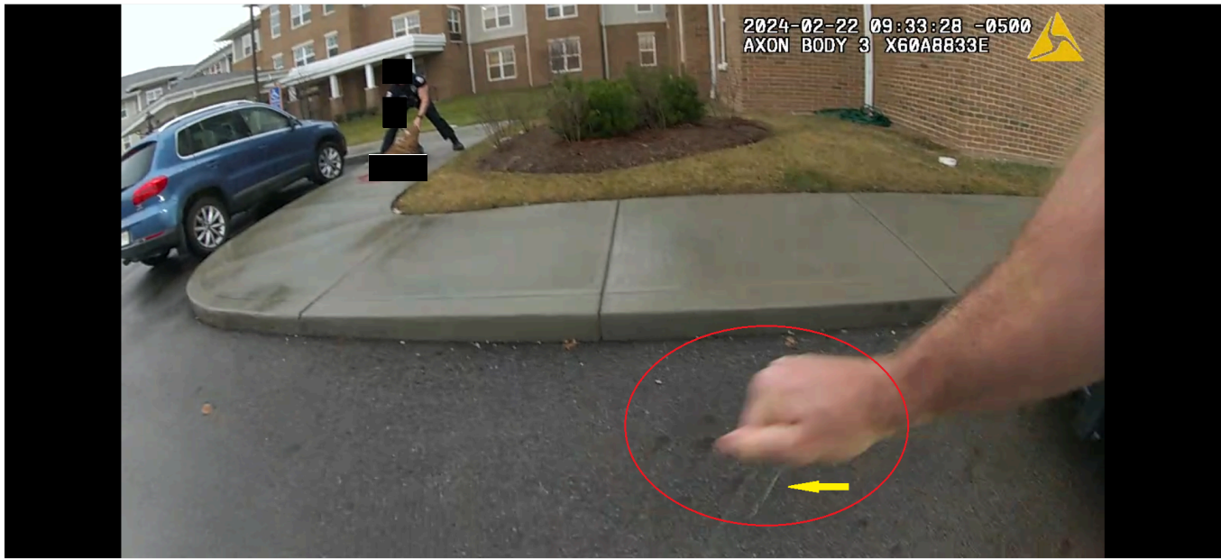
██████████ BWC 17: Officer ██████ pulling off the Taser probe leads as he walked towards his cruiser