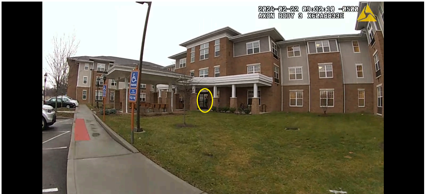
██████████ BWC 1: Officer ██████████ arriving on scene and exiting his cruiser