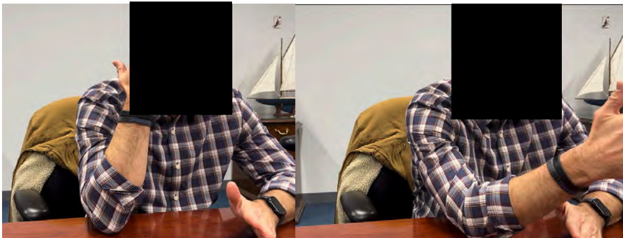
Figure 8: Demonstration ██████████ made when he stated "Yeah, I was trained on him because it was just from this to this or this to that."