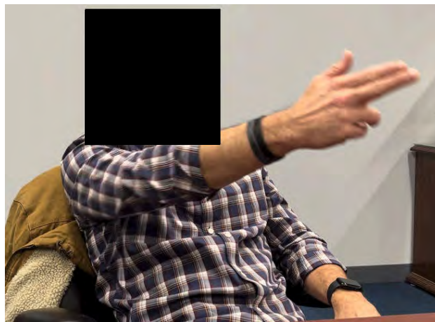
Figure 3: Demonstration [REDACTED] [REDACTED] made when he stated, "to this."

[REDACTED] [REDACTED] continued, "I immediately hear shots. I thought he was shooting at [REDACTED] [REDACTED] I, I advance on Benard about 2 or 3 steps and I fire, either 2 or 3 rounds, I don't remember what it was, 2 or 3 rounds, I had him in my sight picture and I fired, 2 or 3 rounds. He, he falls but he's, he's out of the chair now but he is like This document is the property of the Ohio Bureau of Criminal Investigation and is confidential in nature. Neither the document nor its contents are to be disseminated outside your agency except as provided by law - a statute, an administrative rule, or any rule of procedure.