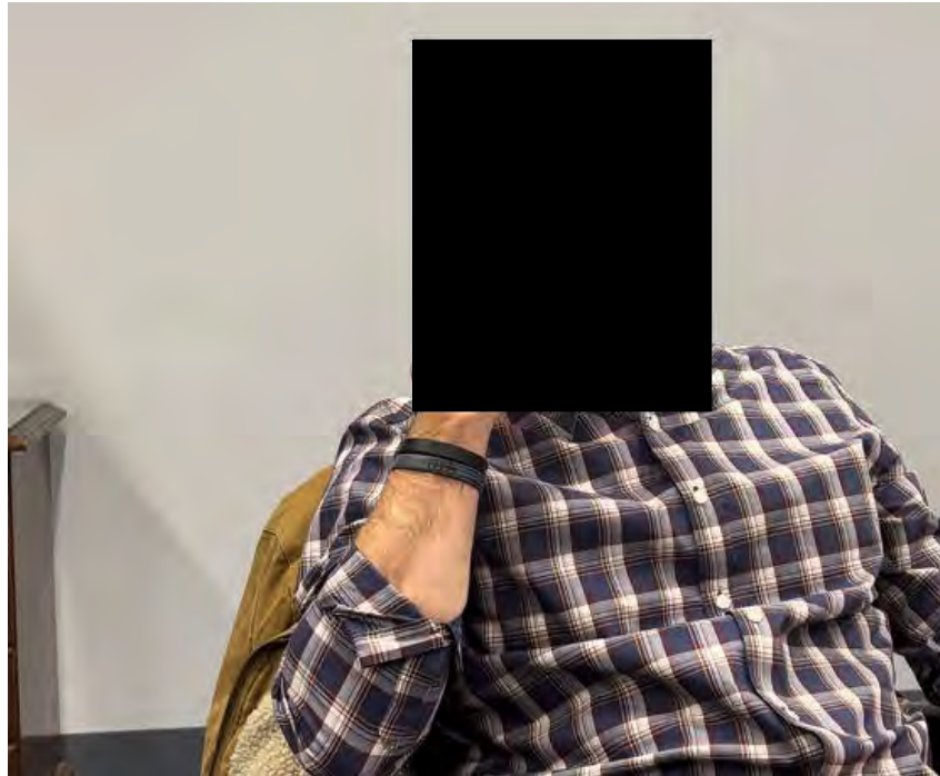
Figure 2: Demonstration [REDACTED] [REDACTED] made when his stated "I see him go like this."

Officer Involved Critical Incident - 6235 Hathaway Rd., Garfield Heights, Cuyahoga County, Ohio 44125