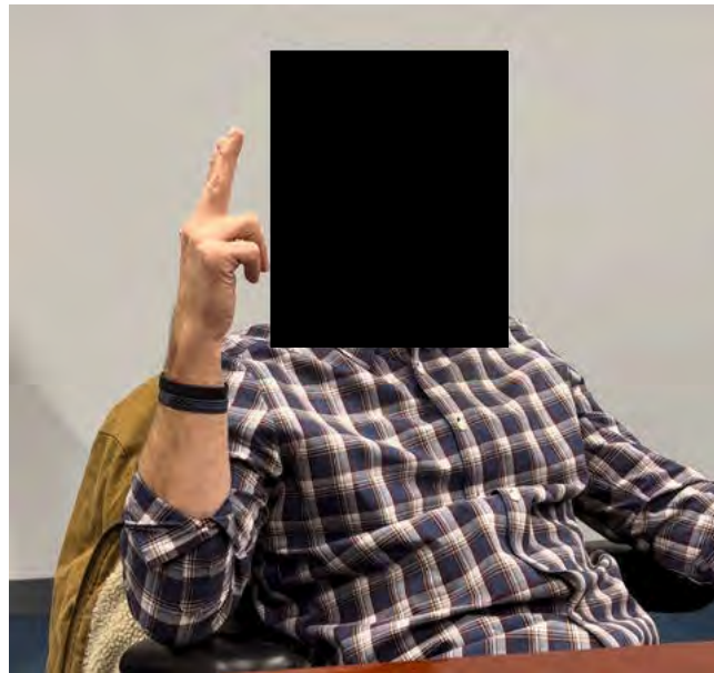
Figure 4: Demonstration [REDACTED] [REDACTED] made when he stated, "but he still has the gun up like this."

alert, I mean he's conscious and alert, I can tell that he's in pain that he's been hit but he still has the gun up like this."