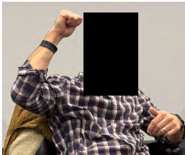
Figure 6: Demonstration [REDACTED] made when he stated, "because he had the gun up like this."

This document is the property of the Ohio Bureau of Criminal Investigation and is confidential in nature. Neither the document nor its contents are to be disseminated outside your agency except as provided by law - a statute, an administrative rule, or any rule of procedure.