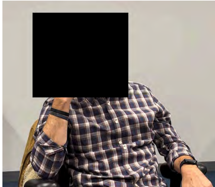
Figure 1: Demonstration made by [REDACTED]

Officer Involved Critical Incident - 6235 Hathaway Rd., Garfield Heights, Cuyahoga County, Ohio 44125