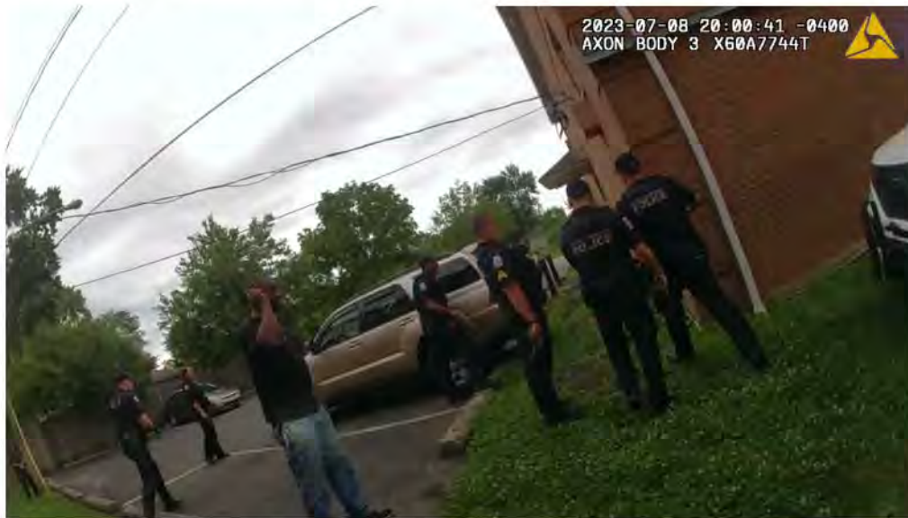
██████████ BWC 1: Officers encounter maintenance worker at rear of building and he tells them "They're inside the building".

██████████ (██████████) cruiser. ██████████ ██████████ then ran towards the rear of the apartment building at 3110 and at 20:00:02 hours a gunshot can be heard with ██████████ uttering "Fuck". The timing of that gunshot would be consistent with the negligent discharge by CPD Officer Joseph Whitehead. When ██████████ arrived at the rear of the apartment building, an African-American male wearing a blue or black T-shirt identified himself as 'Maintenance' and advised "They're inside the building" (See Photo ██████████ BWC 1"). Officers then headed towards the rear door entrance and a male voice can be heard over the radio identifying the "AD" (negligent discharge) from Officer Whitehead.