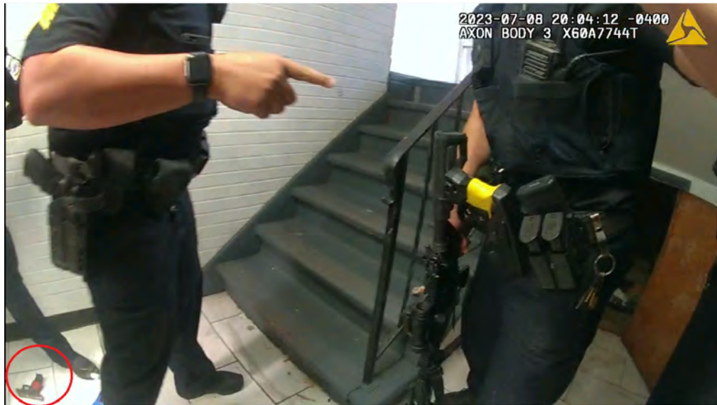
████████ BWC 6: Black pistol seen on floor inside front stairwell landing

After Lindsey fell to the ground, officers advanced towards him announcing “Blue... Blue... Blue”. When the officers reach Lindsey, one of them can be heard asking where the “gun” is located and then one of the officers point out the gun is located on the floor on the other side (south) of the doorway. ██████ ██████ passed through the doorway and entered the landing on the south end of the building where he met up with other officers. At 20:04:12 hours, a black pistol is observed on the floor at the bottom of the stairs on the south end of the building (See Photo ██████ BWC 6”). ██████ ██████ can be heard asking which officer “shot”, and then Sgt. Goodrich instructs those officers to exit the building. Officer can be observed providing first aid to Lindsey during this time. ██████ ██████ exits the front entrance of the building and meeting up with Officer Support. ██████ ██████ BWC footage concludes at 20:05:06 hours.