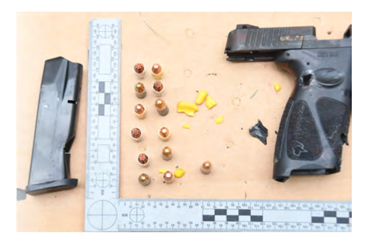
Taurus G3 Handgun - Photographs