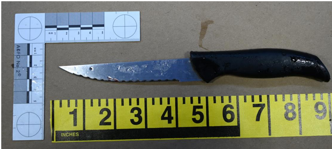
Placard 6: Fixed Blade Knife

A fixed blade knife was located approximately 17' west and south of the cartridge casings. The knife had a black plastic handle and a serrated blade. The overall length of the knife was nine inches. The blade was approximately four and a half inches. The knife was identified with placard 6.