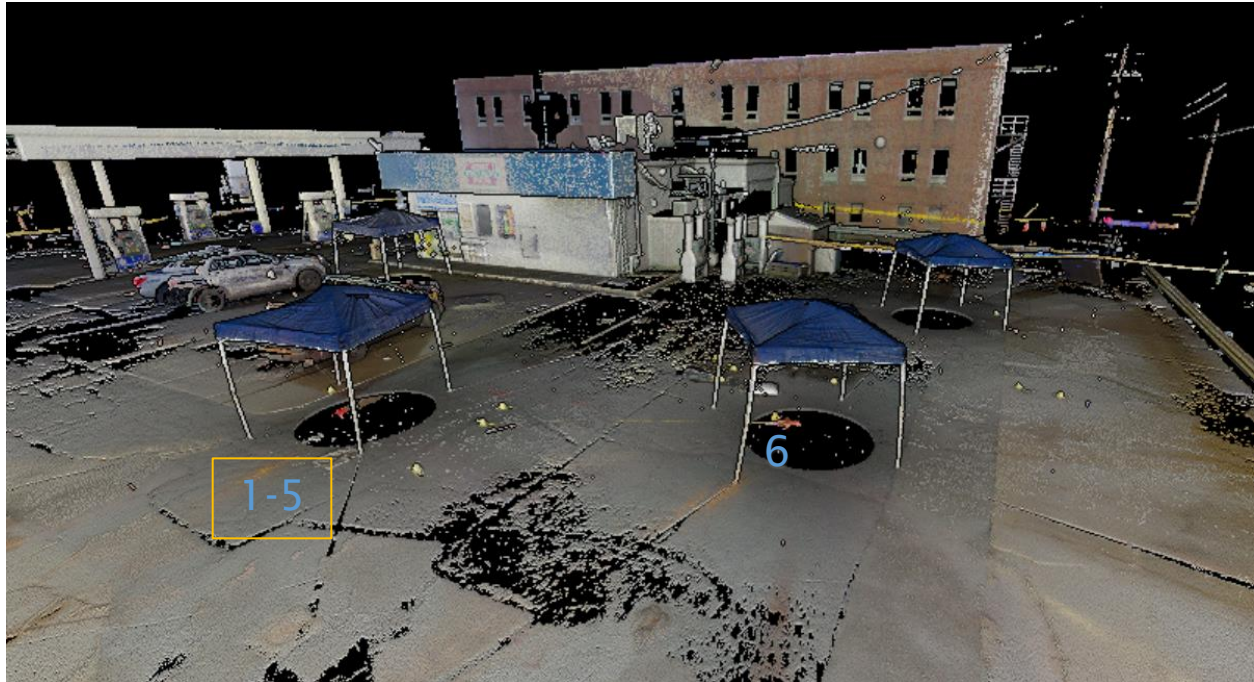
Digital Rendering of the Scene:

Officer Involved Critical Incident - 303 S. Main Street, Celina, OH 45822