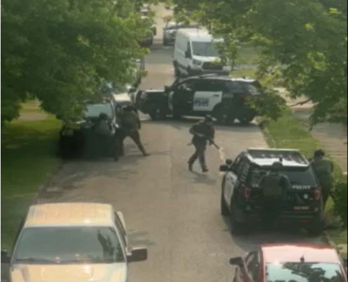
Image depicting another officer moving to cover; approximately 28 seconds into the video

At approximately 41 seconds into the video, the officer who returned fire was observed shooting two more rounds in the direction of 428 Foster Ave. Another officer moved from the black Jeep back to another position of cover.