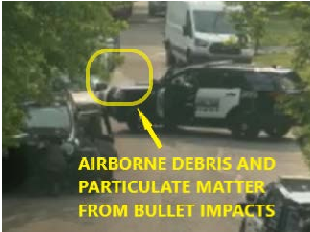
Particles and debris flying from bullet strikes; approximately 18 seconds into the video

At approximately 23 seconds into the video, an officer positioned next to the black Jeep sport utility vehicle parked on the roadway was observed returning fire (in the direction of 428 Foster Ave.); the officer appeared to have fired three shots in rapid succession.