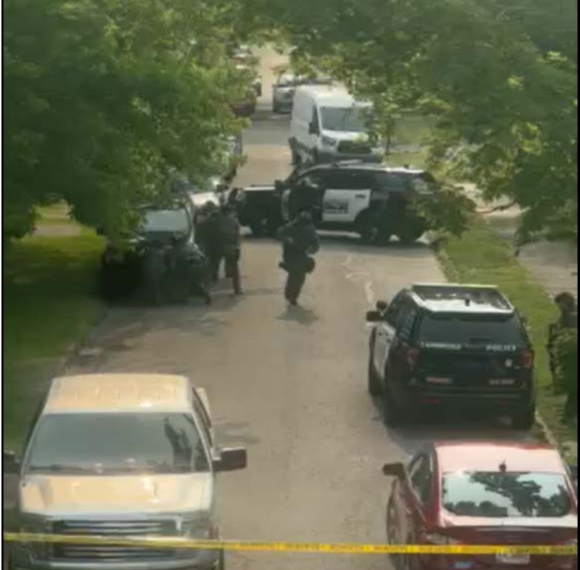
Image depicting officer moving to cover; approximately 10 seconds into the video

This document is the property of the Ohio Bureau of Criminal Investigation and is confidential in nature. Neither the document nor its contents are to be disseminated outside your agency except as provided by law – a statute, an administrative rule, or any rule of procedure.