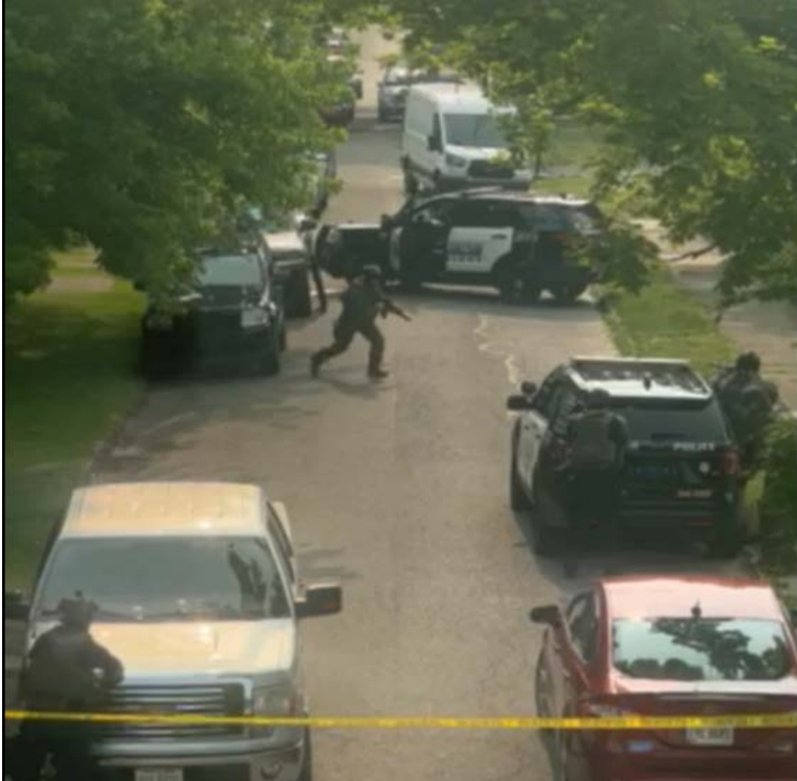
Image depicting officer moving to cover; approximately 52 seconds into the video

The video provided by J-Shin Perry was just over two minutes in length. The video was uploaded to the Matrix case file and attached to this report for reference.