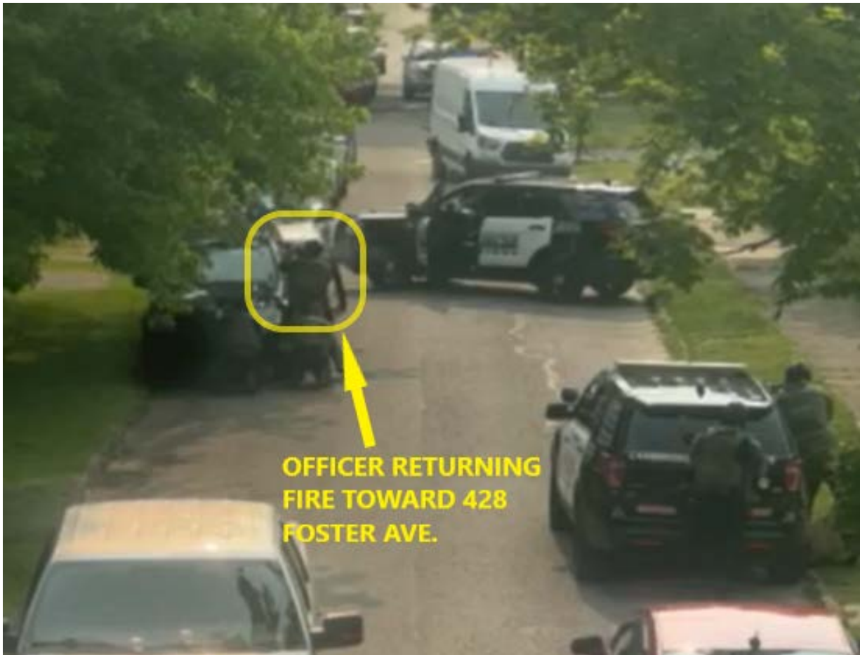
Image depicting officer returning gunfire toward 428 Foster Ave.; approximately 23 seconds into the video

At approximately 28 seconds into the video, another officer was observed moving back from the black Jeep to another position of cover.