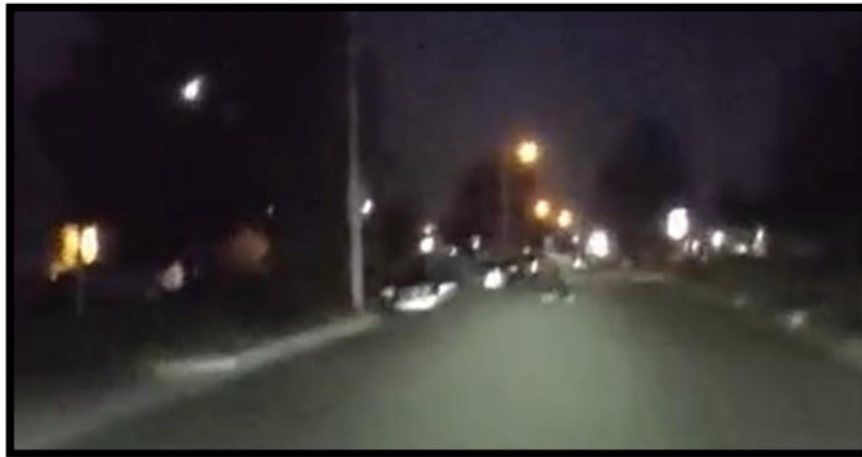
Figure 5: Screenshot from [REDACTED] BWC footage, suspect running across road

The fourth image was of the suspect running north across Barbee Avenue.