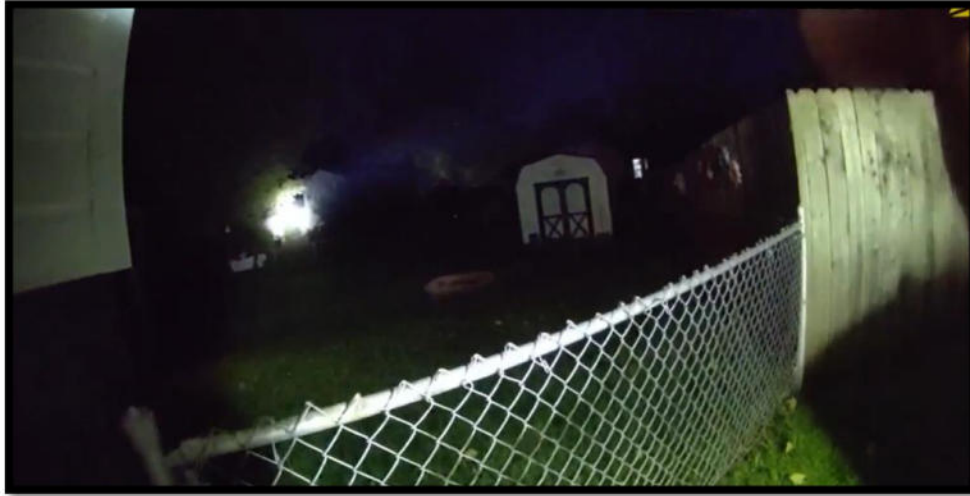
Figure 3: Screenshot from [REDACTED] BWC, nighttime view

2025-3290 Officer Involved Critical Incident - 3810 Louise Ct., Grove City, OH 43123 (L)