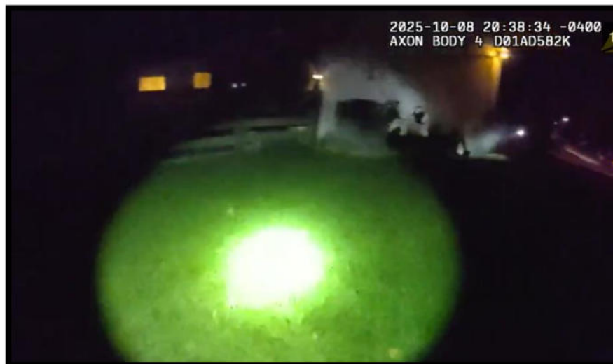
Figure 6: Screenshot from [REDACTED] BWC footage, 20:38:34 timestamp

The sixth image was from when [REDACTED] approached the suspect on the south side of 3667 Sheldon Place. He confirmed that the person holding the flashlight on the right side of the image would have been [REDACTED]