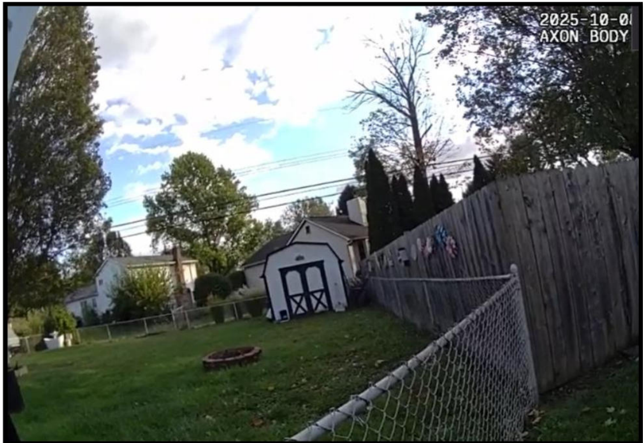
Figure 2: Screenshot from [REDACTED] BWC footage, daytime view

SA Gore showed [REDACTED] a series of screenshots from his body-worn camera (BWC) to provide context and to aid his recall of the incident. The first image was merely a daytime view of the back of 3810 Louise Court, from [REDACTED] position between 3085 and 3095 Barbee Avenue.