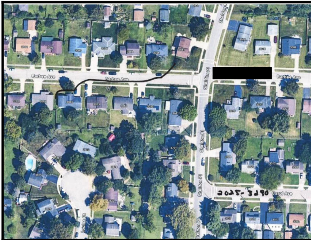
Figure 7: [REDACTED] route of travel

An assortment of area maps was also provided to [REDACTED] to assist in his recall of the events. [REDACTED] traced his approximate route of travel on one of the maps, from the time when he saw the suspect to the moment he engaged him in gunfire.