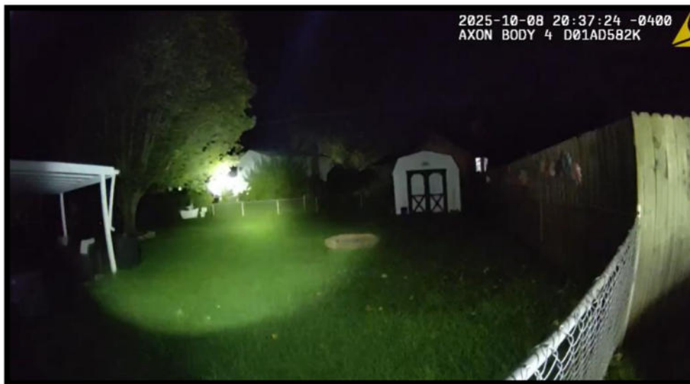
Figure 4: Screenshot from [REDACTED] BWC footage, 20:37:24 timestamp

The third image was from when [REDACTED] yelled at the suspect to stop when he saw him in the back yard. Though not discernible in the video or image, [REDACTED] confirmed that the suspect ran from right to left, in a northeastward direction.