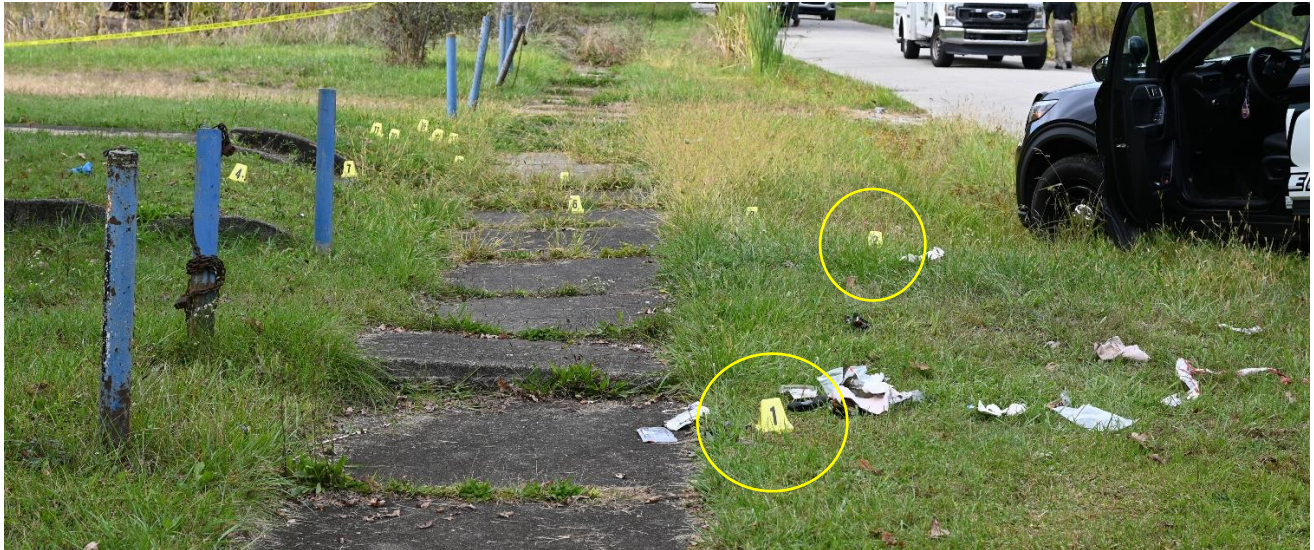
Items 1 & 2

Officer Involved Critical Incident - 681 4th St. SW, Warren, OH 44483, Trumbull County