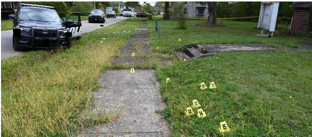
Items 8-15 Hornady .40 caliber cartridge casings

SA Lulla located multiple cartridge casings at the scene that were photographed, documented and later collected.