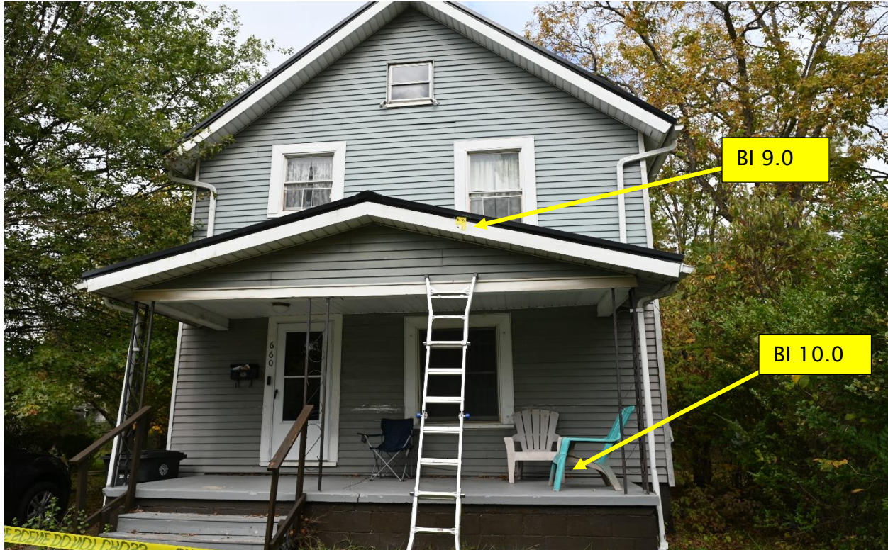
660 4 th St. SW Warren, Ohio

Officer Involved Critical Incident - 681 4th St. SW, Warren, OH 44483, Trumbull County