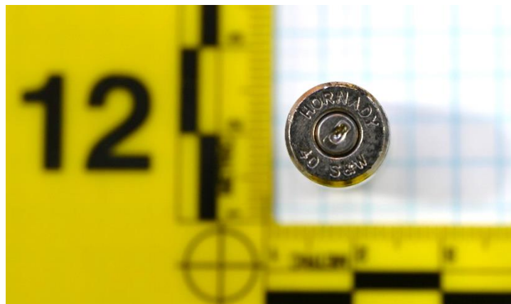
Hornady .40 caliber cartridge casing

This document is the property of the Ohio Bureau of Criminal Investigation and is confidential in nature. Neither the document nor its contents are to be disseminated outside your agency except as provided by law - a statute, an administrative rule, or any rule of procedure.