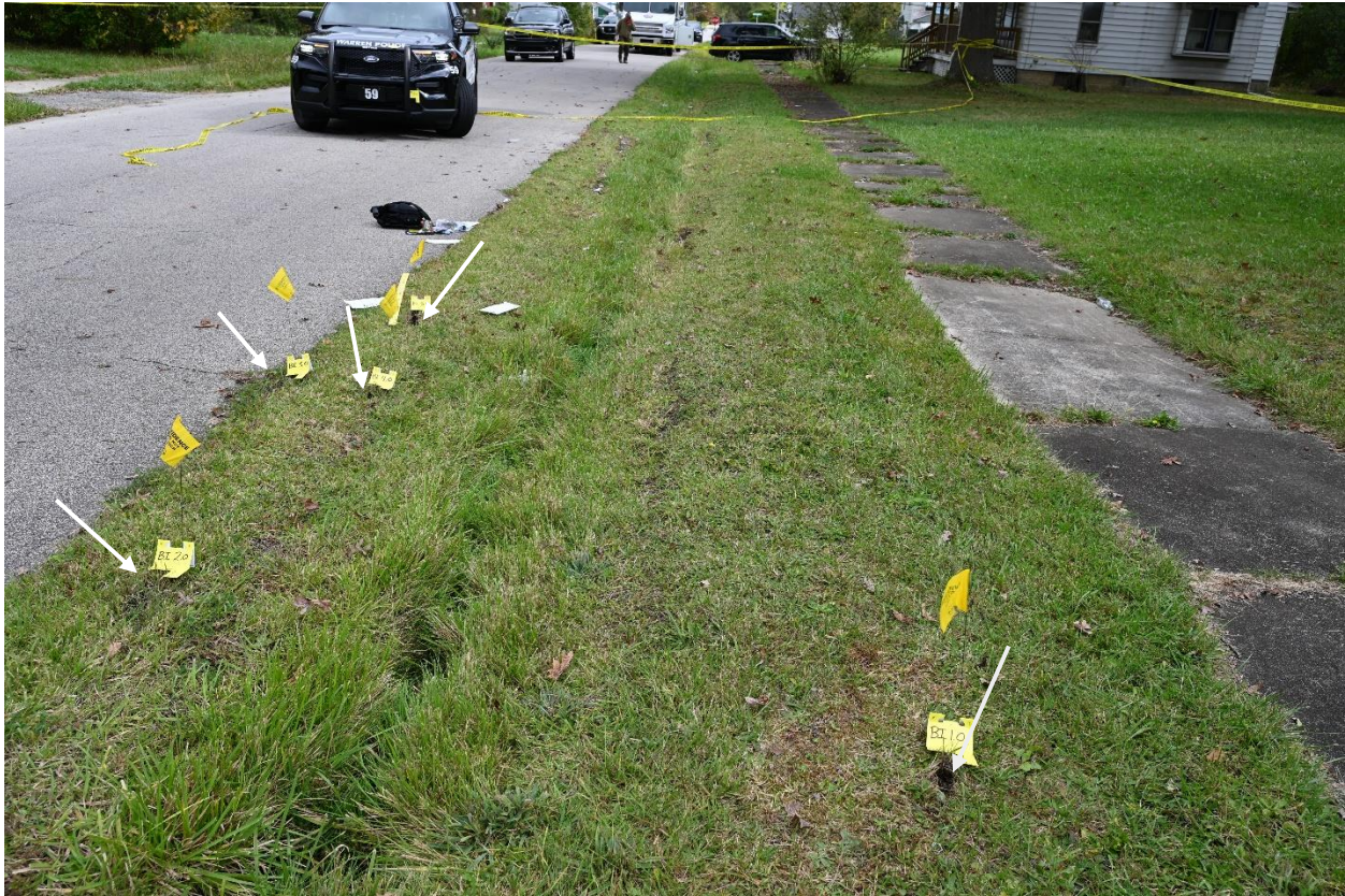
5x apparent Ballistic Impacts in grass

Officer Involved Critical Incident - 681 4th St. SW, Warren, OH 44483, Trumbull County