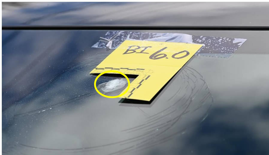
BI 6.0 Did not penetrate the windshield

This document is the property of the Ohio Bureau of Criminal Investigation and is confidential in nature. Neither the document nor its contents are to be disseminated outside your agency except as provided by law - a statute, an administrative rule, or any rule of procedure.