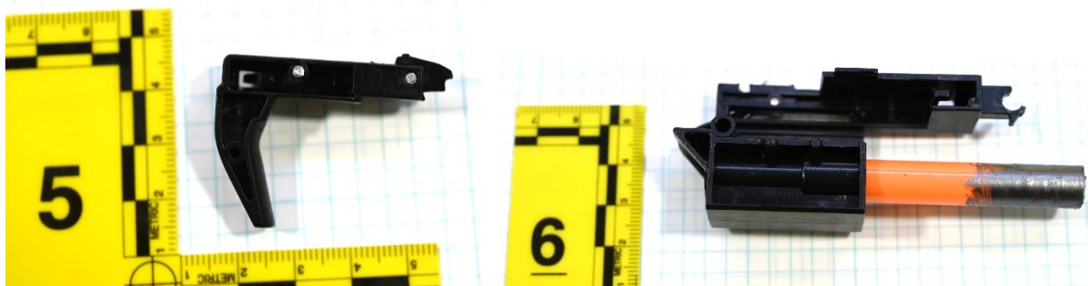
Items 1/2/3/5/ 6

This document is the property of the Ohio Bureau of Criminal Investigation and is confidential in nature. Neither the document nor its contents are to be disseminated outside your agency except as provided by law - a statute, an administrative rule, or any rule of procedure.