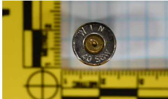
WIN .40 caliber cartridge casing

Officer Involved Critical Incident - 681 4th St. SW, Warren, OH 44483, Trumbull County