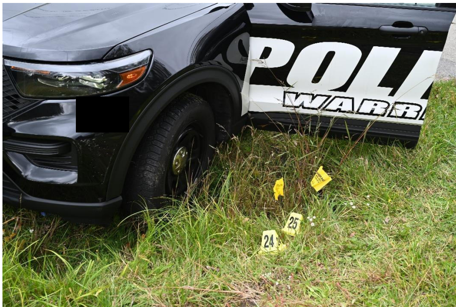
Items 25 / 25 Speer 9mm cartridge casings

Located outside the driver's doors of Warren Police Cruiser # [REDACTED], there were two Speer 9mm cartridge casings which were photographed, documented and later collected.