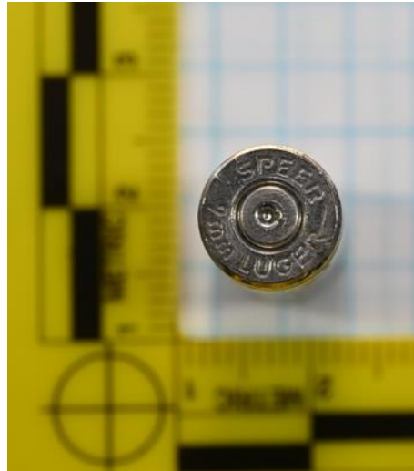
Speer 9mm cartridge casing

Officer Involved Critical Incident - 681 4th St. SW, Warren, OH 44483, Trumbull County