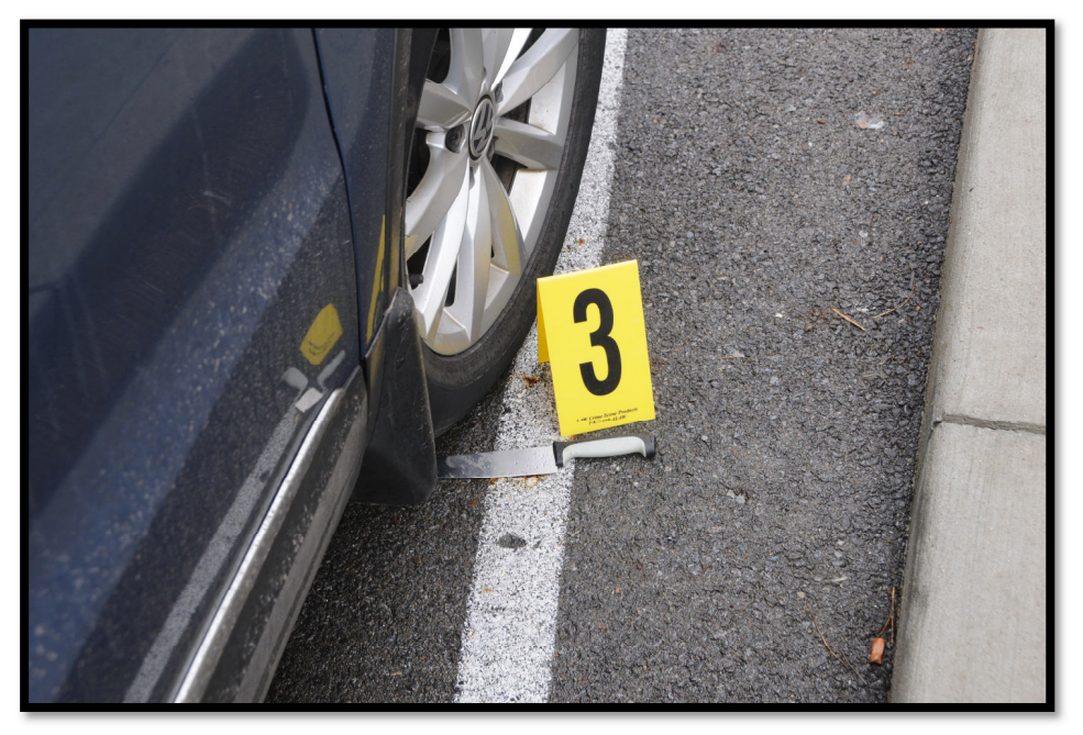
(Item 3: kitchen knife by front passenger wheel of Volkswagen)

Officer Involved Critical Incident - 500 N. Nelson Road, Columbus, Ohio 43219 (L)