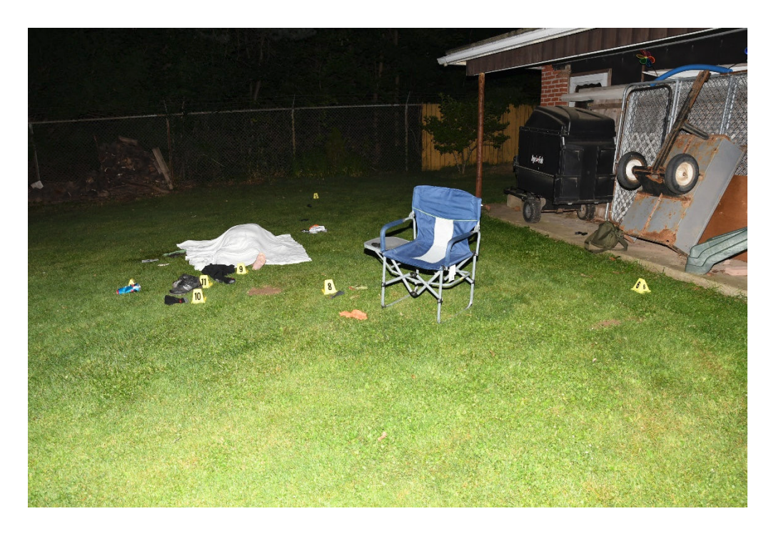
Figure 3: Backyard

On the garage roof five Hornady 223 fired cartridge cases were located and collected as Evidence Items #14-18.