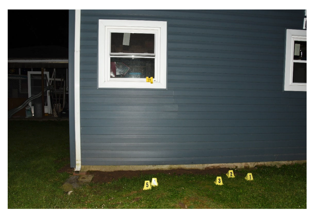
Figure 2: North Side Yard

2024-1837 Officer Involved Critical Incident - Shannon Sloan,