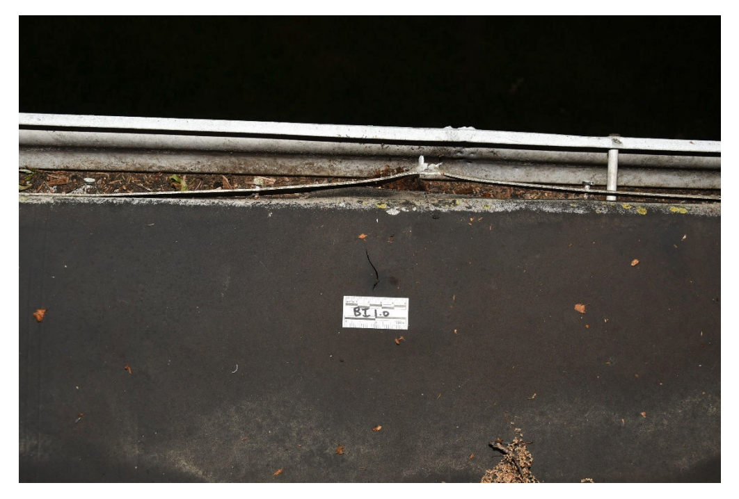
Figure 5: BI 1.0

2024-1837 Officer Involved Critical Incident - Shannon Sloan,