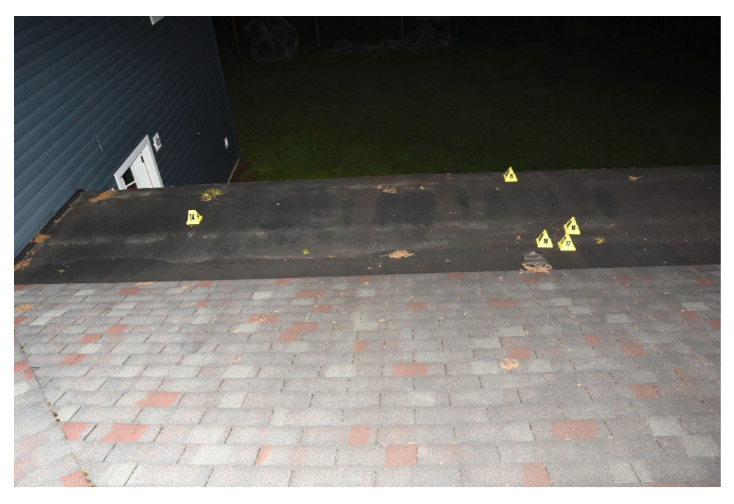
Figure 4: Garage Roof

2024-1837 Officer Involved Critical Incident - Shannon Sloan,