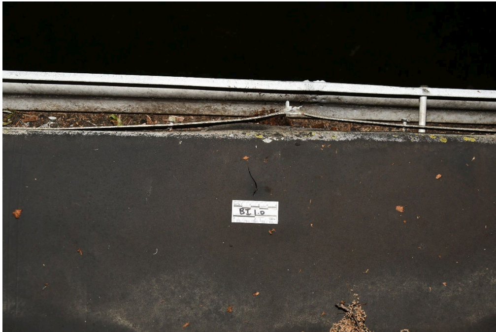
Figure 5: BI 1.0

Officer Involved Critical Incident - Shannon Sloan, [REDACTED] [REDACTED] (S)