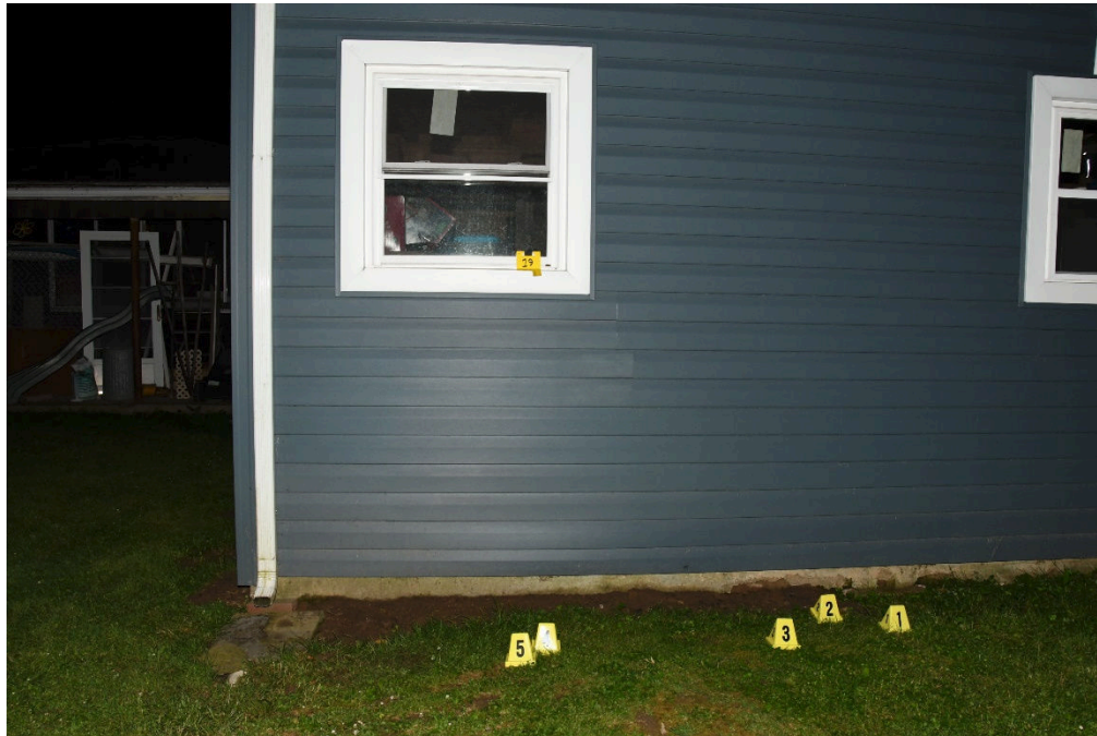
Figure 2: North Side Yard

Officer Involved Critical Incident - Shannon Sloan, [REDACTED] [REDACTED] (S)