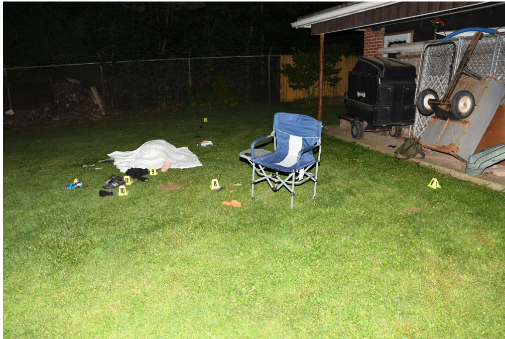
Figure 3: Backyard

Officer Involved Critical Incident - Shannon Sloan, [REDACTED] [REDACTED] (S)