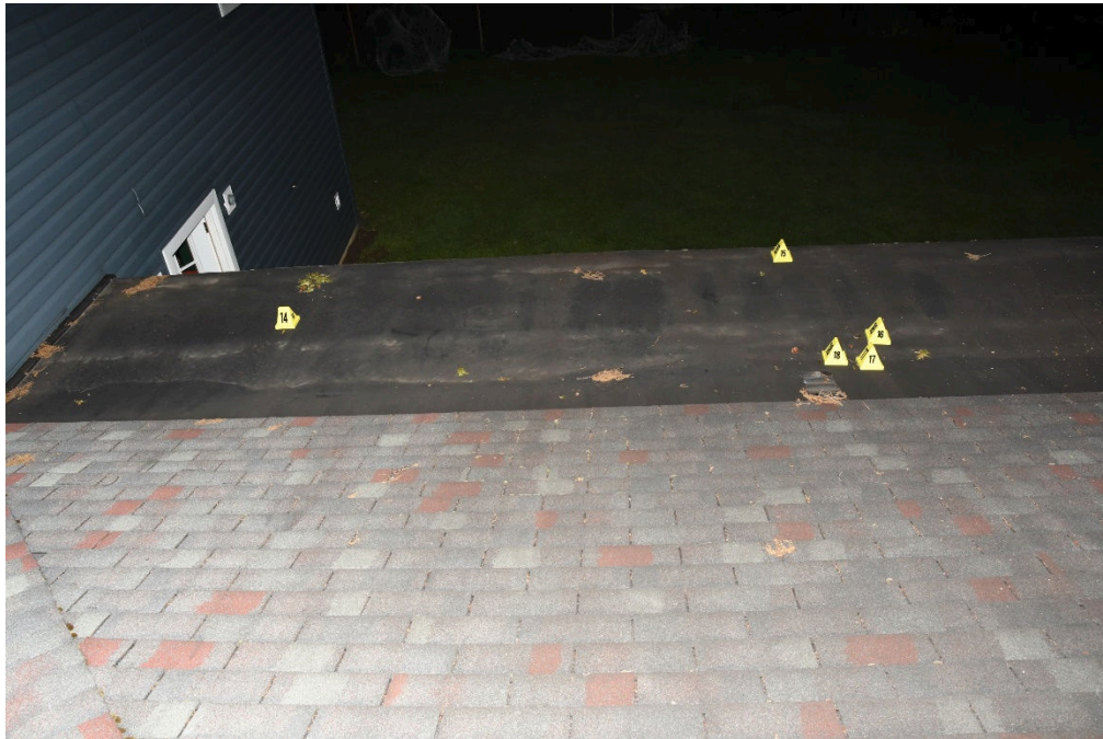
Figure 4: Garage Roof

Officer Involved Critical Incident - Shannon Sloan, [REDACTED] [REDACTED] (S)