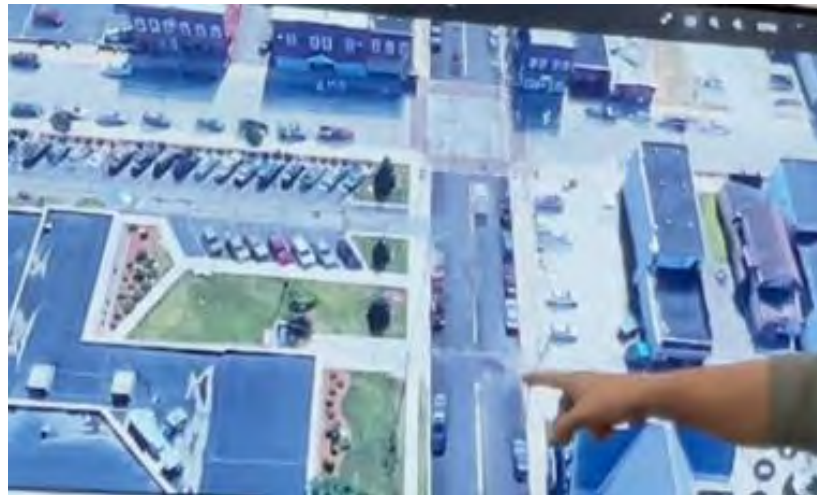
Officer ██████ Interview Image 1

Officer Involved Critical Incident - 500 West Hopocan, Barberton, OH 44203