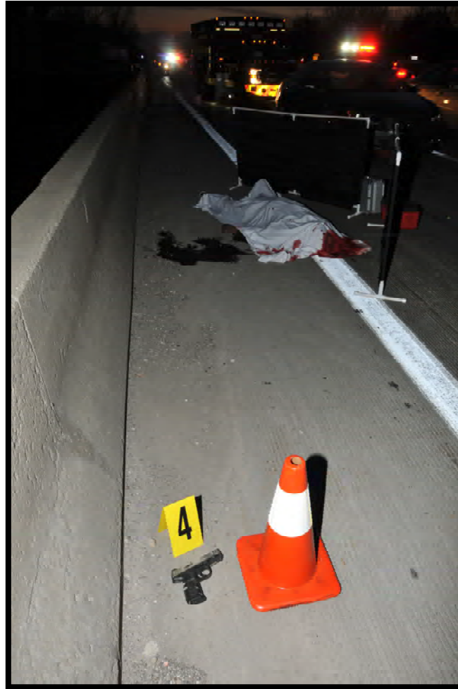
(Firearm [Item #4] located near the body of Teague)

Officer Involved Critical Incident – Interstate 270 Northbound on Big Walnut Creek Bridge (L)