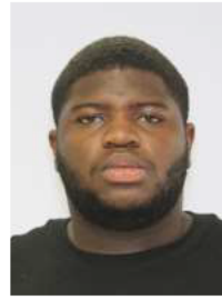
Click to Enlarge Title:2020 Photo Date:7/22/2020