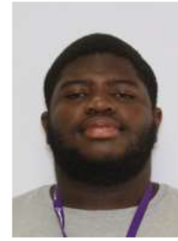
Click to Enlarge Title:2020 Photo Date:8/13/2020