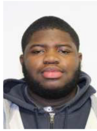
Click to Enlarge Title:2020 Photo Date:1/15/2020