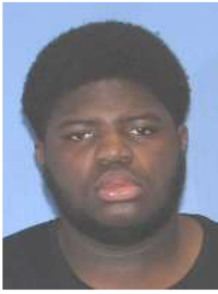
Click to Enlarge Title:2018 Photo Date:5/7/2018