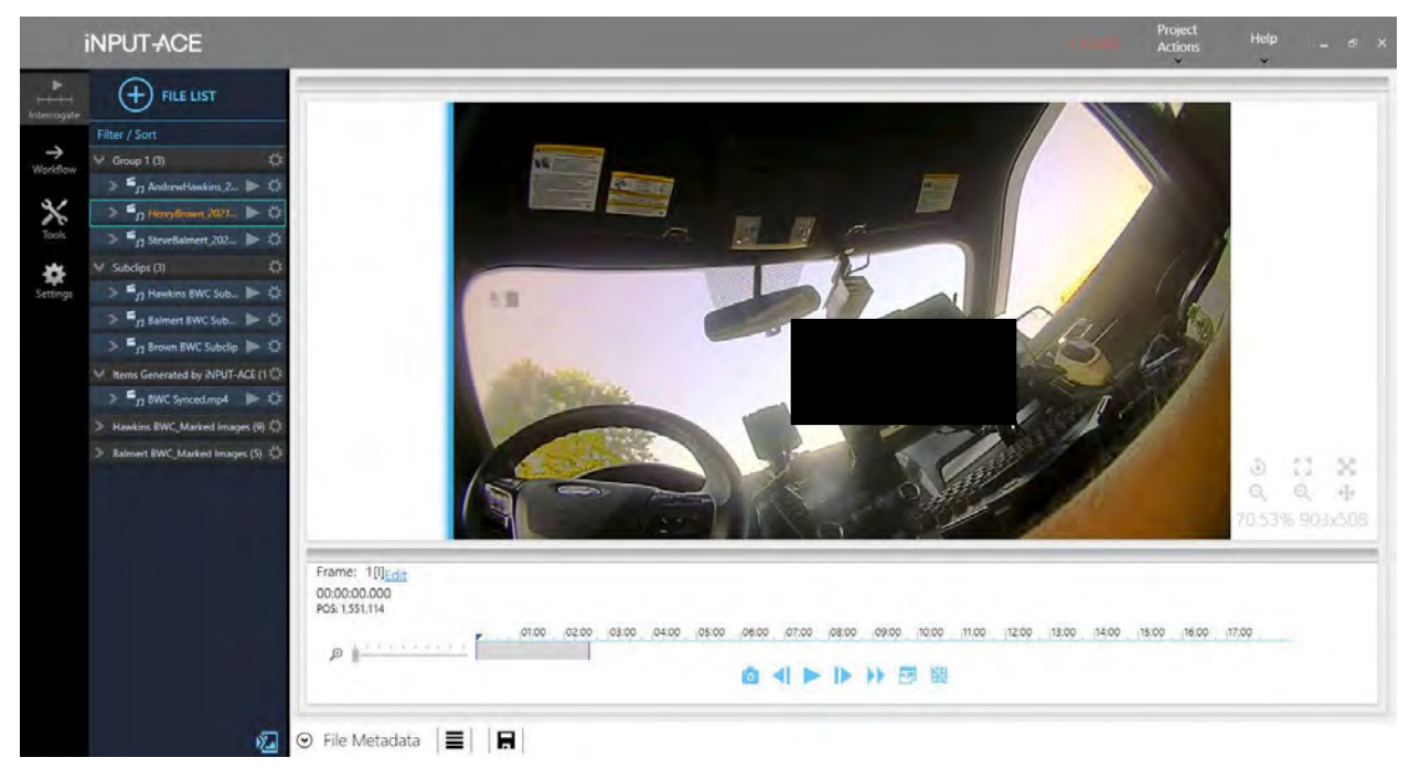
Figure 1: Screenshot of iNPUT ACE playing Ofc. Balmert's BWC, with Metadata included.