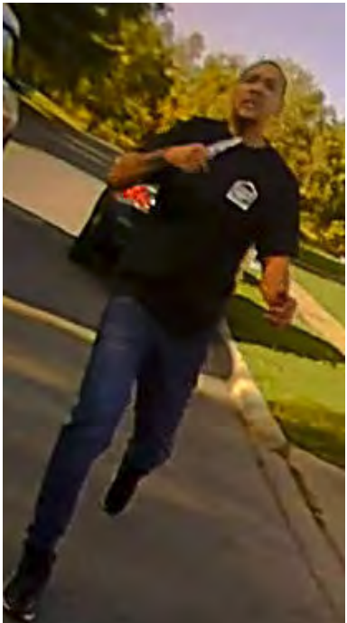
Figure 5: Cropped image of F3626