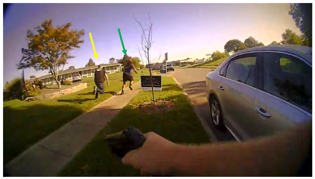
Figure 7: Veyon (yellow arrow) chasing Marshall (green arrow). Arrows added by SA Collins.

As Marshall continued to run north/northeast, away from Veyon, she changed direction and began running east and then southeast. See Figure 7 .