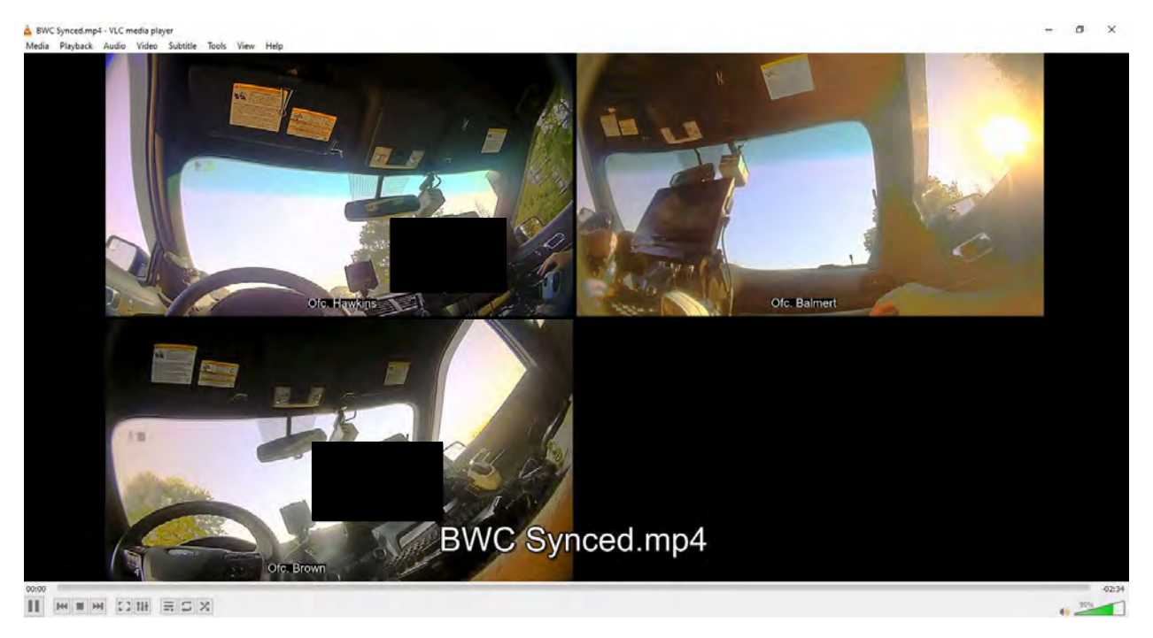
Screenshot of Synced BWC video