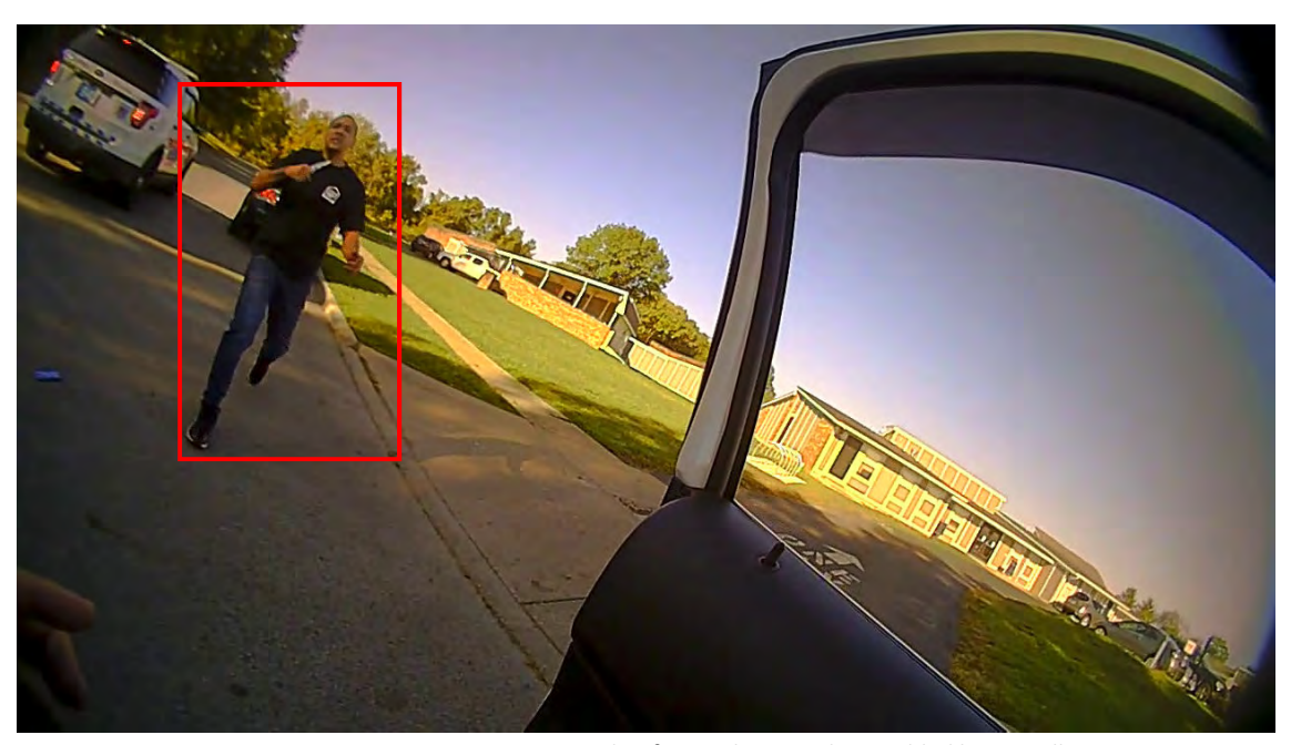
Figure 4: F3626_Veyon coming towards Ofc. Hawkins. Red Box added by SA Collins