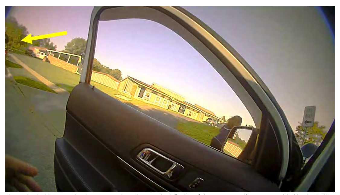
Figure 3: F3599_Veyon begins to come into view on the left side of the screen. Yellow arrow added by SA Collins.

At 02:00.151 into the recording, Veyon began to enter view from the left side of the screen as Marshall was seen running from left to right. See Figure 3 .