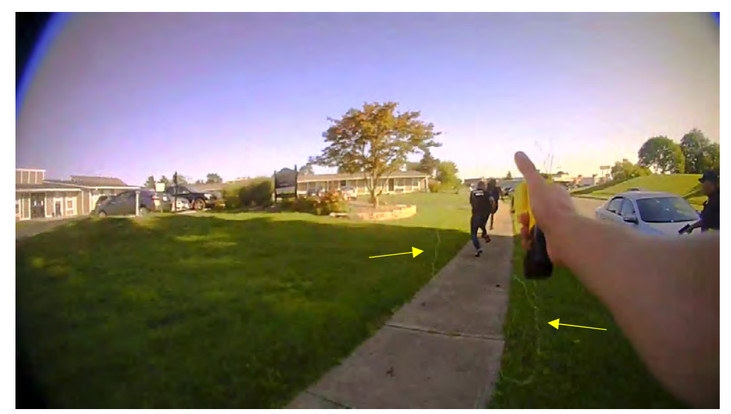
Figure 4: 4179_Taser wires can be seen coming from Taser, towards Veyon. Arrows added by SA Collins

As Veyon began running into the direction of Marshall, it is unknown of when Ofc. Balmert deployed his taser. However, as shown in Figure 4 , it appeared there were taser wires extending from Ofc. Balmert's Taser toward Veyon.