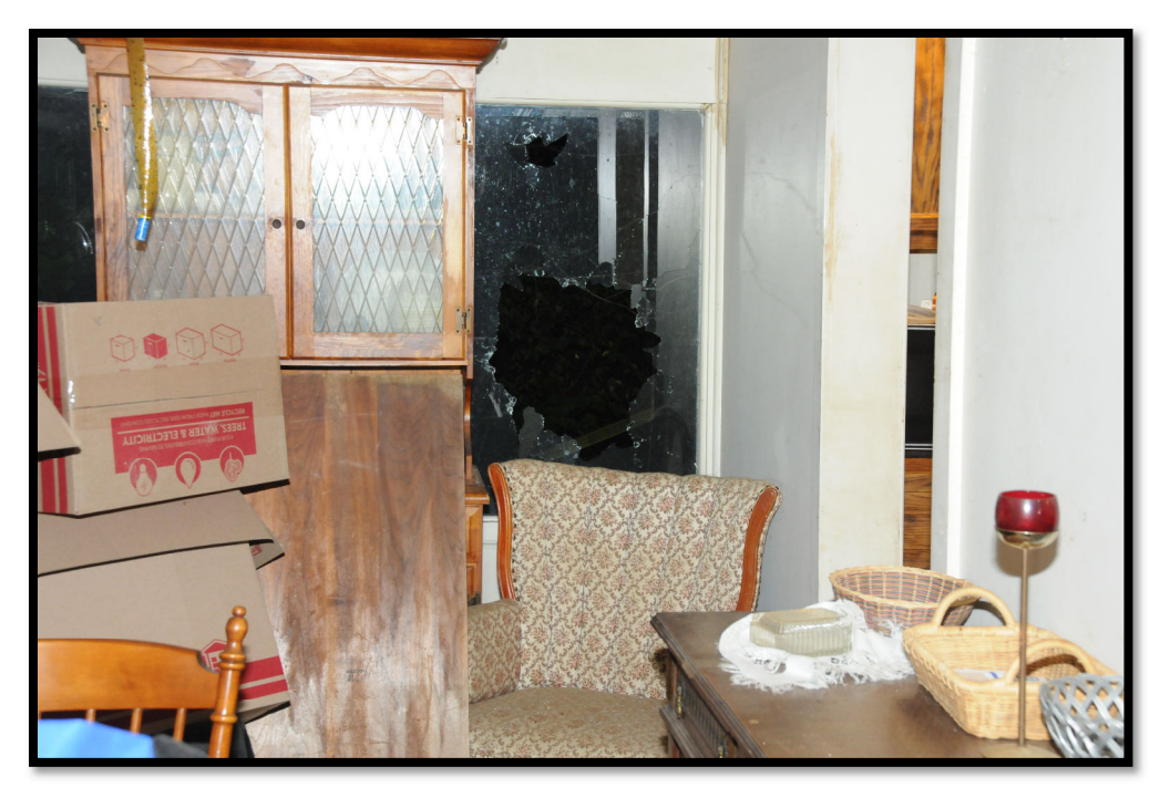
(Window shot out on west side of the house)

There was a parked 2006, 4-door gold Cadillac with no license plate, parked in the driveway. The vehicle identification number: 1G6DM57T160107606 returned with no information however there was a temporary registration paperwork from the Ohio Bureau of Motor Vehicles found in the glove compartment with Delano's information on it. There were belongings and prescription bottles belonging to Delano also located within the vehicle. It was reported Delano discharged the shotgun when she was standing next to the vehicle. A shot shell (item 3) was located on the ground, near the front of the vehicle and medical supplies. The shotgun on the ground was a Stevens 320, 20 gauge with serial number: 183323K. The shotgun's safety was in the fire position. The slide was rearward with no ammunition in the chamber or magazine tube. The shotgun was packaged as item 2.