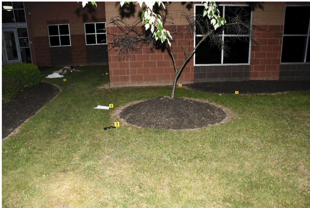
Figure 2: Overall - Evidence Items 1-4 & 6-8

deployed cartridge with wires on it was collected and labeled Evidence Item #3 . Three OH-3 statement forms were located, collected and labeled Evidence Item #4 . Two taser cartridge doors were located. One was located on the sidewalk, subsequently collected and labeled Evidence Item #5 . The second cartridge door was located in the yard, collected and labeled Evidence Item #6 . A pink fanny pack being used as a purse was located, collected and labeled Evidence Item #7 . A Benjamin Trail NP pellet gun was located to the north of the main entrance. The pellet gun was collected and labeled Evidence Item #8 .