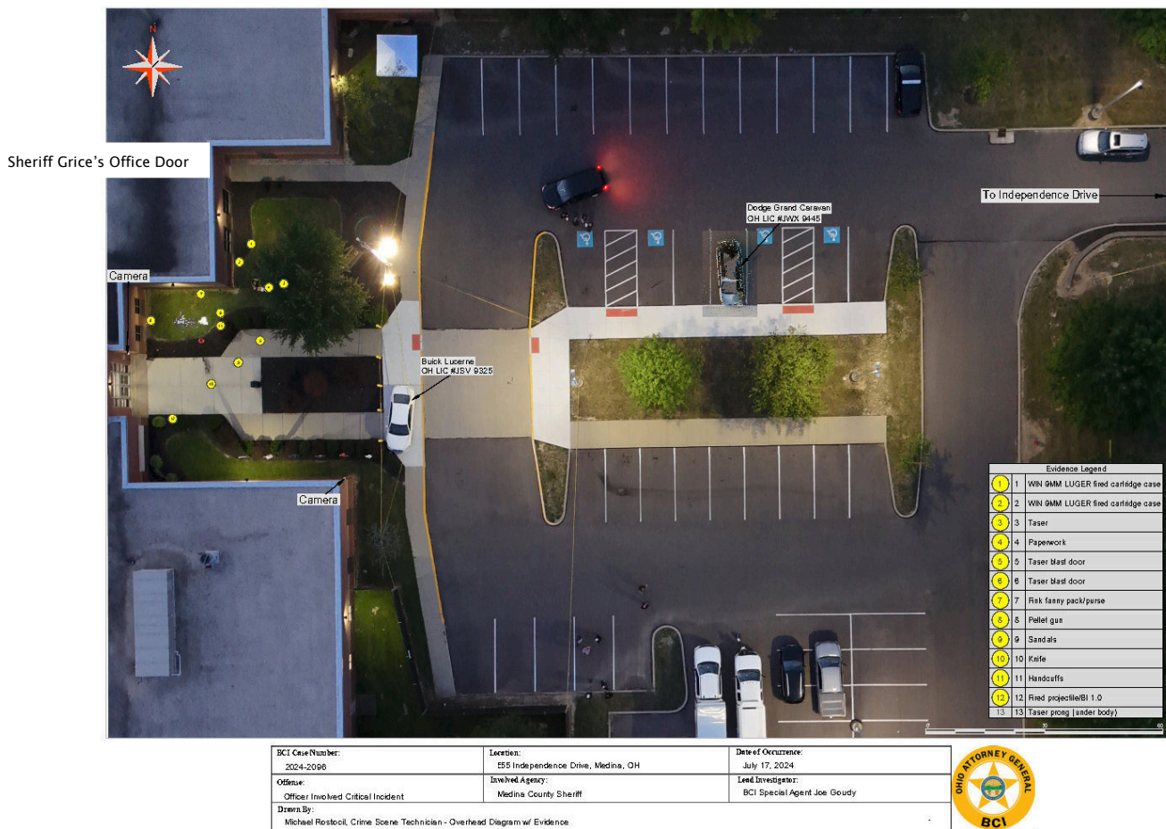
Figure 1: Overhead Diagram