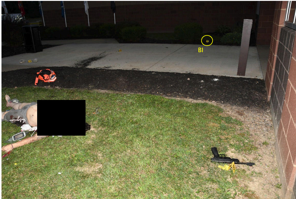
Figure 4: Overall - BI 1.0

Officer Involved Critical Incident - 555 Independence Dr., Medina, Ohio 44256