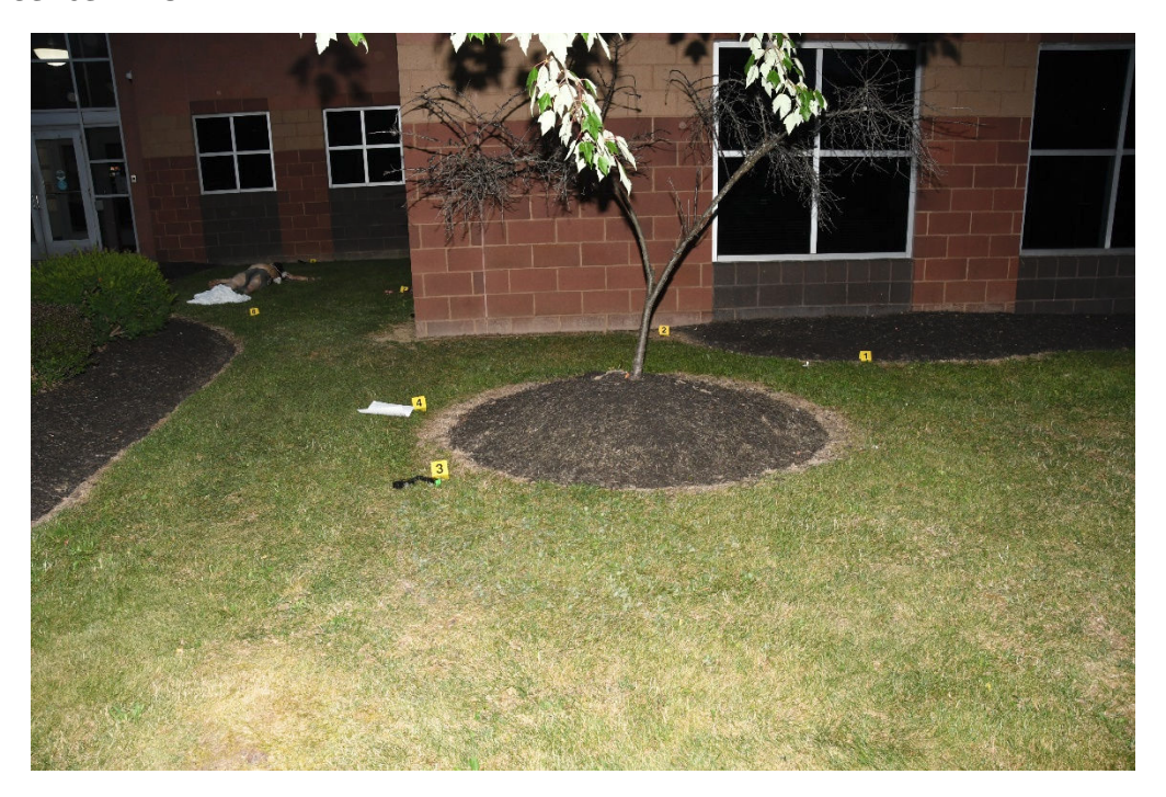
Figure 2: Overall - Evidence Items 1-4 & 6-8

deployed cartridge with wires on it was collected and labeled Evidence Item #3 . Three OH-3 statement forms were located, collected and labeled Evidence Item #4 . Two taser cartridge doors were located. One was located on the sidewalk, subsequently collected and labeled Evidence Item #5 . The second cartridge door was located in the yard, collected and labeled Evidence Item #6 . A pink fanny pack being used as a purse was located, collected and labeled Evidence Item #7 . A Benjamin Trail NP pellet gun was located to the north of the main entrance. The pellet gun was collected and labeled Evidence Item #8 .