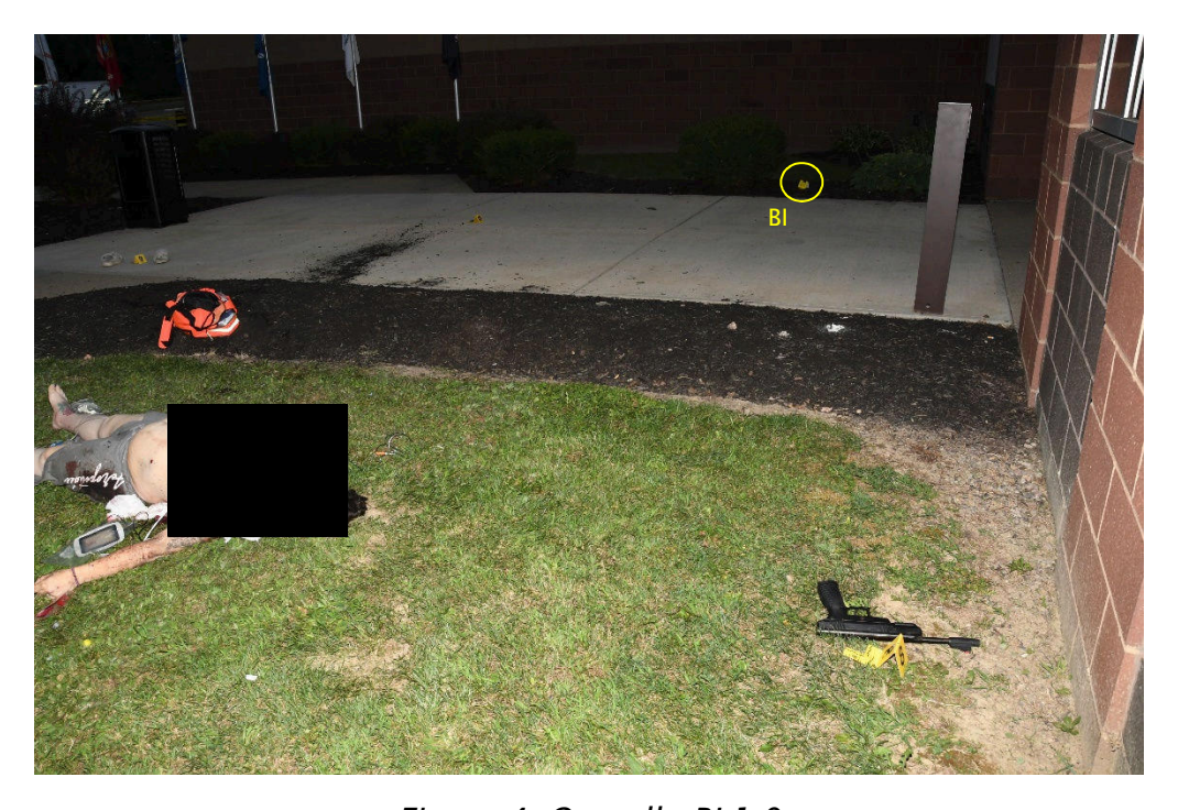
Figure 4: Overall - BI 1.0

2024-2096 Officer Involved Critical Incident - 555 Independence Dr., Medina, Ohio 44256