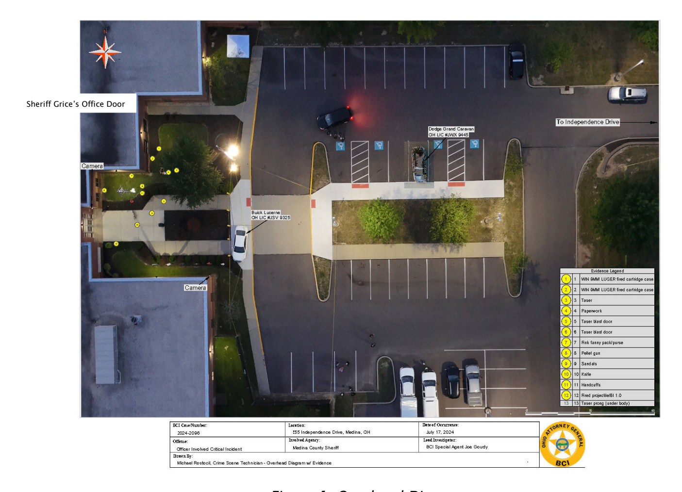
Figure 1: Overhead Diagram