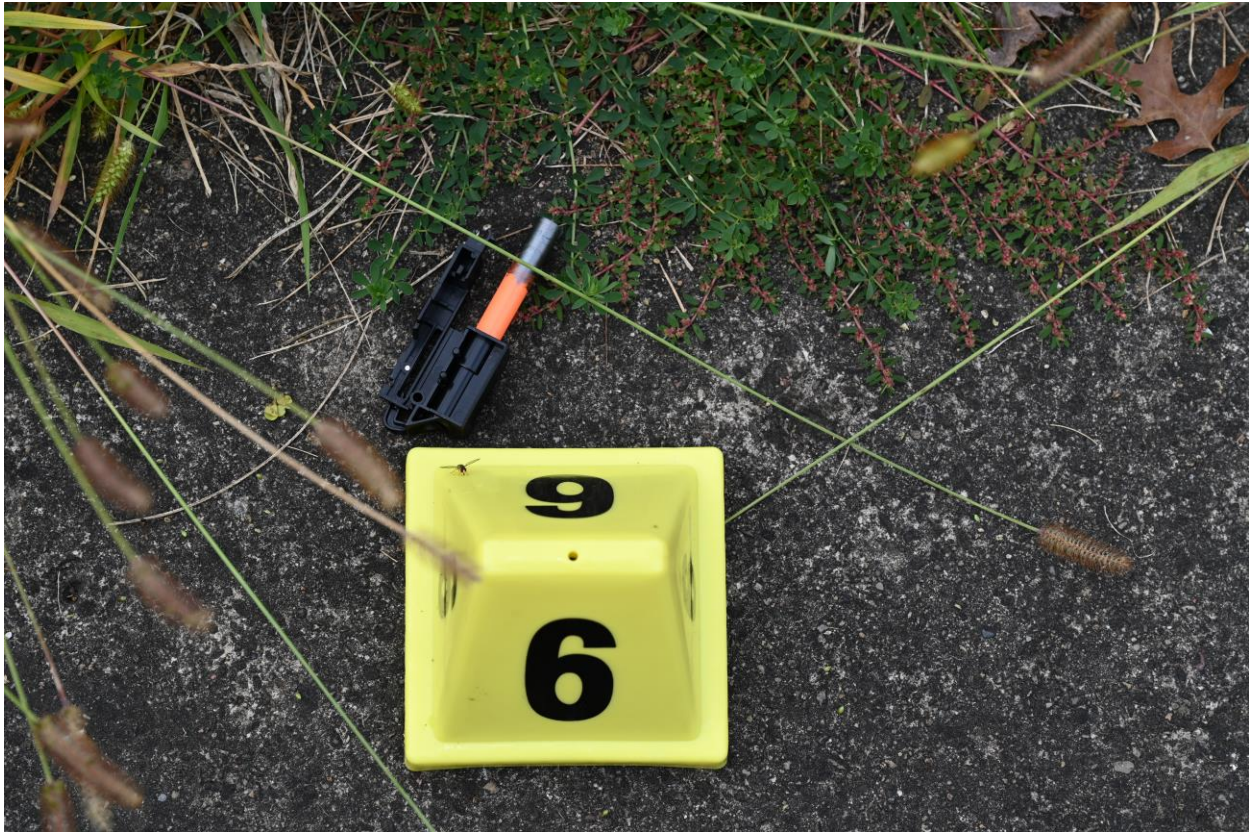
Figure 7: Placard #6, Evidence #15, plastic gun part (internal barrel) (Photo ERL_0033)

Officer Involved Critical Incident - 681 4th St. SW, Warren, OH 44483, Trumbull County (L)