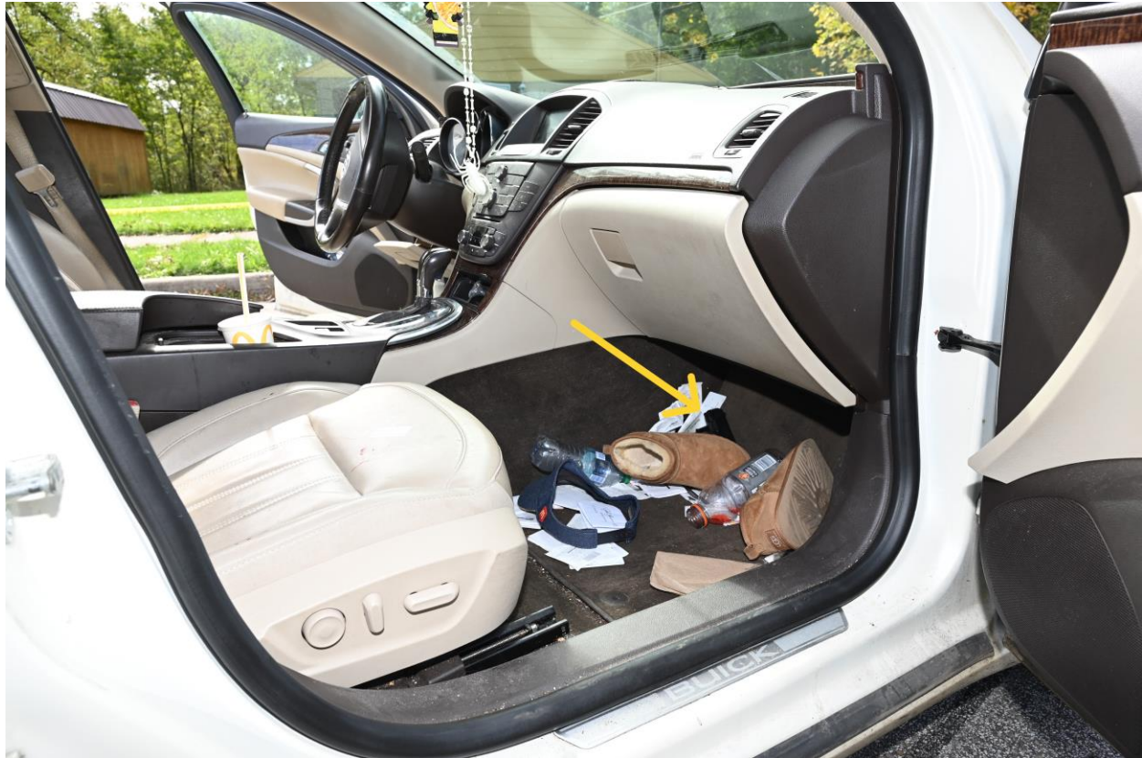
Figure 9: Found replica handgun located in front passenger floorboard area with yellow arrow depicting (Photo LGH_1975)

Officer Involved Critical Incident - 681 4th St. SW, Warren, OH 44483, Trumbull County (L)