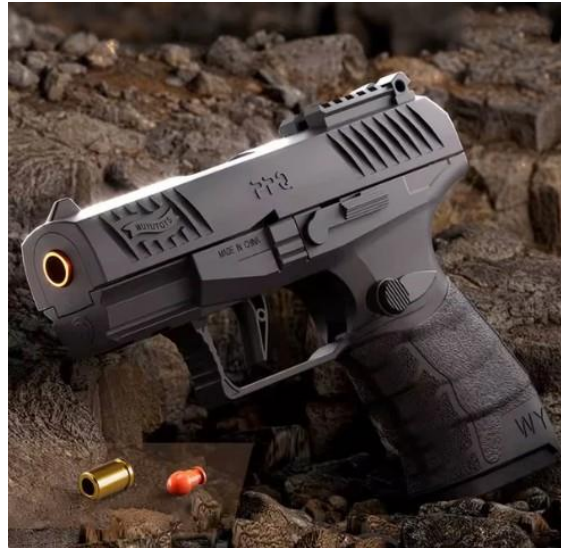
Figure 15: Left Photo - Real Walther 9mm PPQ, Right Photo - Chinese made PPQ Shell Ejection "Toy Gun" direct replica of real-world handgun

All crime scene evidence photos referenced in this report can be found in Axon Evidence, and information related to the replica handguns possessed and used by Brad Bailey can be found through various public resources online.