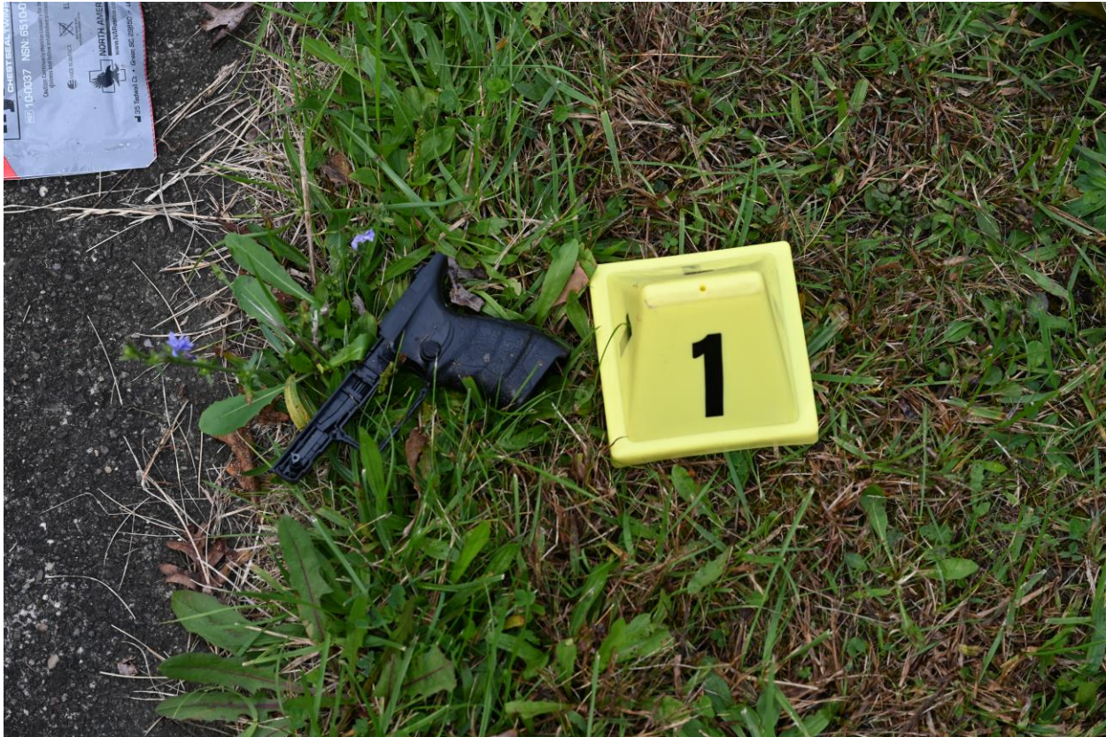
Figure 2: Crime Scene Photo ERL_0022 of Placard #1, Evidence Property #10 Plastic Grip from pistol of replica handgun.

Officer Involved Critical Incident - 681 4th St. SW, Warren, OH 44483, Trumbull County (L)