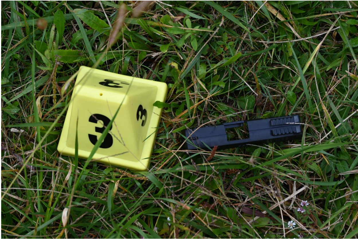
Figure 5: Placard #3, Evidence #12, plastic slide from gun (Photo ERL_0028)

Officer Involved Critical Incident - 681 4th St. SW, Warren, OH 44483, Trumbull County (L)