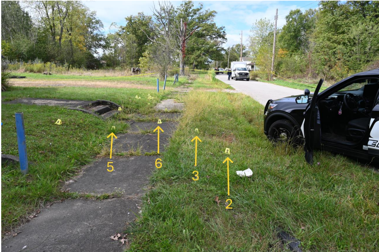
Figure 3: Placard number illustration with found replica gun parts (Photo ERL_0023)

Officer Involved Critical Incident - 681 4th St. SW, Warren, OH 44483, Trumbull County (L)