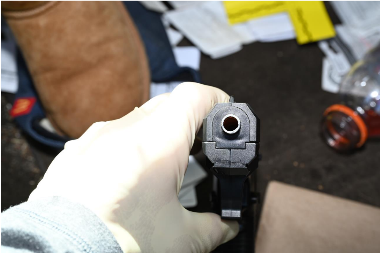
Figure 13: Replica GX4 XL Handgun found in passenger floorboard area of white Buick Regal, front barrel view (photo LGH_1983)

Officer Involved Critical Incident - 681 4th St. SW, Warren, OH 44483, Trumbull County (L)