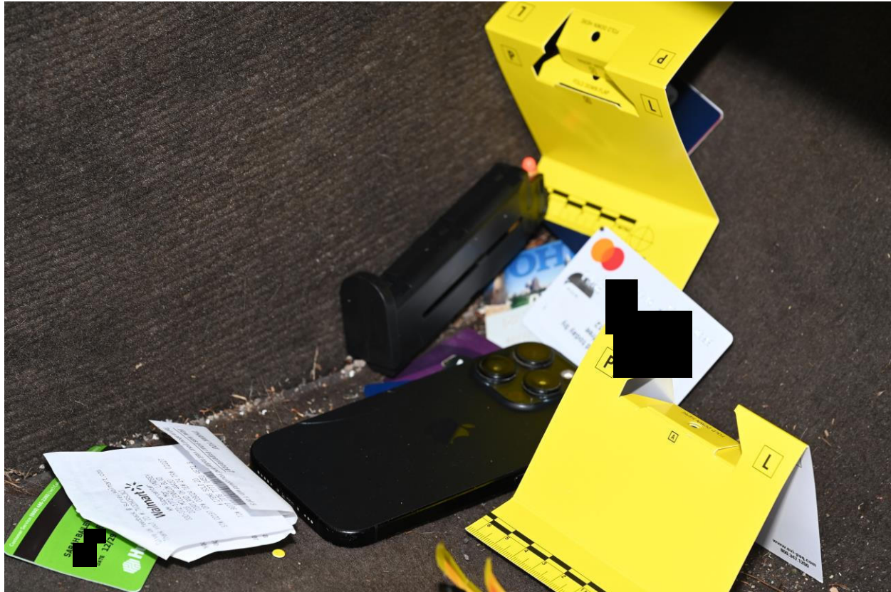
Figure 11: Foam Dart Magazine for replica handguns and black iPhone belonging to Brad Bailey also found in the front passenger floorboard area (Photo LGH_1985)

Officer Involved Critical Incident - 681 4th St. SW, Warren, OH 44483, Trumbull County (L)