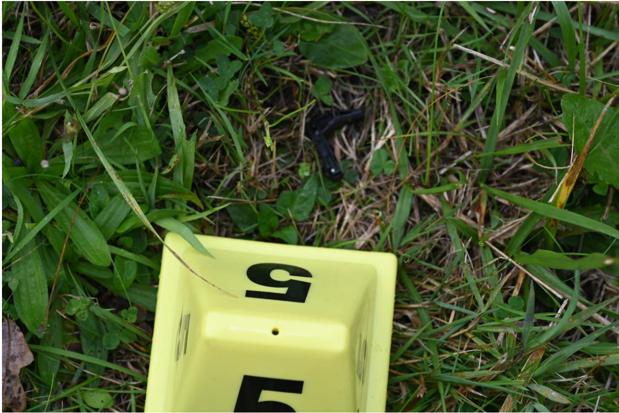
Figure 6: Placard #5, Evidence #14. Plastic trigger from gun (Photo ERL_0032)

Officer Involved Critical Incident - 681 4th St. SW, Warren, OH 44483, Trumbull County (L)