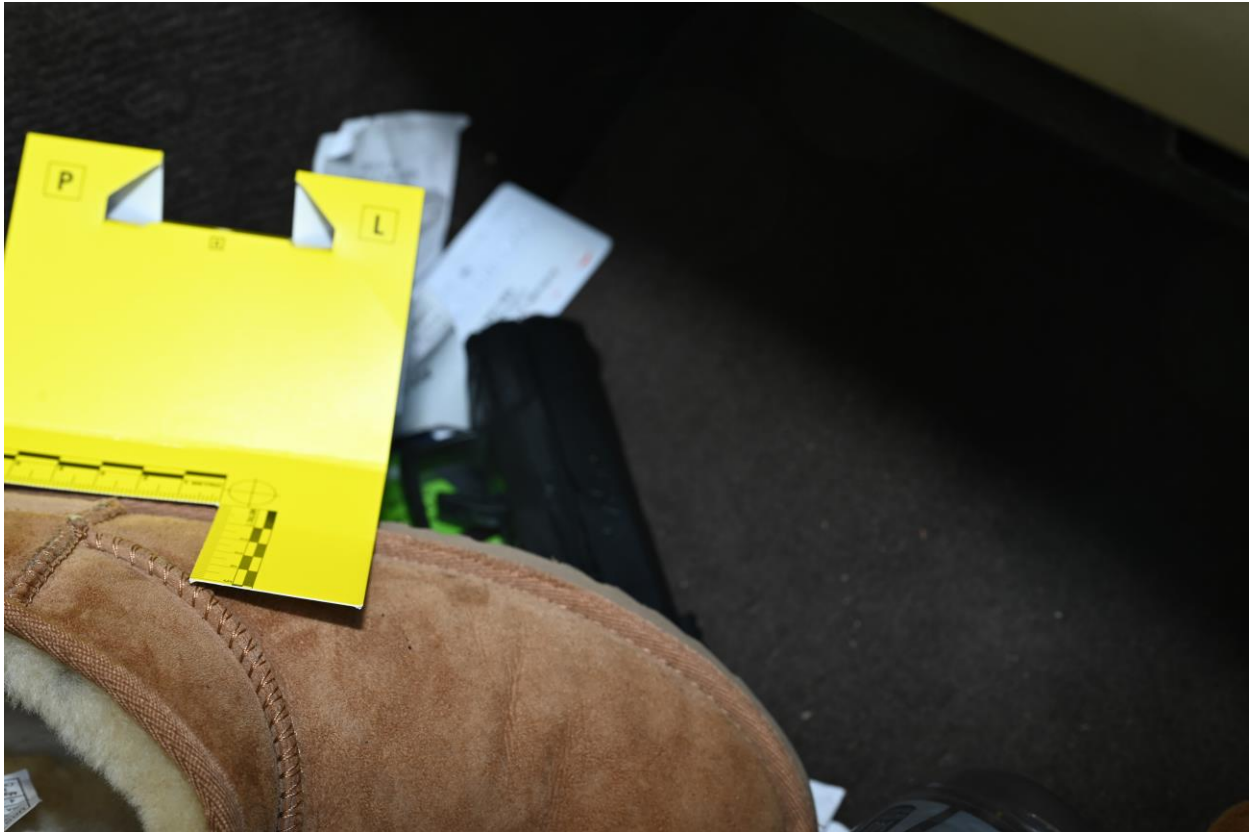
Figure 10: Zoomed in view of found replica handgun in the front passenger floorboard area (Photo LGH_1979)

Officer Involved Critical Incident - 681 4th St. SW, Warren, OH 44483, Trumbull County (L)