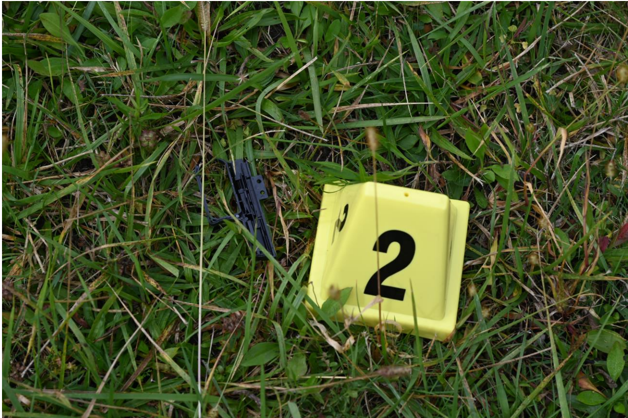
Figure 4: Placard #2, Evidence #11, plastic gun part (Photo ERL_0025)

Officer Involved Critical Incident - 681 4th St. SW, Warren, OH 44483, Trumbull County (L)