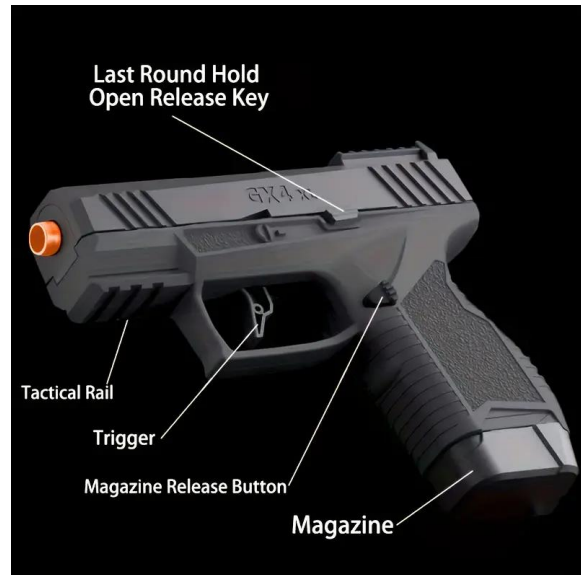
Figure 14: Left Photo - Real Taurus 9mm GX4 XL, Right Photo - Chinese made GX4 XL Shell Ejection “Toy Gun” direct replica of real-world handgun

This document is the property of the Ohio Bureau of Criminal Investigation and is confidential in nature. Neither the document nor its contents are to be disseminated outside your agency except as provided by law - a statute, an administrative rule, or any rule of procedure.