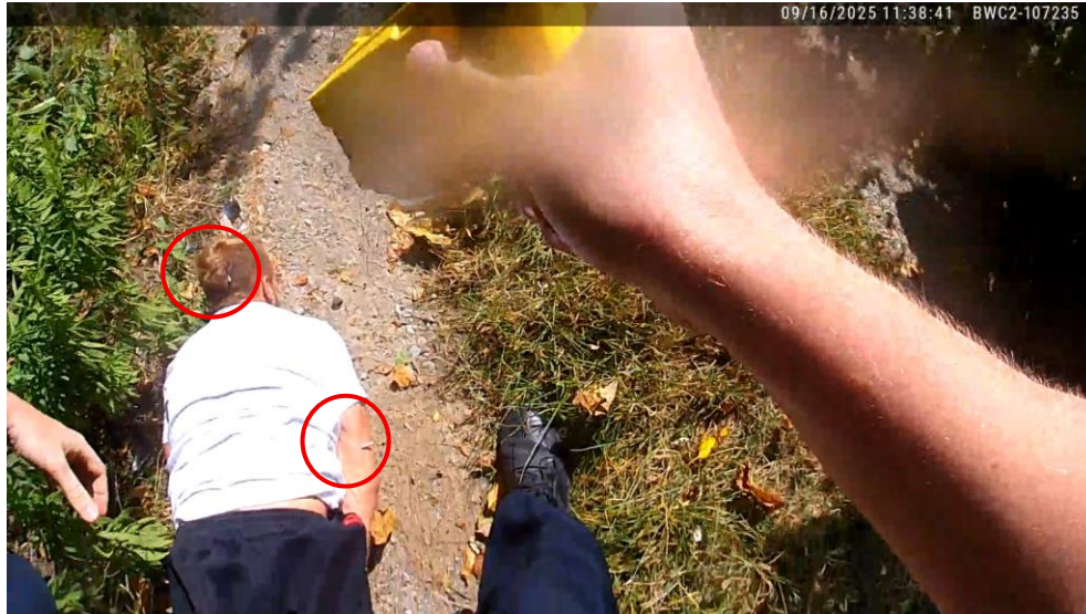
11:38:41 hours – Taser probes observed

Officer Involved Critical Incident - 513 South Isabella St., Springfield, OH 45506 (L)