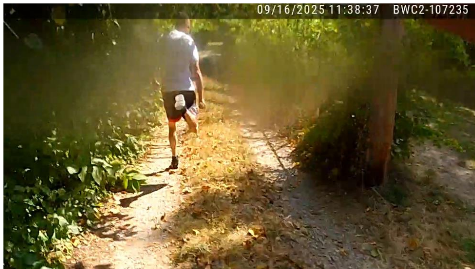
11:38:37 hours – Male subject running in alleyway