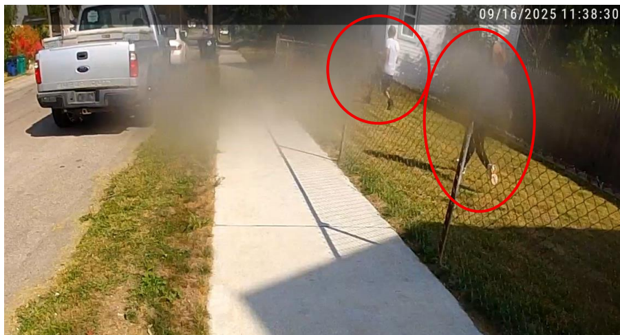
11:38:30 hours – Male and female subject running inside the fenced area

This document is the property of the Ohio Bureau of Criminal Investigation and is confidential in nature. Neither the document nor its contents are to be disseminated outside your agency except as provided by law - a statute, an administrative rule, or any rule of procedure.