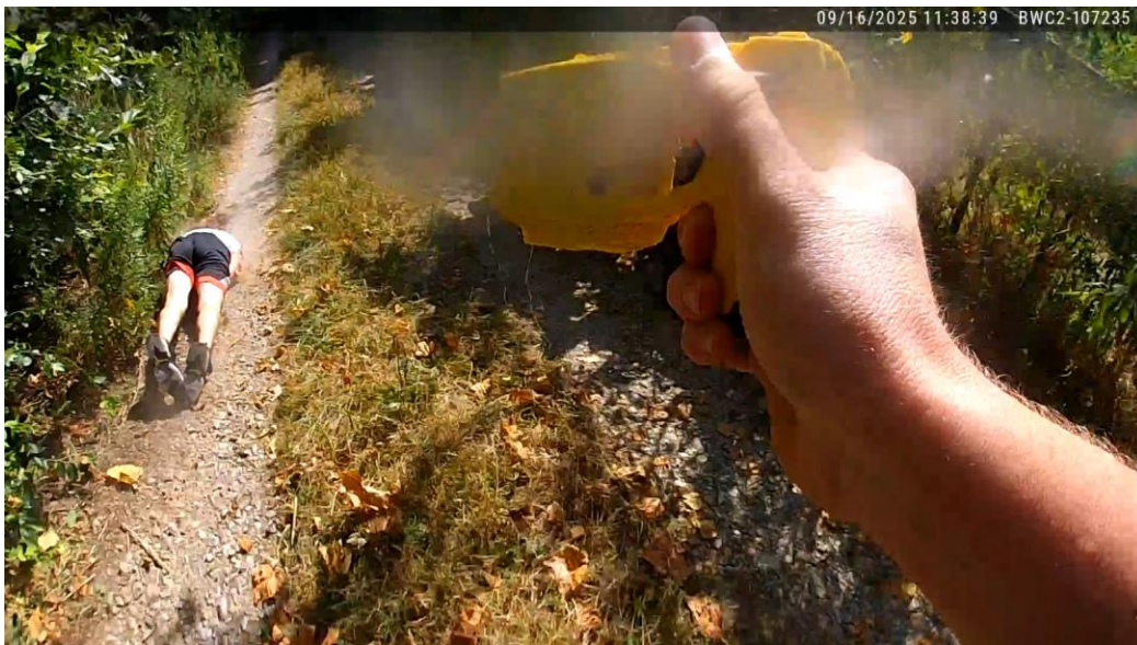
11:38:39 hours – Male subject on the ground