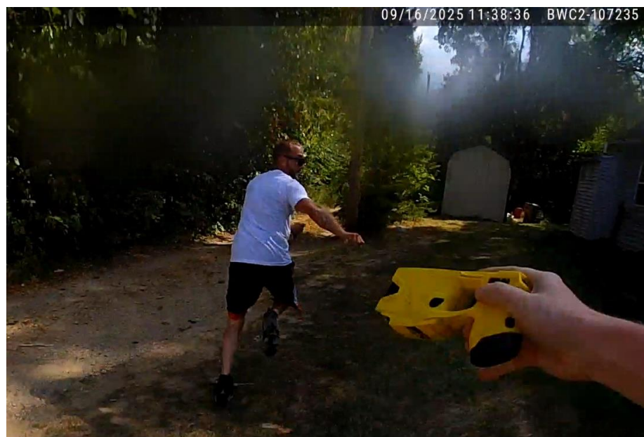
11:38:36 hours – Male subject running towards alleyway, looking back

This document is the property of the Ohio Bureau of Criminal Investigation and is confidential in nature. Neither the document nor its contents are to be disseminated outside your agency except as provided by law - a statute, an administrative rule, or any rule of procedure.