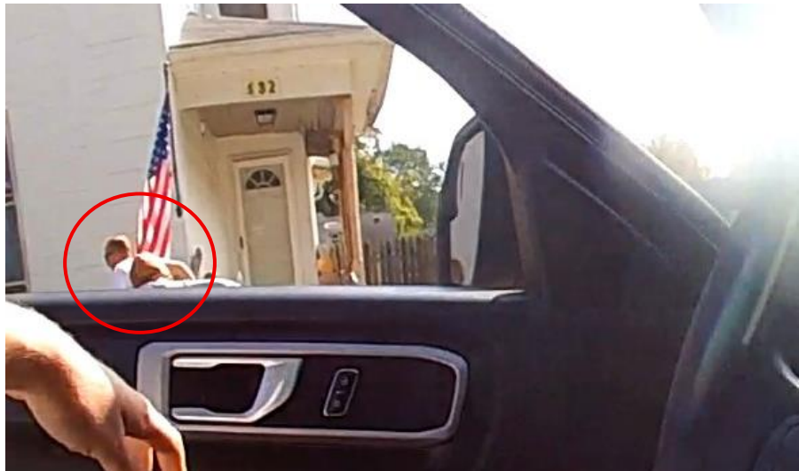
11:38:27 hours – Male and female subject running in front of 532 South Isabella