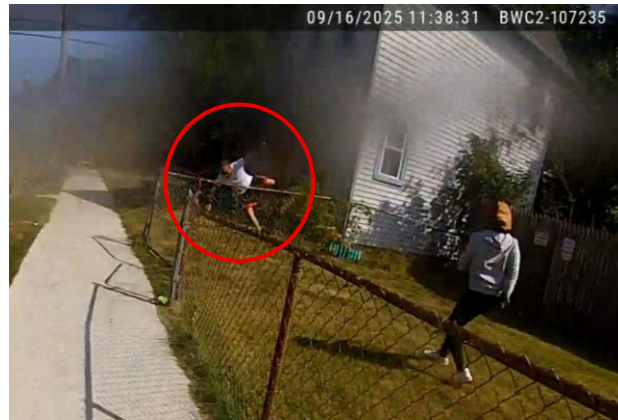
11:38:31 hours – Male subject hopped the fence