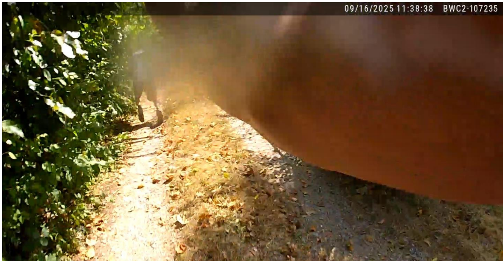
11:38:38 hours – Male subject stiffening up and falling

Officer Involved Critical Incident - 513 South Isabella St., Springfield, OH 45506 (L)