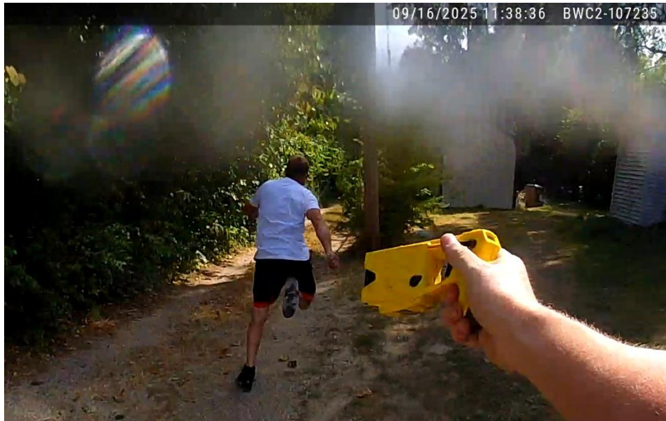
11:38:36 hours – Male subject running in alleyway

Officer Involved Critical Incident - 513 South Isabella St., Springfield, OH 45506 (L)