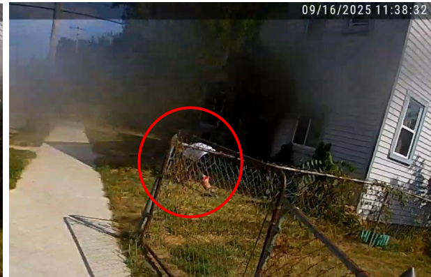
11:38:32 hours – Male subject fell to the ground and began running again