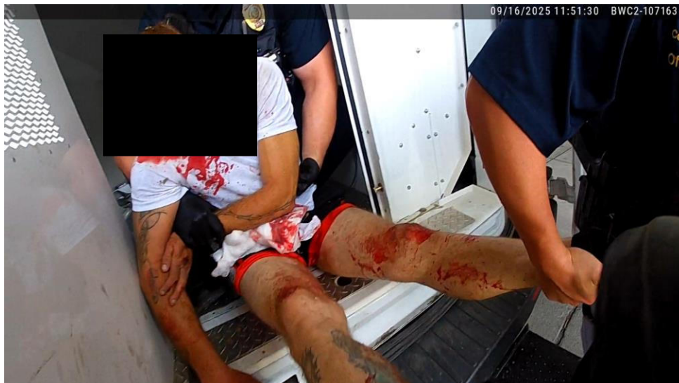
11:51:30 hours - Subject being unloaded from Police Van 40