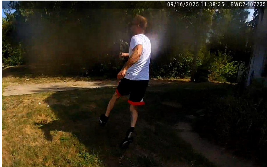
11:38:35 hours – Male subject with objects in his hands, while running away

Officer Involved Critical Incident - 513 South Isabella St., Springfield, OH 45506 (L)