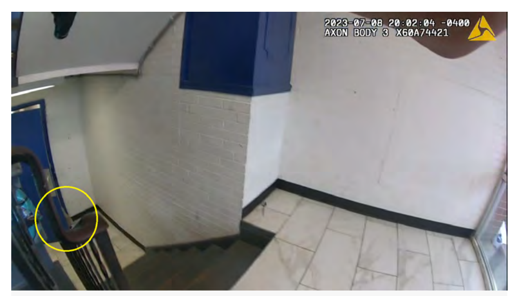
BWC 7: Executive yelling "Hey... hey!" at Lindsey as Lindsey disappeared behind blue hallway door (only Lindsey's left leg visible)