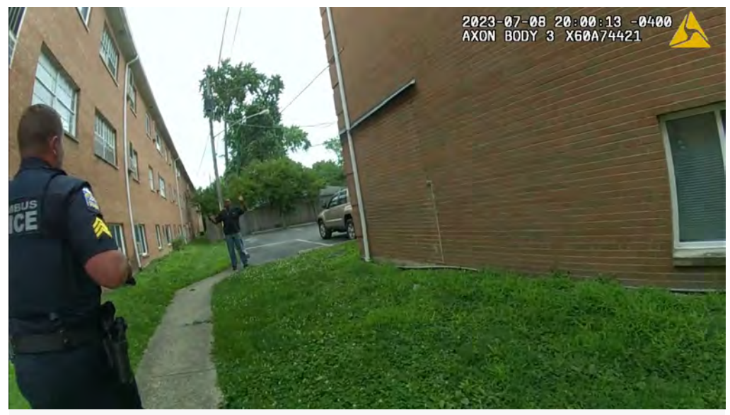
BWC 3: Sgt. Goodrich and encounter maintenance worker at northwest corner of building

advised officers "Everybody went to the front". Sgt. Goodrich inquired about a "back door" and the maintenance man advised the "cops" came out the back door and went towards the front of the building and identified himself as maintenance. At 20:00:29 hours, a single gunshot can be heard and CPD who who was running along the west side of the building can be seen looking behind him towards the front of the building in response to the gunshot (See Photo BWC 4'). Maintenance then advised "they" are inside the building. Dispatch can be heard on a radio stating "Be advised, county is advising that one of the suspects... at least one suspect went into an apartment. I don't know apartment number". At 20:00:41 hours, Sgt. Goodrich can be heard telling officers "Did you guys hear that? County guy exchanged fire up there" as he pointed towards cruiser (See Photo BWC 5').