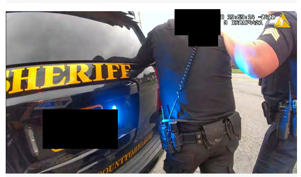
advising CPD officers he believed Lindsey had been shot and describer Lindsey as "Male Black, black shirt"

and Sgt. Goodrich walked along the west side of the building and confronted an African American male wearing a dark shirt and jeans at the northwest corner of the building (See Photo BWC 3'). That subject, later identified as maintenance, had his hands up and