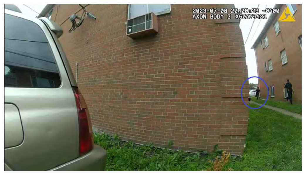
BWC 4: Single gunshot audible and seen turning towards direction gunshot originated