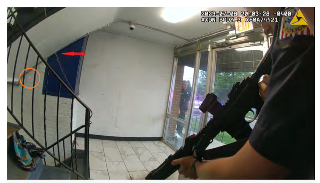
BWC 11: After the gunfire coming from the lower-level ceased, can be heard uttering "Fucking eh" and the laser sight and probe leads for Taser visible