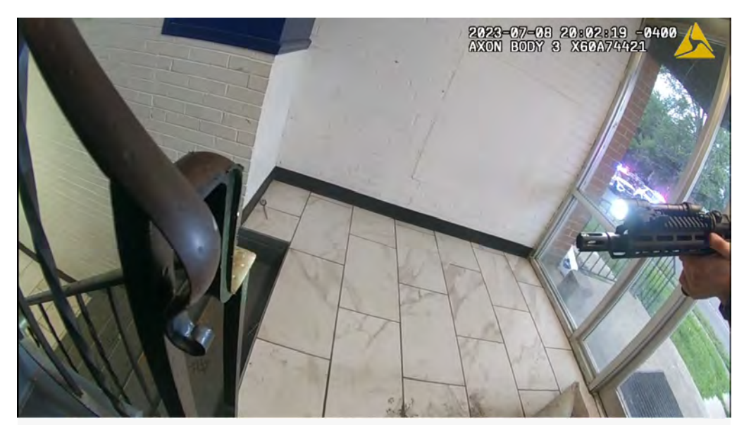
BWC 8: Officer Cook moves in front of heard yelling "Hey... don't you fucking grab that gun!" at Lindsey