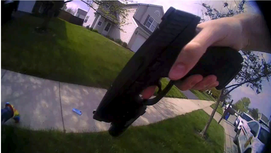
Figure 5: F13921, Reardon drawing firearm

Officer-Involved Critical Incident- 3171 Legion Ln, Columbus