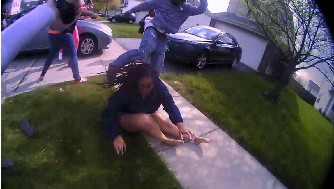
Figure 7: F13969, Object in Ma'Khia's right hand. Reardon with gun raised

Officer-Involved Critical Incident- 3171 Legion Ln, Columbus