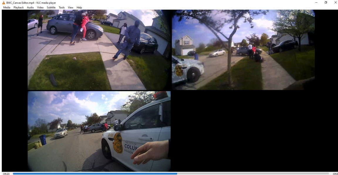
Figure 10: Positioning of officers during the shooting incident. SA Collins' canvas editor