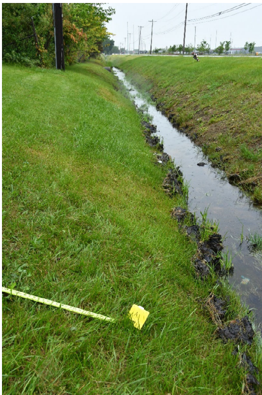
BCI Item A

The surrounding area was searched during daylight hours. One fired cartridge casing HORNADY 5.56 NATO was located on the west slope of the ditch near the east side of house Unit #327 located on Blue Jacket Drive. The casing was placed into a manila envelope and sealed with clear tape. It was retained as evidence ( BCI Item A ).