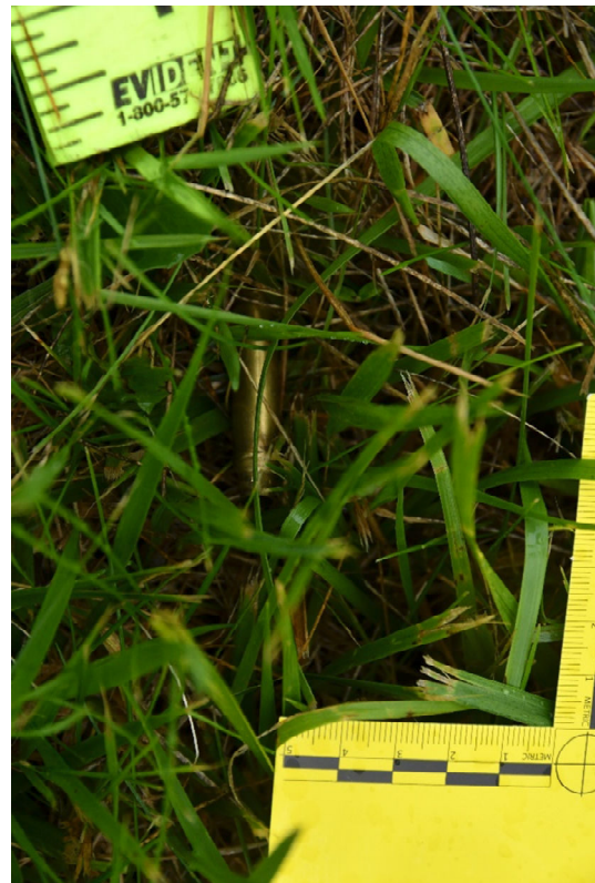
BCI Item A

The scene was cleared at approximately 0830 hours. BCI Item A was transferred to Bowling Green BCI and submitted to the lab on May 29, 2024. Please refer to the lab submission sheet for further information.