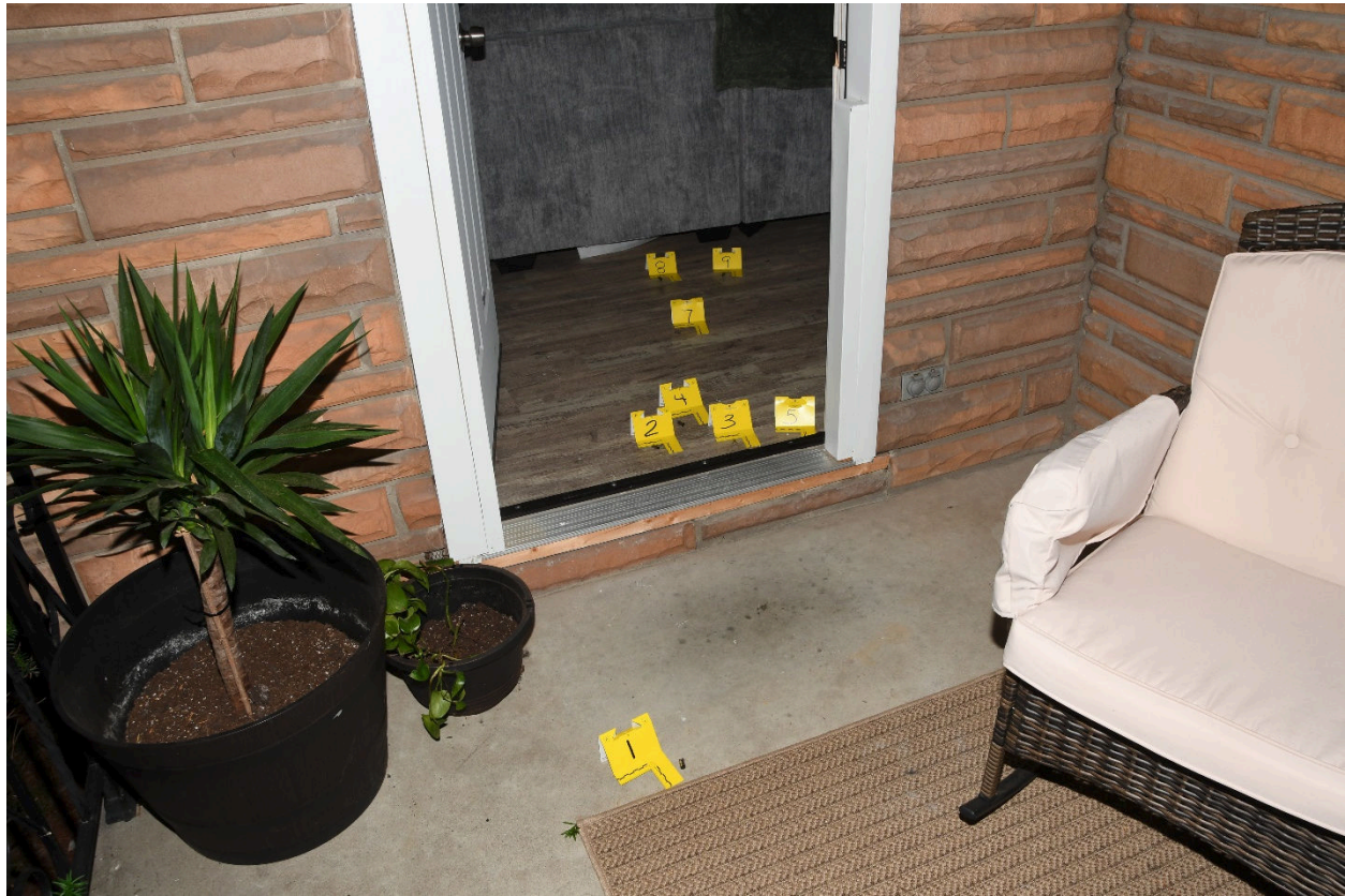
Figure 1: The front entry to the residence (photo taken facing Southwest on the front porch) showing the fired Hornady 9mm Luger +P cartridge casings.

Officer Involved Critical Incident - [REDACTED] Youngstown, Ohio 44509