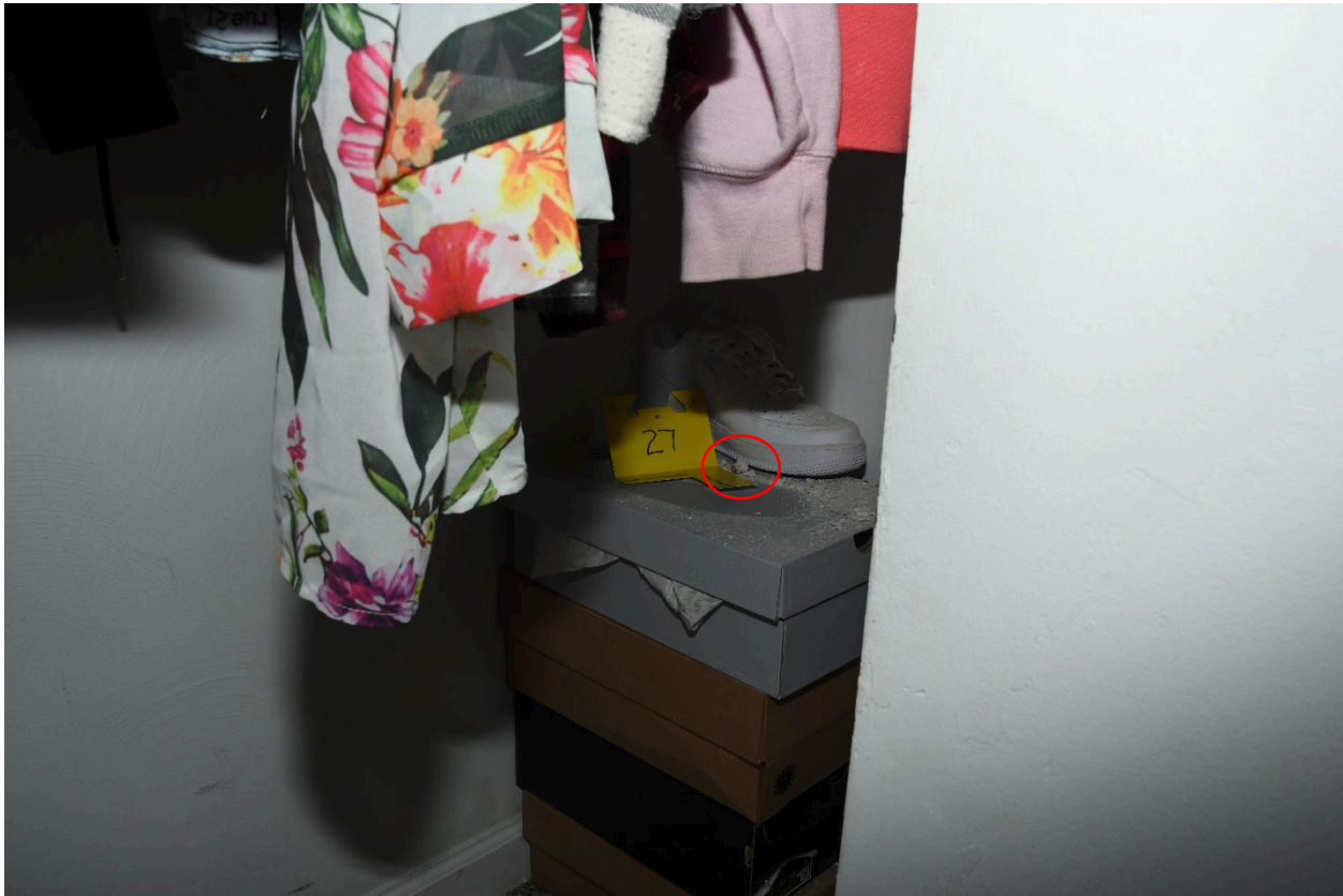
Figure 14: Projectile found during a search of the master bedroom closet.

Officer Involved Critical Incident - [REDACTED] Youngstown, Ohio 44509