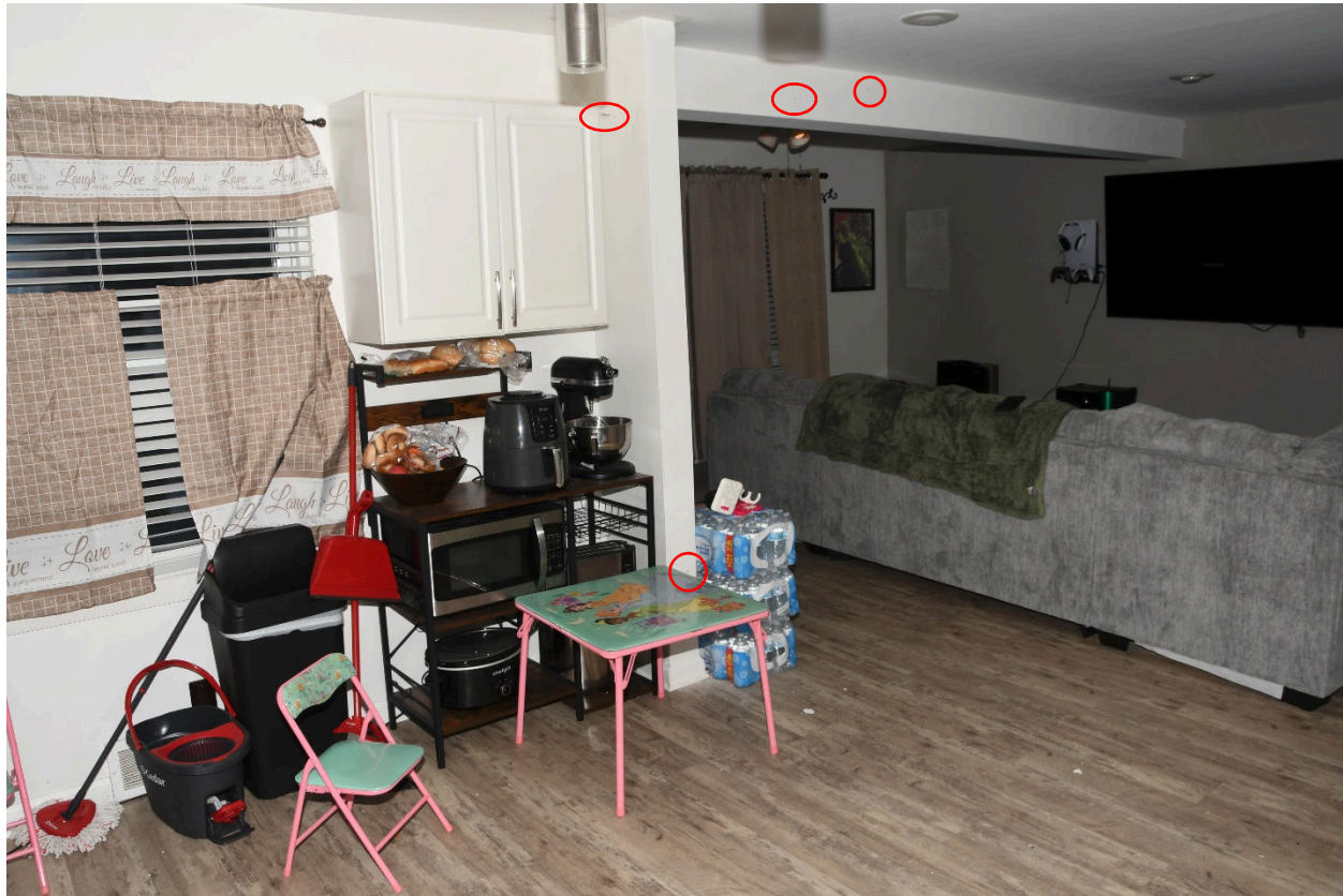
Figure 6: Photo from the kitchen, facing Southeast, showing ballistic impacts on the walls of the kitchen and living room.

Officer Involved Critical Incident - [REDACTED] Youngstown, Ohio 44509