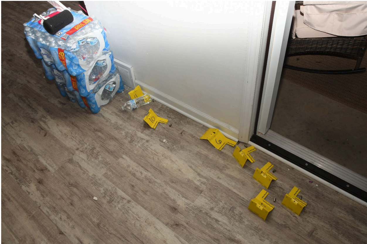
Figure 2: Inside the front doorway (photo taken in the living room facing Northwest) showing fired Hornady 9mm Luger +P cartridge casings.

Officer Involved Critical Incident - [REDACTED] Youngstown, Ohio 44509