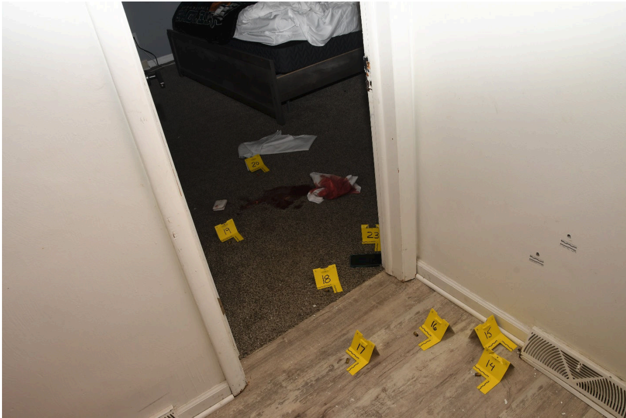
Figure 9: A view from the hallway, into the master bedroom. Two additional FC 9mm Luger cartridge casings (18-19) and one unfired FC 9mm Luger cartridge (20) are marked inside the room.

Officer Involved Critical Incident - [REDACTED] Youngstown, Ohio 44509