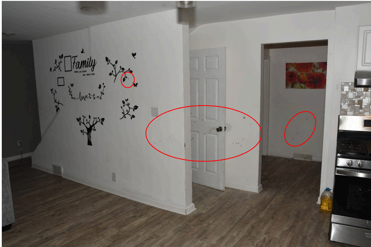
Figure 5: Photo from the kitchen, facing Southwest, showing ballistic impacts on the walls in the living room and the hallway.

Officer Involved Critical Incident - [REDACTED] Youngstown, Ohio 44509