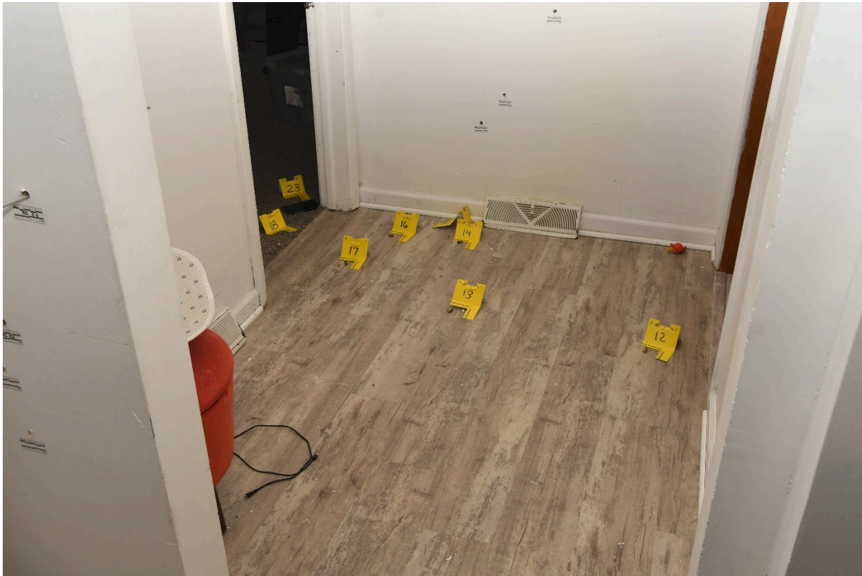
Figure 8: The hallway outside the first-floor master bedroom (opening on the left), where six fired FC 9mm Luger cartridge casings were recovered.

Officer Involved Critical Incident - [REDACTED] Youngstown, Ohio 44509