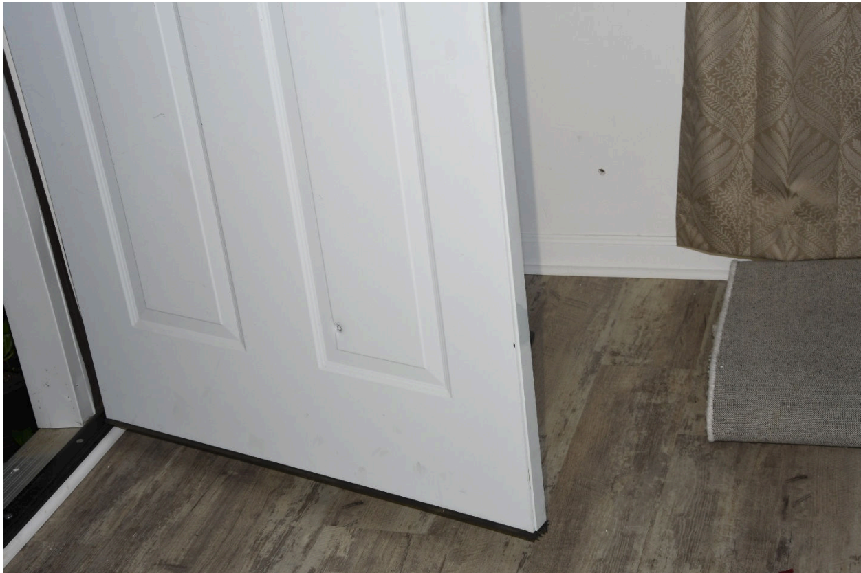
Figure 7: Perforating ballistic impact in the front door that terminated in the East wall of the living room.

Officer Involved Critical Incident - [REDACTED] Youngstown, Ohio 44509