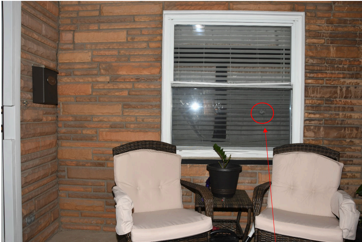
Figure 3: The front porch window of the residence showing a ballistic impact through the window and screen (Photo facing West).

Officer Involved Critical Incident - [REDACTED] Youngstown, Ohio 44509