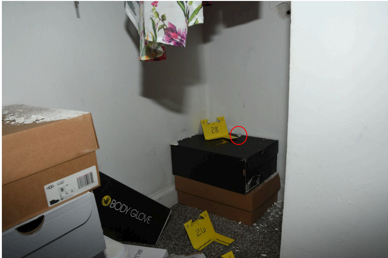
Figure 15: Projectile found during a search of the master bedroom closet.

Officer Involved Critical Incident - [REDACTED] Youngstown, Ohio 44509