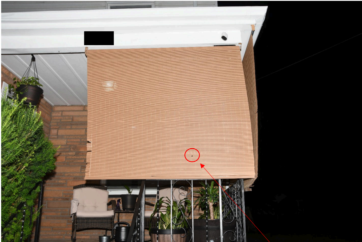
Figure 4: The outdoor blinds on the front porch bearing a ballistic impact .

Officer Involved Critical Incident - [REDACTED] Youngstown, Ohio 44509