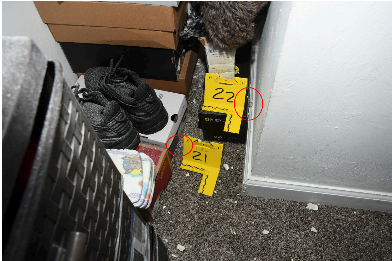
Figure 11: The master bedroom closet floor. Two projectiles can be seen.

Officer Involved Critical Incident - [REDACTED] Youngstown, Ohio 44509