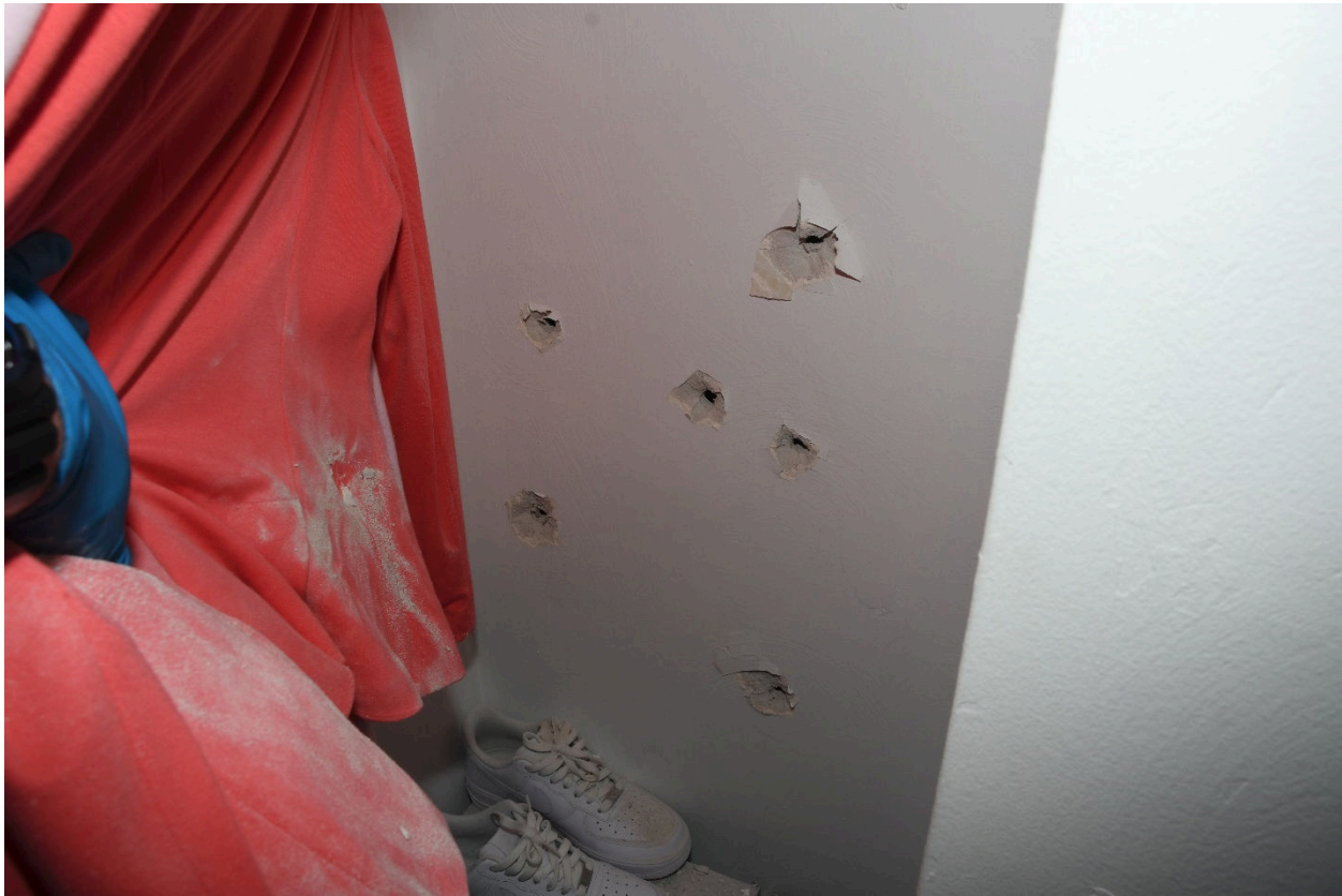
Figure 12: Six ballistic impacts in the East wall of the master bedroom closet.

Officer Involved Critical Incident - [REDACTED] Youngstown, Ohio 44509