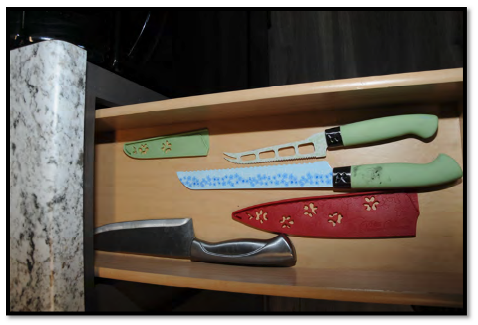
(Knives in kitchen drawer)

Officer Involved Critical Incident - 2469 Kimberly Pkwy. E, Columbus, OH 43232 (L)