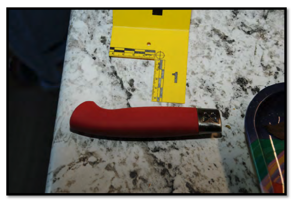
(Item 1: red knife handle from kitchen countertop)