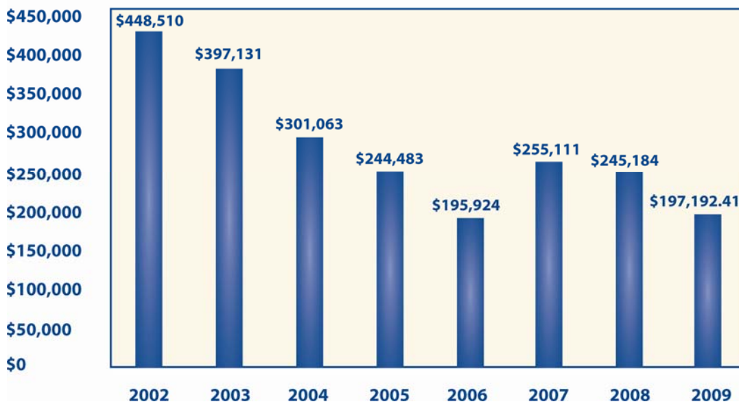
FIG. 5. ATTORNEY FEES FOR ASSISTANCE WITH COMPENSATION APPLICATIONS

Second, an attorney who assists a claimant with successfully obtaining a restraining order, custody order or other order to physically separate the victim from the offender could receive up to $150 per hour in fiscal 2009, not to exceed a total of $2,500, for assisting with such an order. This payment does not reduce any award granted to the victim.