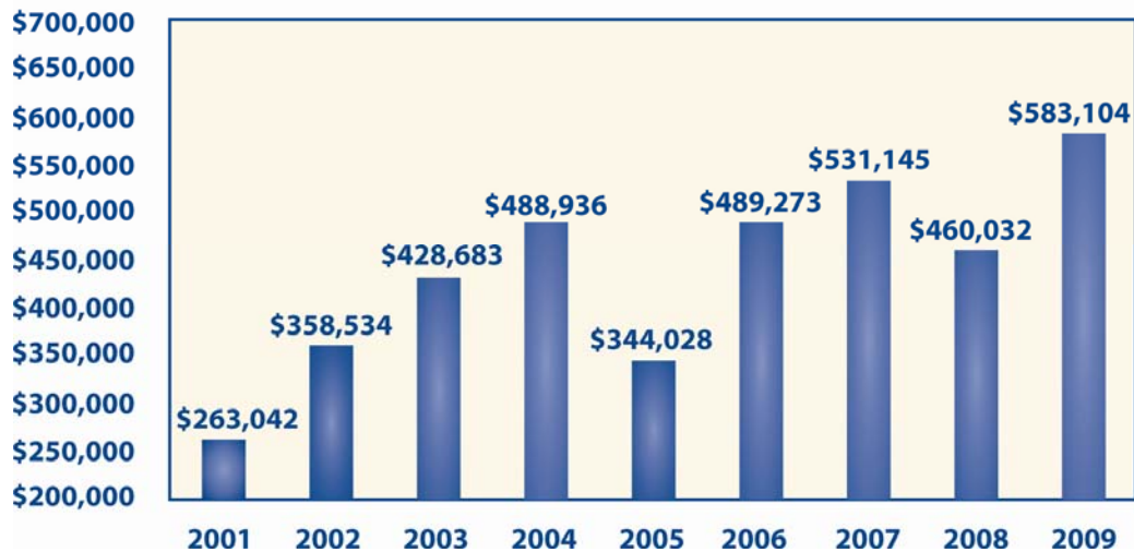
FIG. 4. SUBROGATION BY YEAR

The amount of subrogation funds collected in fiscal 2009 rose 21 percent from the year before, increasing from $460,032 in fiscal 2008 to $583,104. The largest portion ($314,151.50) was obtained through settlements.