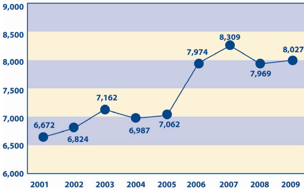
FIG. 1. COMPENSATION APPLICATIONS BY YEAR

Victims of assault received a higher number of awards than victims of any other crime (Fig. 2). Domestic violence, sexual assault and robbery victims followed in terms of frequency of awards.