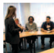
The Attorney General's Office offers training for board members of nonprofit organizations. For information, e-mail CharitableLaw@OhioAttorneyGeneral.gov .

Prior to adoption of the online filing system, hard-copy filings could not be converted into a usable database. In addition to being able to share information online, the Attorney General's Office also can generate reports, analyze data, and conduct other tests to further examine information provided in the filings.