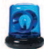
A Rapid Response Team is on call to respond statewide when help is needed with cases involving child victims.

The Attorney General's Office also held six free training courses on online investigations and child pornography in conjunction with the Franklin County Internet Crimes Against Children Task Force. Representatives of 20 law enforcement agencies and prosecutors' offices in 13 counties attended.