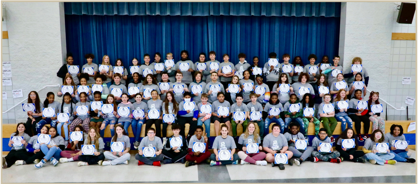
Students from Roosevelt Middle School