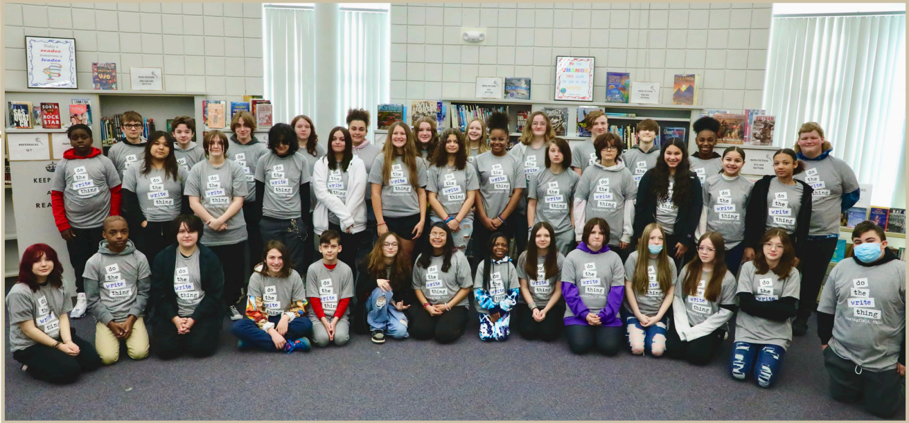
Students from Schaefer Middle School