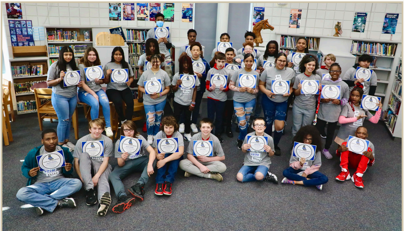
Students from Hayward Middle School