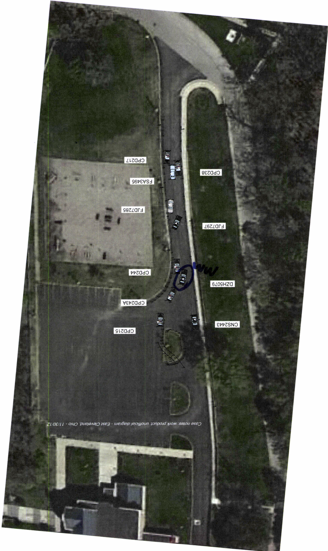
Case notes: work product; unofficial diagram - East Cleveland, Ohio - 11/30/12