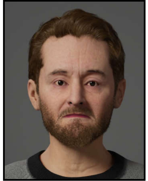
(Short Hair/Facial Hair FRONT VIEW)