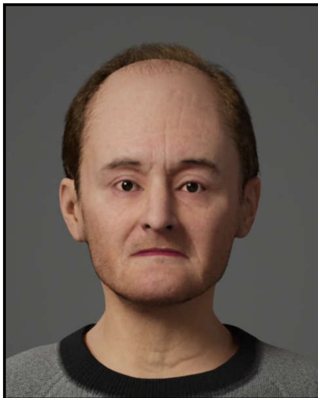
(Receding Hairline FRONT VIEW)

Anyone with information is asked to call the Stark County Sherriff's Office at 330-430-3823 or 330-451-3937.