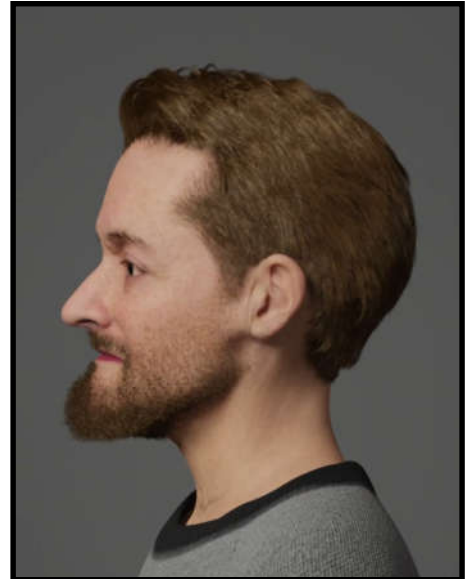
(Short Hair/Facial Hair PROFILE VIEW)