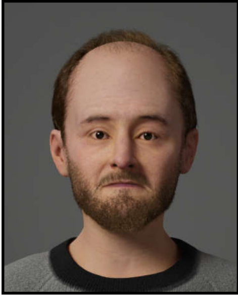
(Receding Hairline/Facial Hair FRONT VIEW)