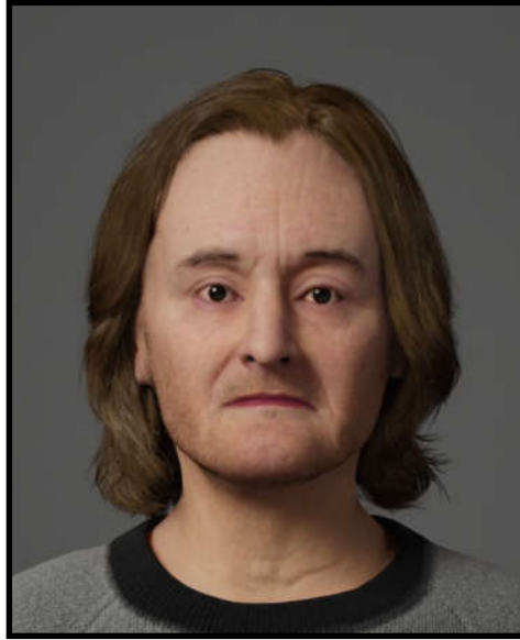
(Long Hair FRONT VIEW)