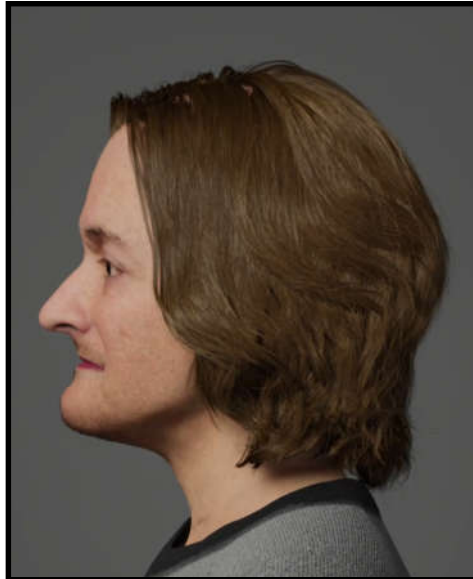
(Long Hair PROFILE VIEW)