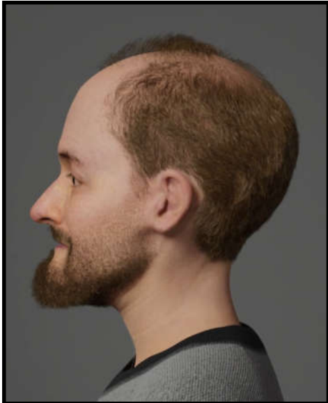
(Receding Hairline/Facial Hair PROFILE VIEW)