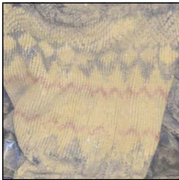
Fabric from knit sweater