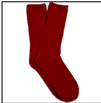
Not actual image