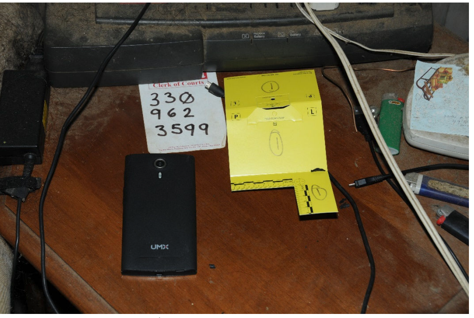
Figure 15, Item 1, Scene 2