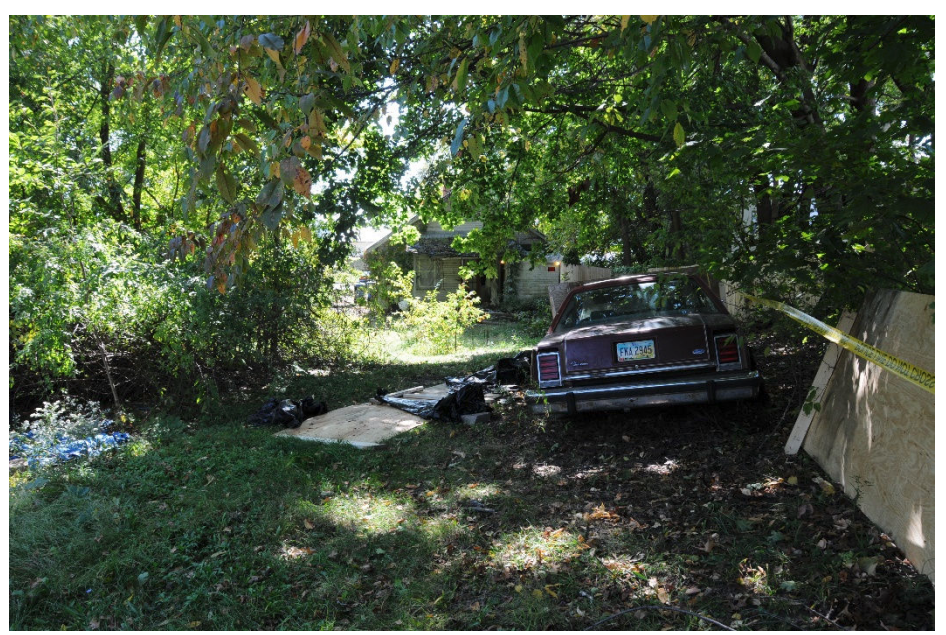
Figure 3, Overall photograph, subject vehicle and residence