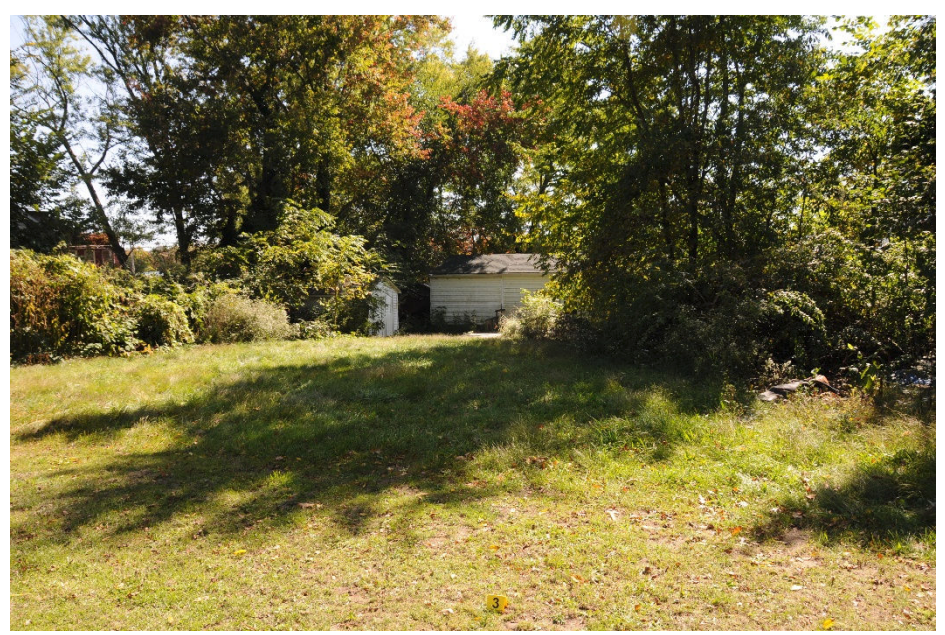
Figure 5, Overall photograph, incident area