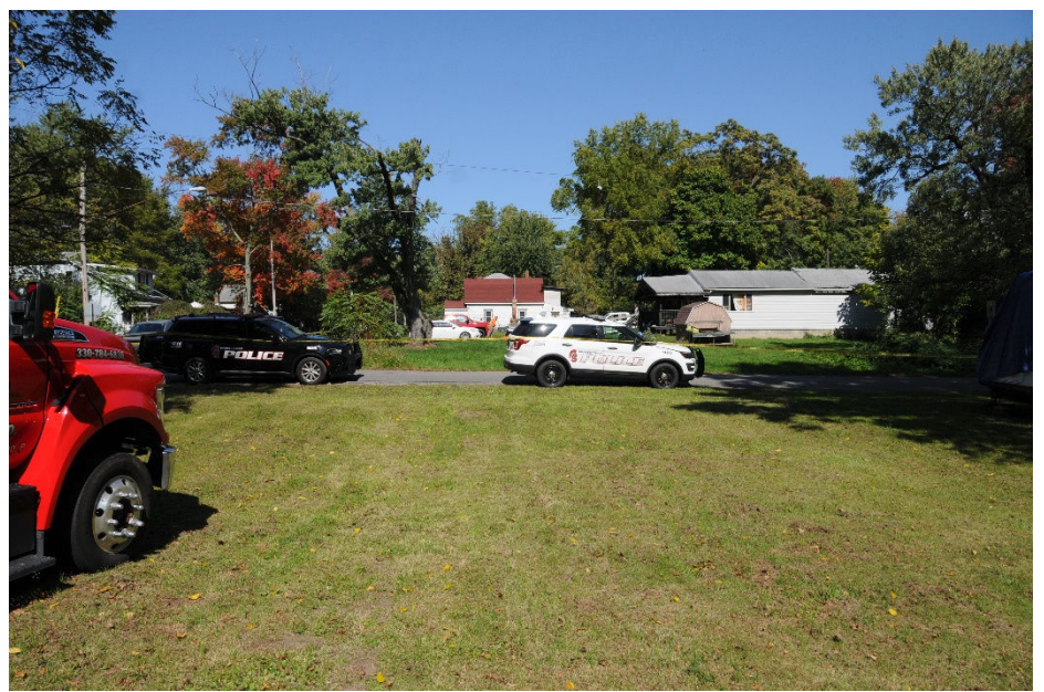
Figure 1, Overall photograph, Springfield Twp. Units on Margaret

learned that the evidence placards had been placed within the scene to identify items of suspected evidence and areas where officers reported that they were standing at or near the time of the incident. The evidence placards identifying items of suspected evidence were left in place and used to identify items of suspected evidence. The evidence placards identifying the areas where officers were reportedly standing at or near the time of the incident were collected after being photographed in place.