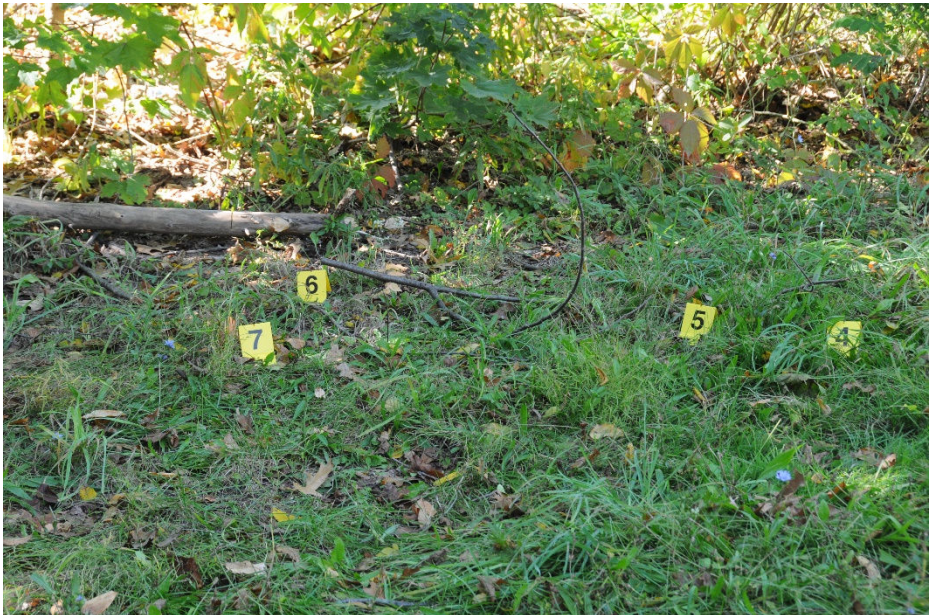
Figure 11, Items 4-7