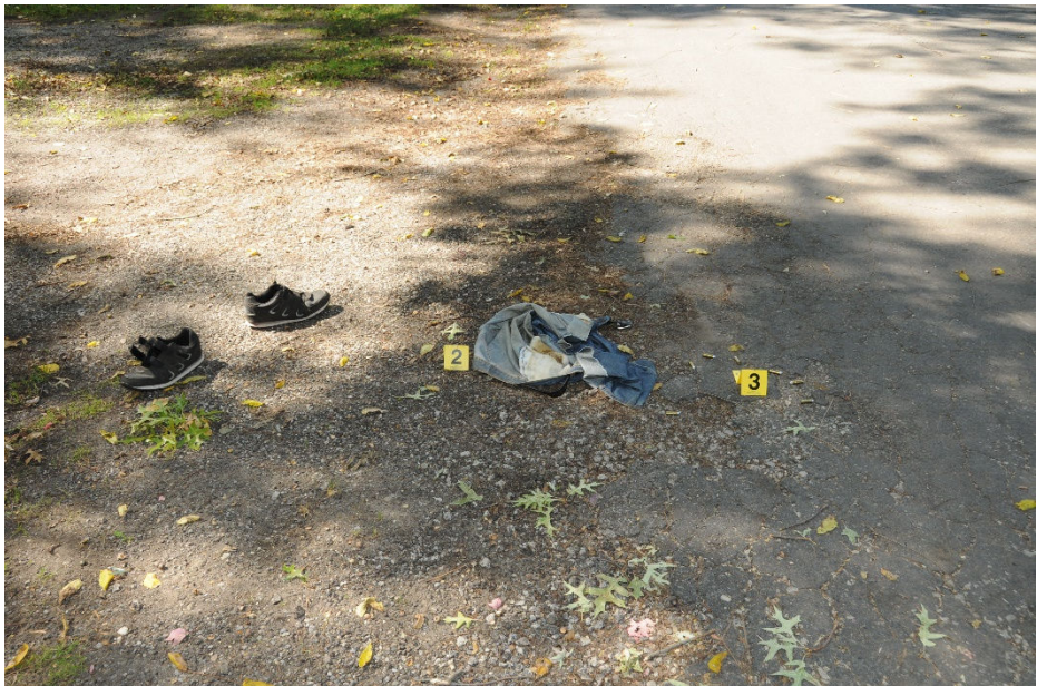
Figure 9, Items 2-3