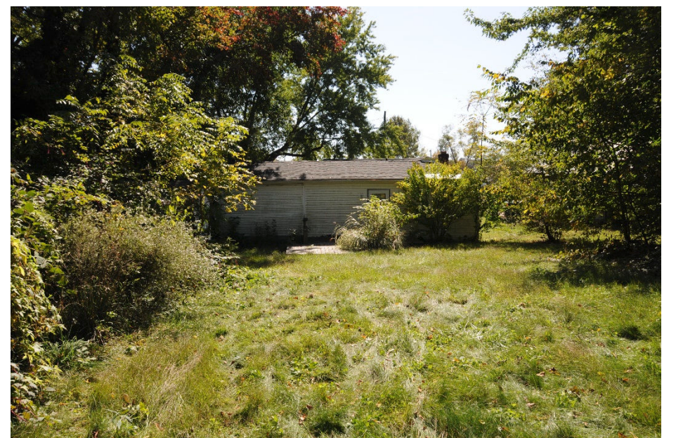
Figure 6, Overall photograph, incident area

The scene was further documented using a FARO Focus laser scanner. Using the scan data and SCENE software, panoramas were created and provided to investigators.