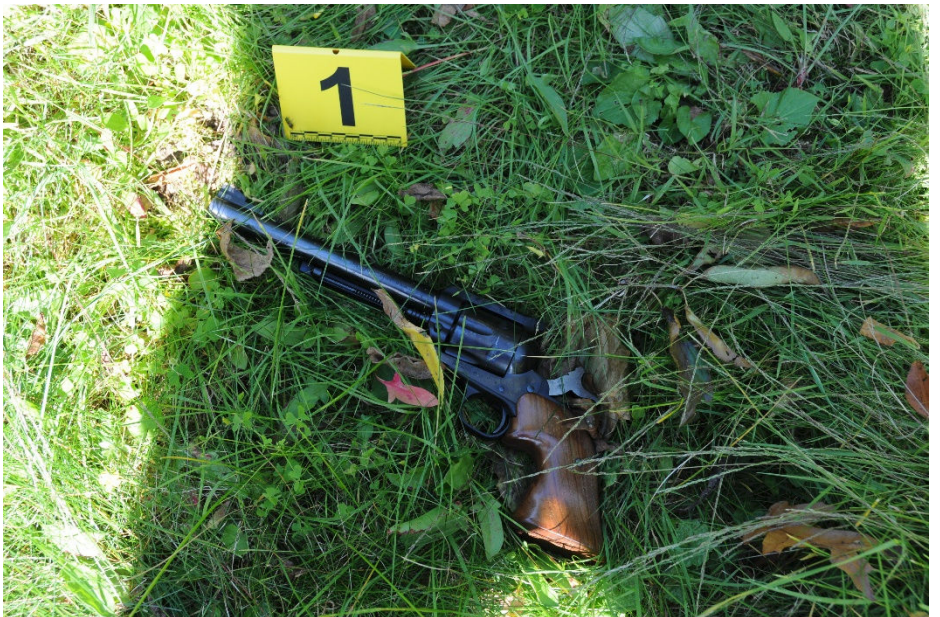
Figure 7, Item 1