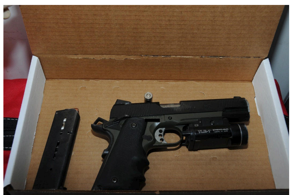
Figure 14, Item 10, Sgt. Gaffney

While processing the scene, SA Boerner learned that a search warrant had been obtained for the interior of the residence located at 2347 E. Waterloo Rd., Akron, Ohio 44312. SA Boerner proceeded to photograph the interior of the residence as it was found. The interior of the residence was examined for items of suspected evidence and two items of suspected evidence were photographed and collected (Table 3, Items of Suspected Evidence) (Figures 15-16, Items 1-2, Scene 2).