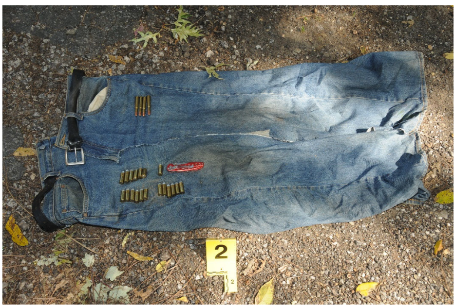
Figure 10, Items 2-2.1