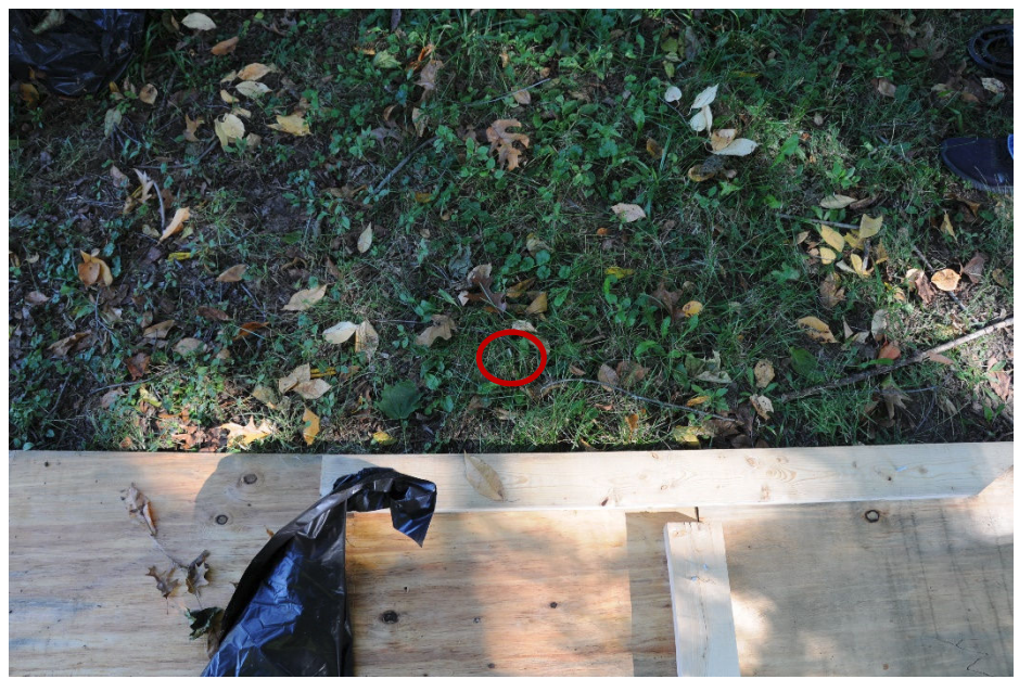
Figure 12, Item 8