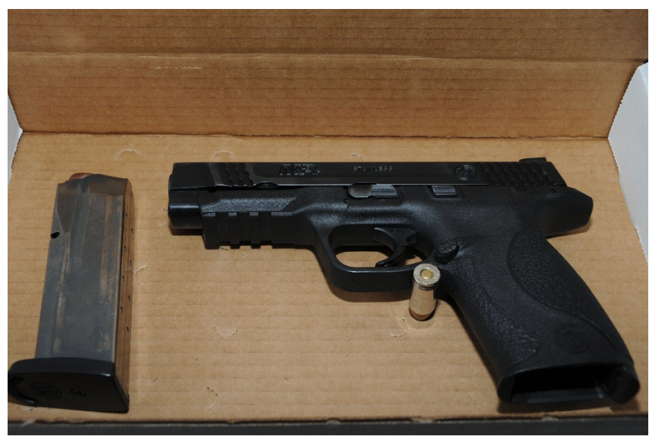
Figure 13, Item 9, Chief Simone