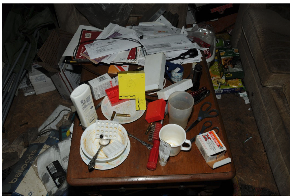
Figure 16, Item 2, Scene 2